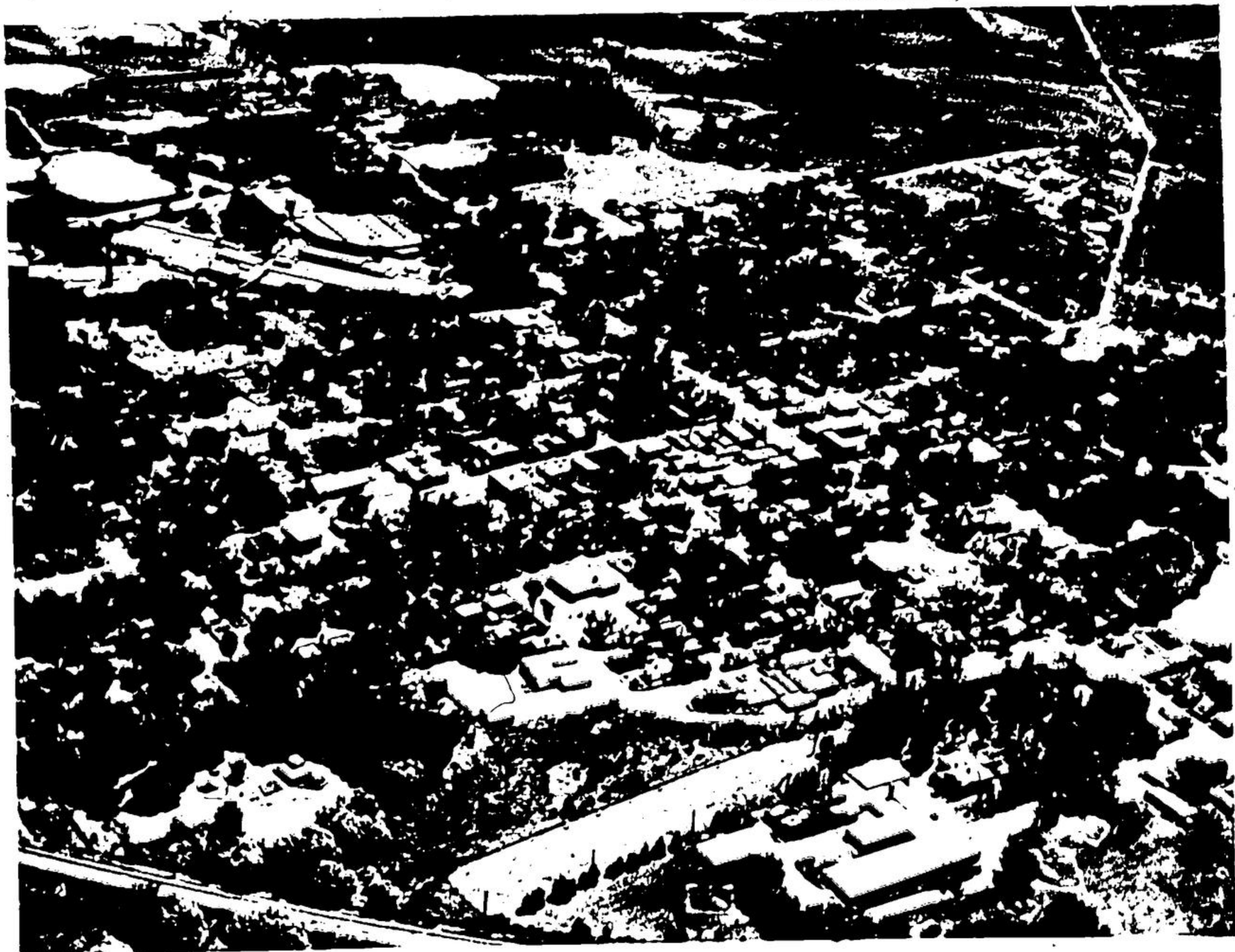
Aerial photograph by Ed Long of R.R. 4 shows the older parts of Acton from the air in clear detail.

Shred 1 medium cabbage and two medium carrots. Combine 1/2 cup mayonnaise, 2 Tbsp. vinegar, 4 tsp. sugar, 1 tsp. salt. Pour over cabbage and mix lightly.