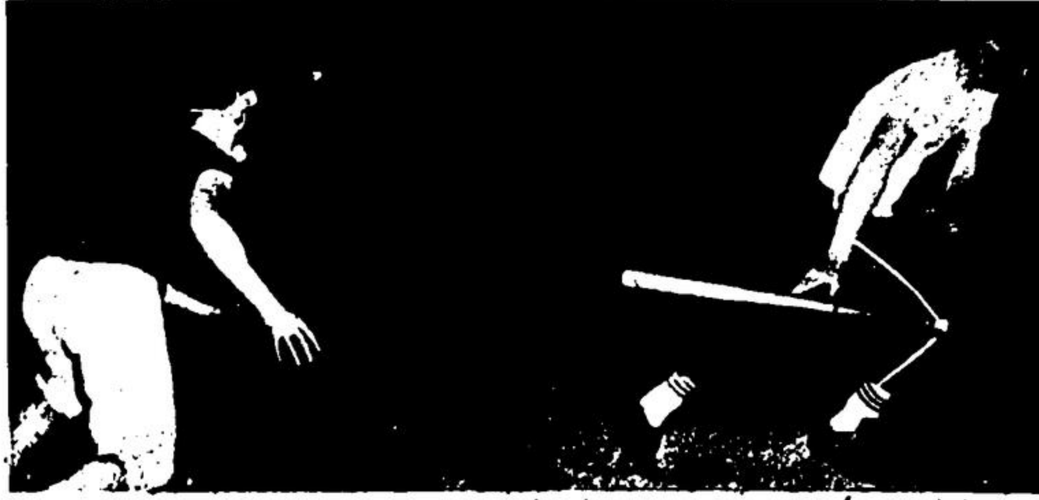
BRIAN FARRELL heads for first after bunting in the last half of the seventh as Station Hotel lost to the league leading Brampton team.