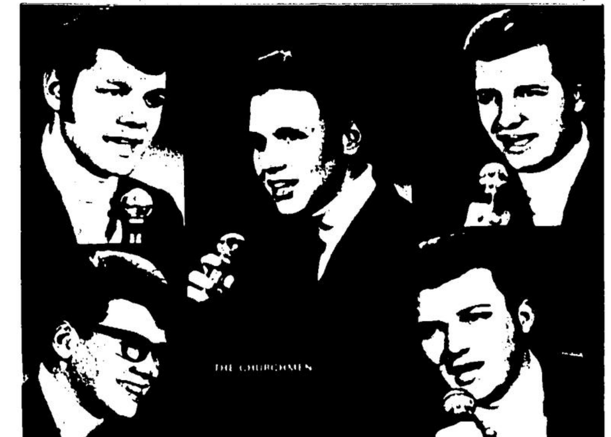
COMING TO ACTON BAPTIST CHURCH SUNDAY, MAY 25th, 1969