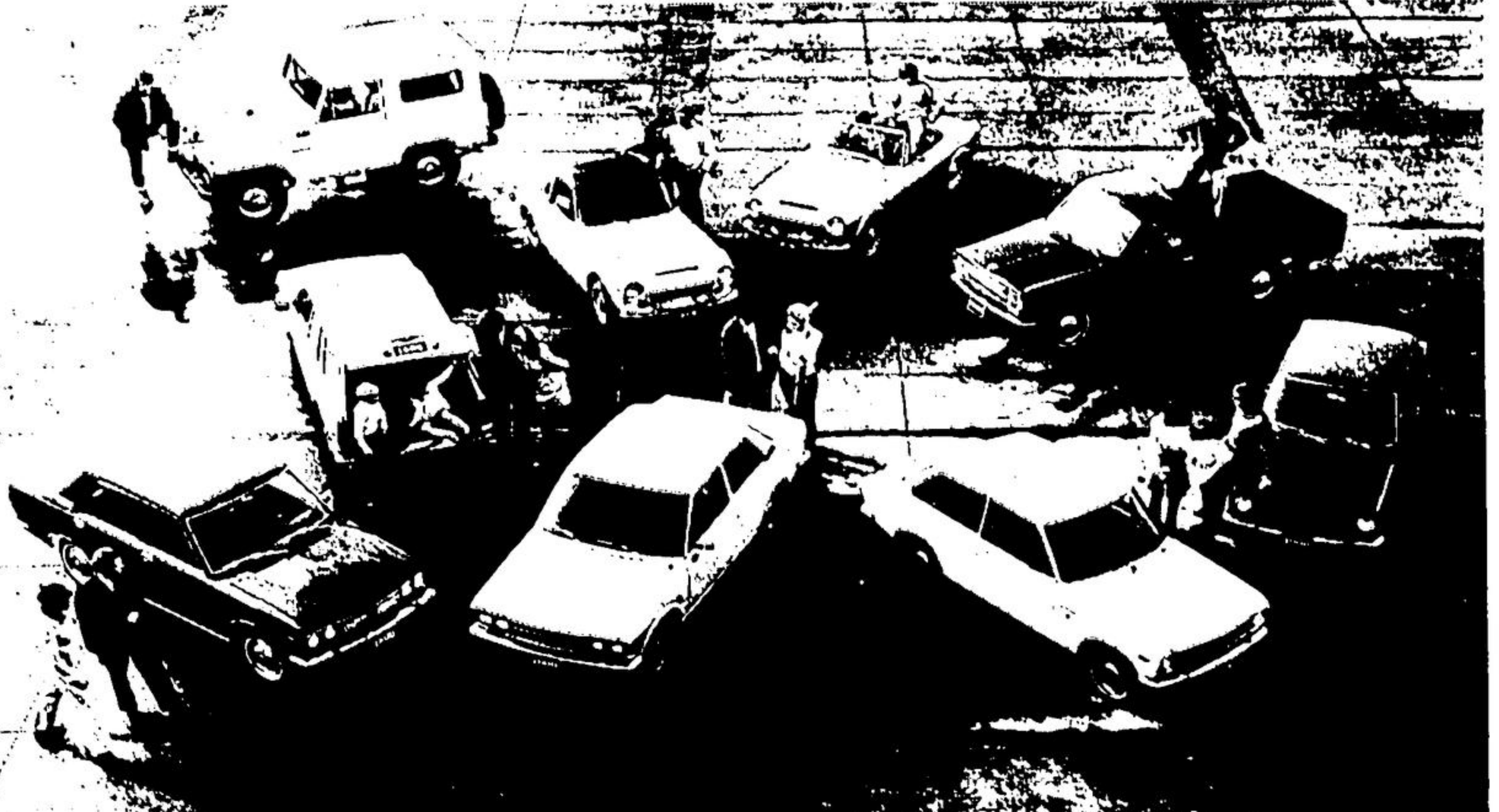
There's a Datsun for you: 1000 2-Door and 4-Door Deluxe Sedans, 1600 2-Door Sedan, 4-Door Deluxe Sedan and Wagon, 1600 and 2000 Sports, Pickup and 4-Wheel Drive Patrol.

These are the Datsuns that are setting new sales records clear across Canada! Come and try out the newest thing in the small car world Datsun 1000. It's got everything including: a kicky 62 hp engine that squeezes up to 40 miles per gallon, reclining bucket seats, carpets and all the extras as standard equipment. Or give the new Datsun 1600 a whirl. There's a sporty 2-door, deluxe 4-door and wagon. You get a high-performance 96 hp overhead cam engine, 100 mph, 30-35 mpg, all-independent suspension and all the extras. How about sports cars? Both the 1600 sports and 2000 go ZAP! ... and out of sight! If it's a small truck you're after, get the pickup that outsells all other imported trucks combined in North America.