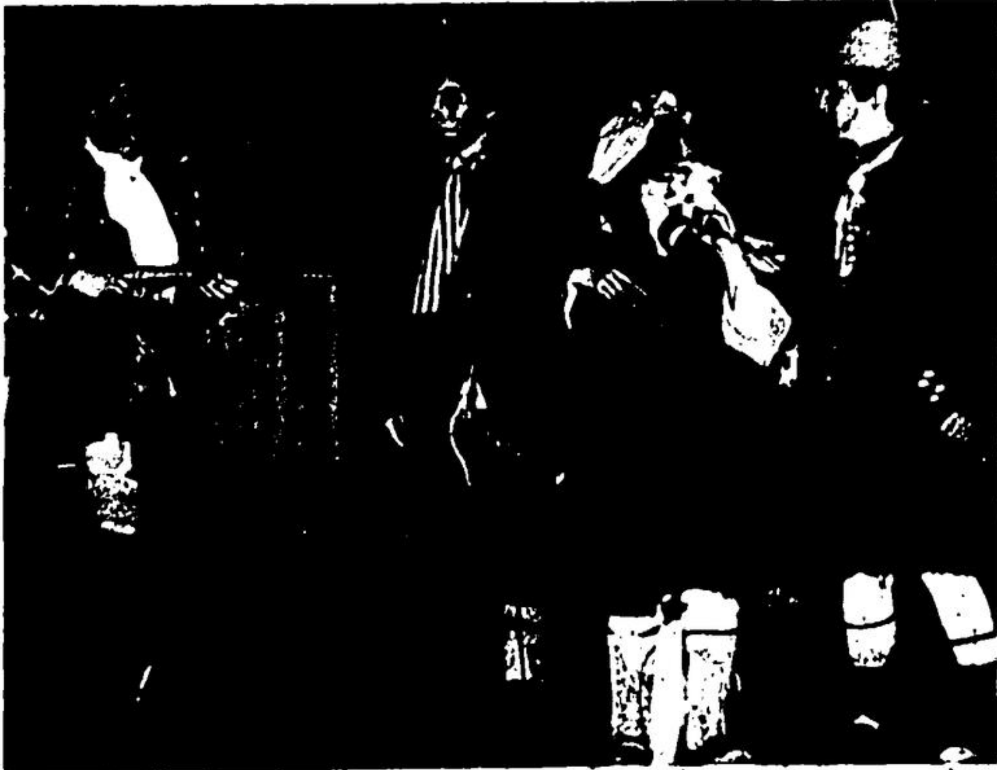
IT TOOK SOME coercion to get the groom to co-operate and some urging for the bride but Person Jordan finally got this couple matched up after much scratching, wiggling on a bottle and some country entertainment. Cast of the wedding was all girls.

A financial campaign is underway at St. Alban's. The directors of the campaign have been meeting with representatives of the Anglican Campaign Counselling Service, a department of the church house in Toronto.