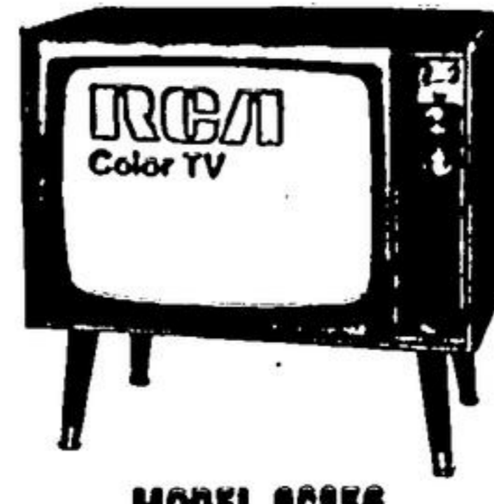
MODEL 9C855 COLOR TV

RCA Lifetime guarantee on the Solid Copper Circuits. Smart, compact console. Color picture guaranteed 3 years. RCA transistorized Mark II chassis.