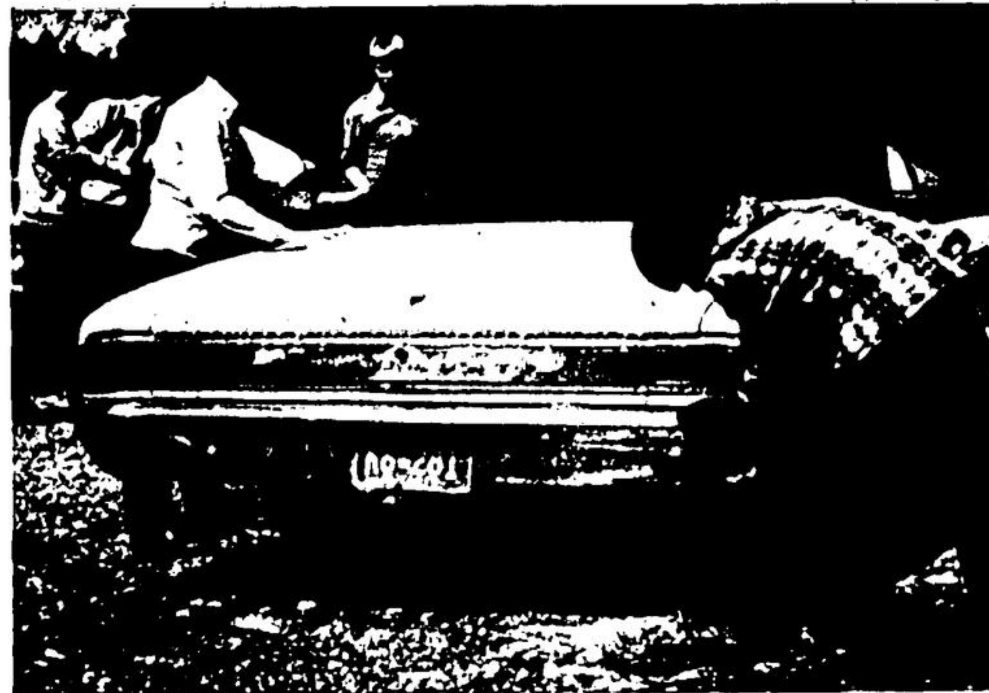
VENTURERS FROM THE EDEN MILLS staged their own car wash Saturday to raise funds for projects this year. Organizers called the car wash a success. Vehicles were washed at the community hall parking lot.

Don't fire it! Forest fire prevention is everybody's business. Keep Ontario green.