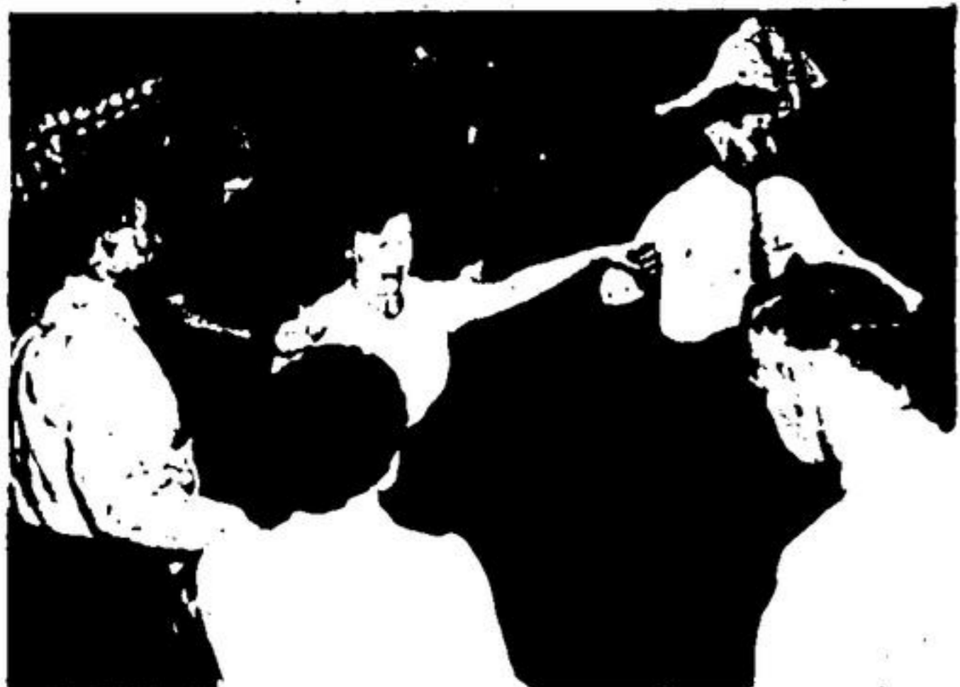
ALL CIRCLES GO TO THE WEST as the Pairs and Squares kick up their heels at Saturday's graduation exercises.