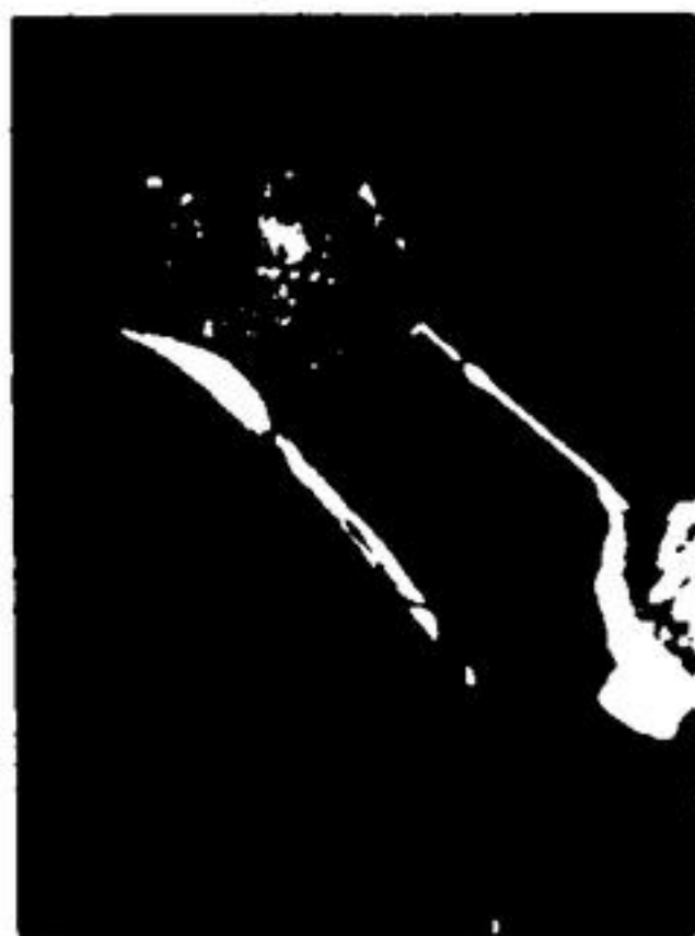
NORM WILCOX, one of Ontario's best square dance callers put the dancers through their paces. "We're lucky to get Norm," Pairs and Squares head Harold Denny admits. Norm hails from Brampton.