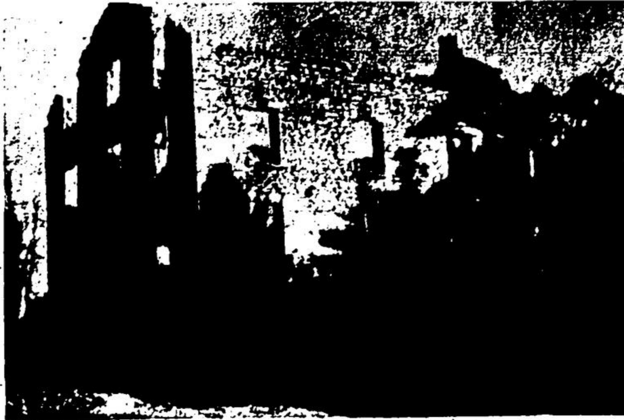
LONG GONE UNDER the wreckers' hammers the old grist mill situated near the dam at the Rockwood Conservation area was a busy spot during the pioneer days of Rockwood and vicinity.