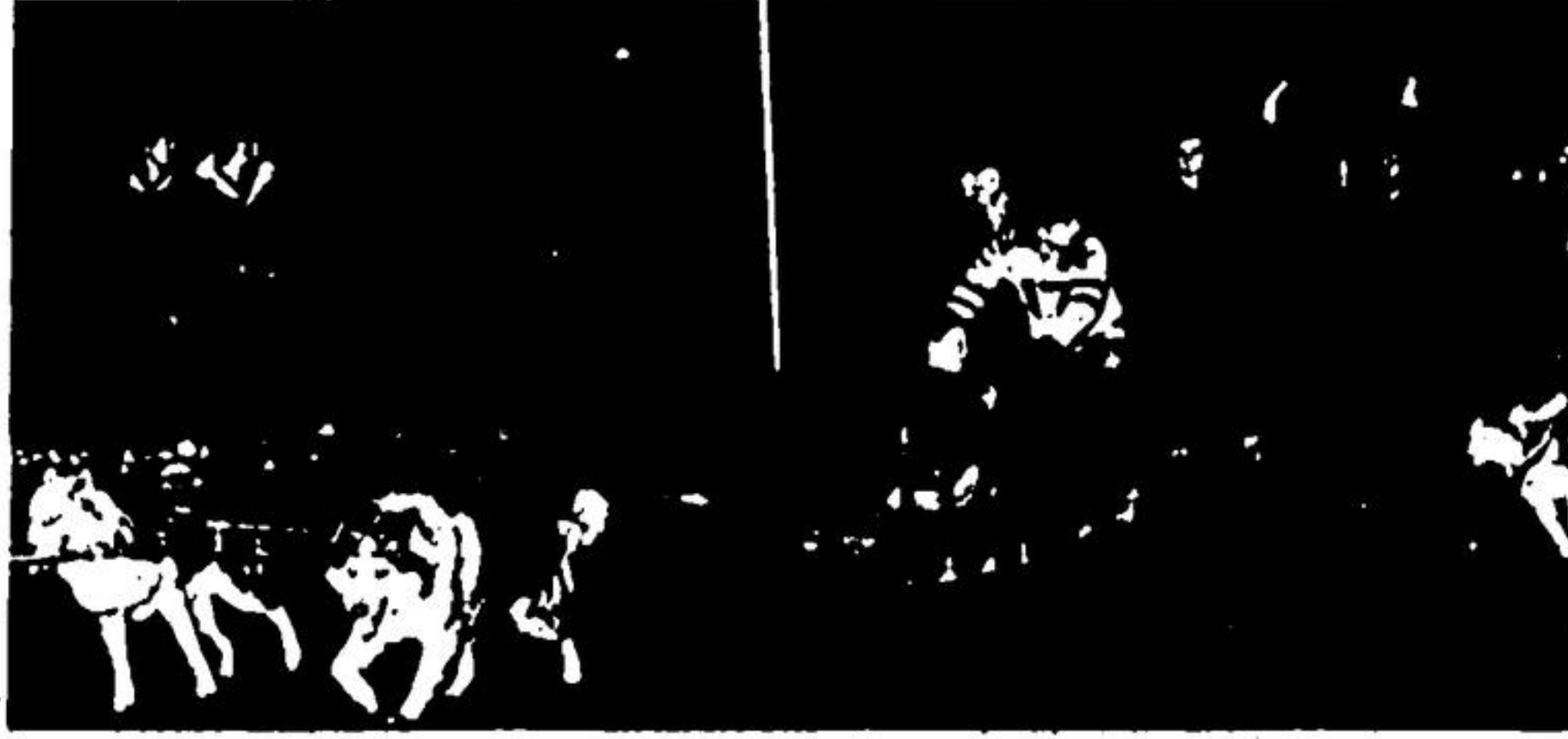
Parading day floats