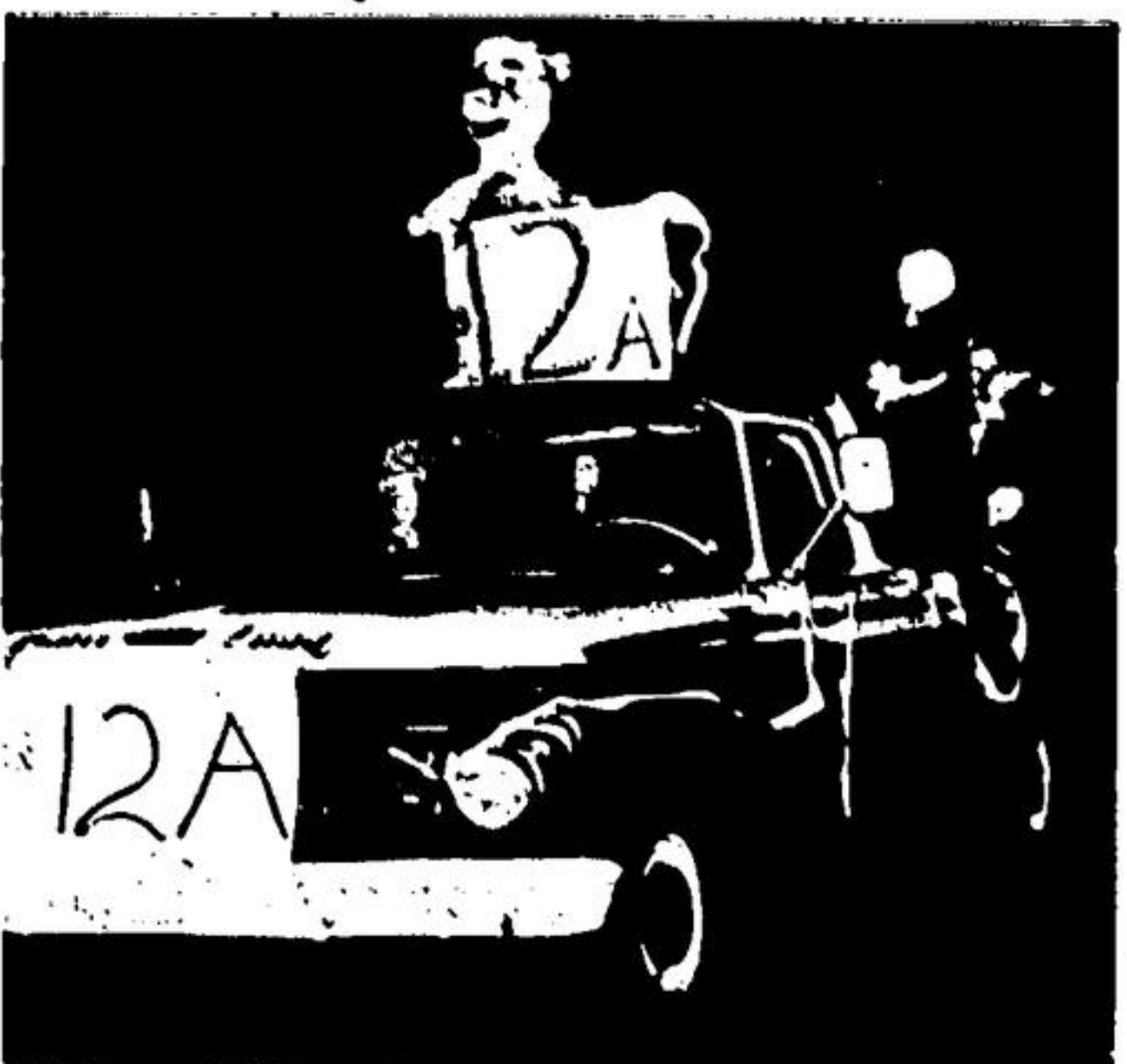
Riding high in the parade