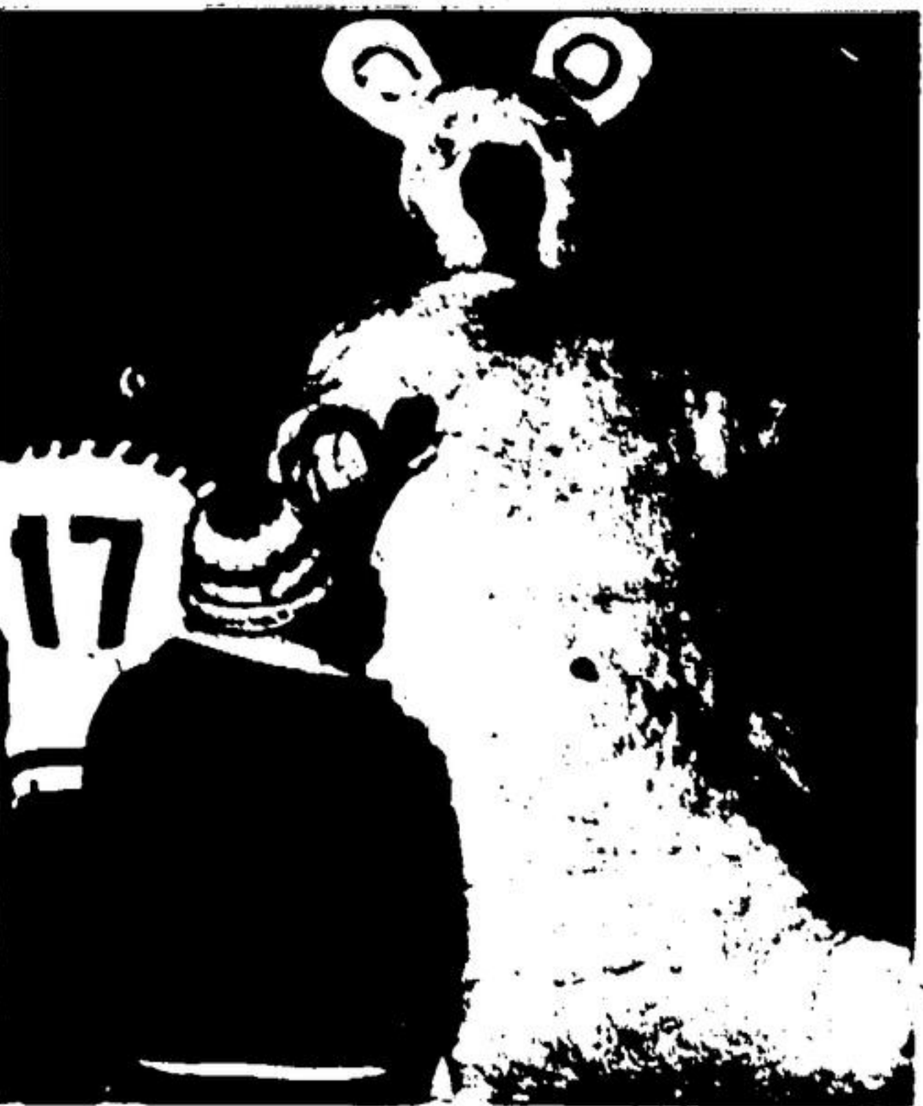
Torchlit carnival bear