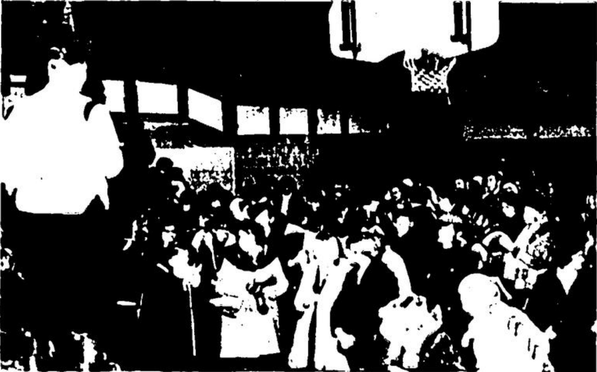
The crowd after the torchlight parade