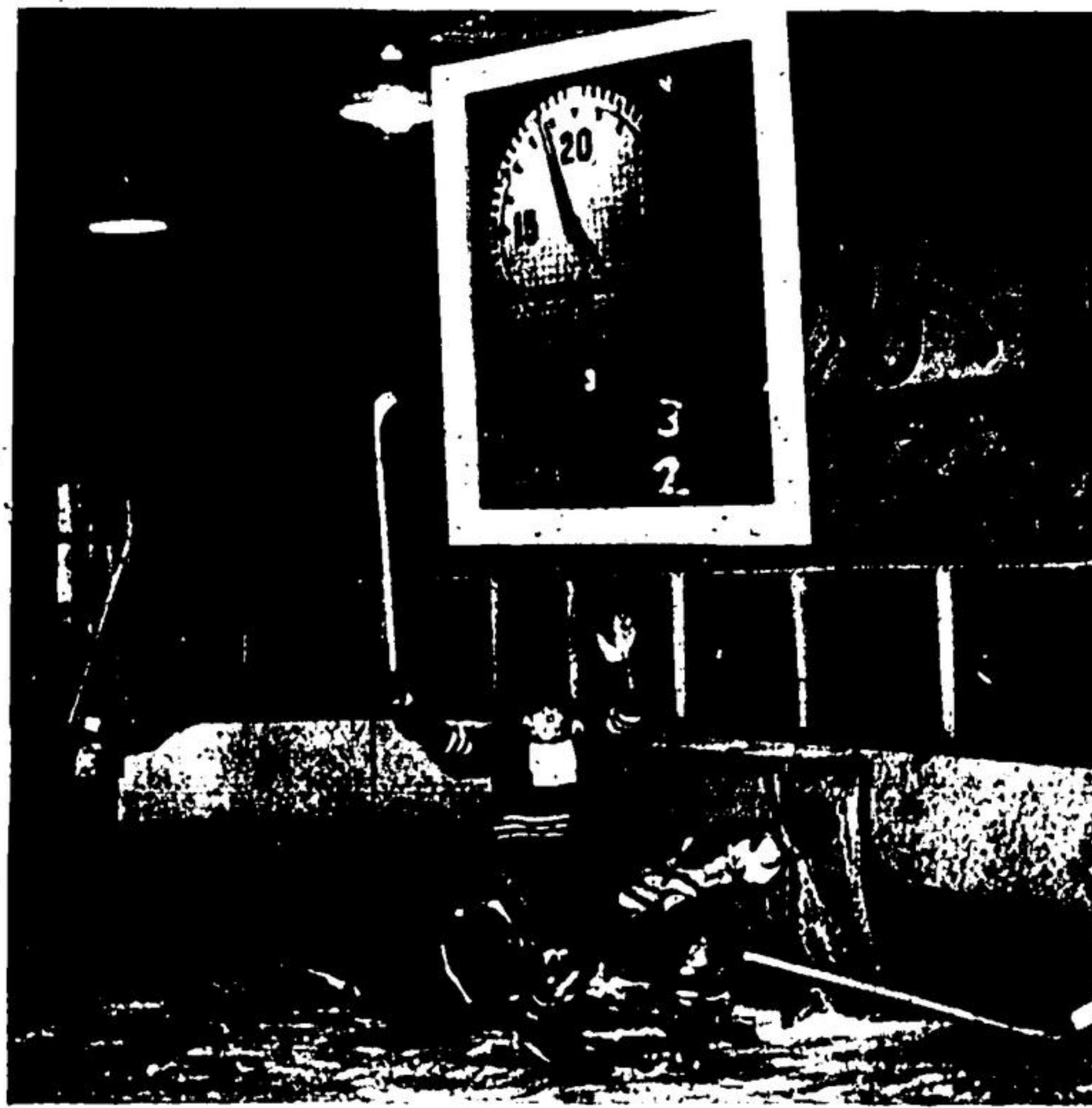
THE FERUGS DEFENSEMAN shows his chagrin after he banked the puck into his own net to tie the O.M.H.A. Bantam B. Playoff opener here last

The Acton club will continue to play exhibitions.