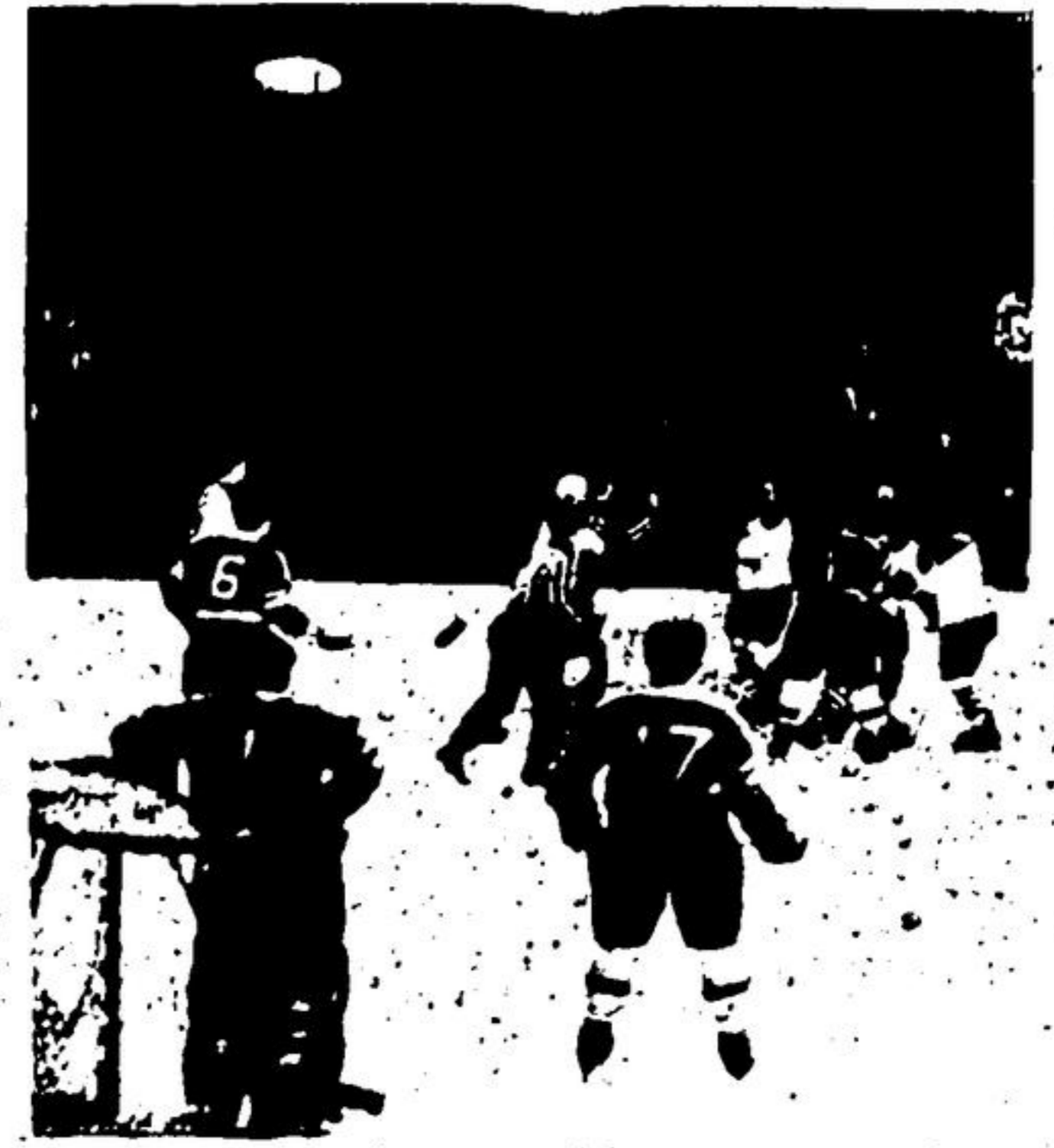
TEMPERS FLARED in the final minutes of Friday's contest as Cole of the Raiders tried to get at fans who grabbed him. The referee tabbed the Georgetown player with a match misconduct for his part in the fracas. Officials soon broke the high stick party up.

The Acton Free Press, Wednesday, January 29, 1969