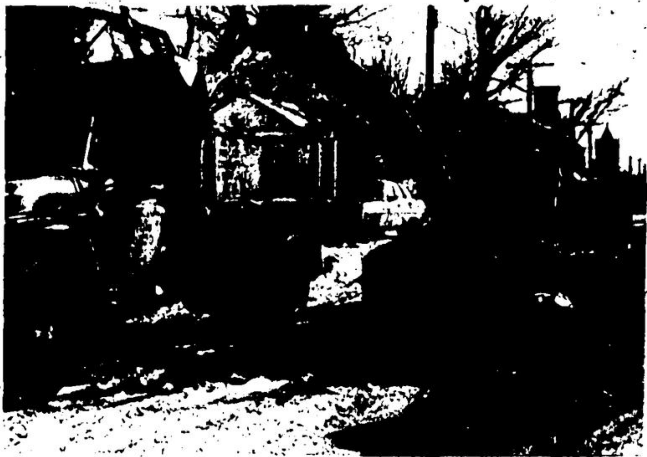
AFTER A BLOW COMES THE BLOWER. If council decided to buy it for town use. The machine demonstrated its ability to fill a truck in two minutes during a run through town on Monday. Many town officials feel it could be the answer to complaints of clogged streets and plowed-in laneways. No decision has been made as yet.