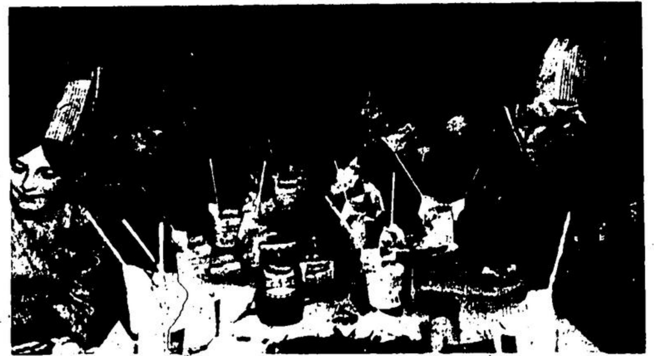
HOT DOGS, DOUGHNUTS and chocolate milk employees' association sponsors the annual event at Macro Plastics Christmas party. The