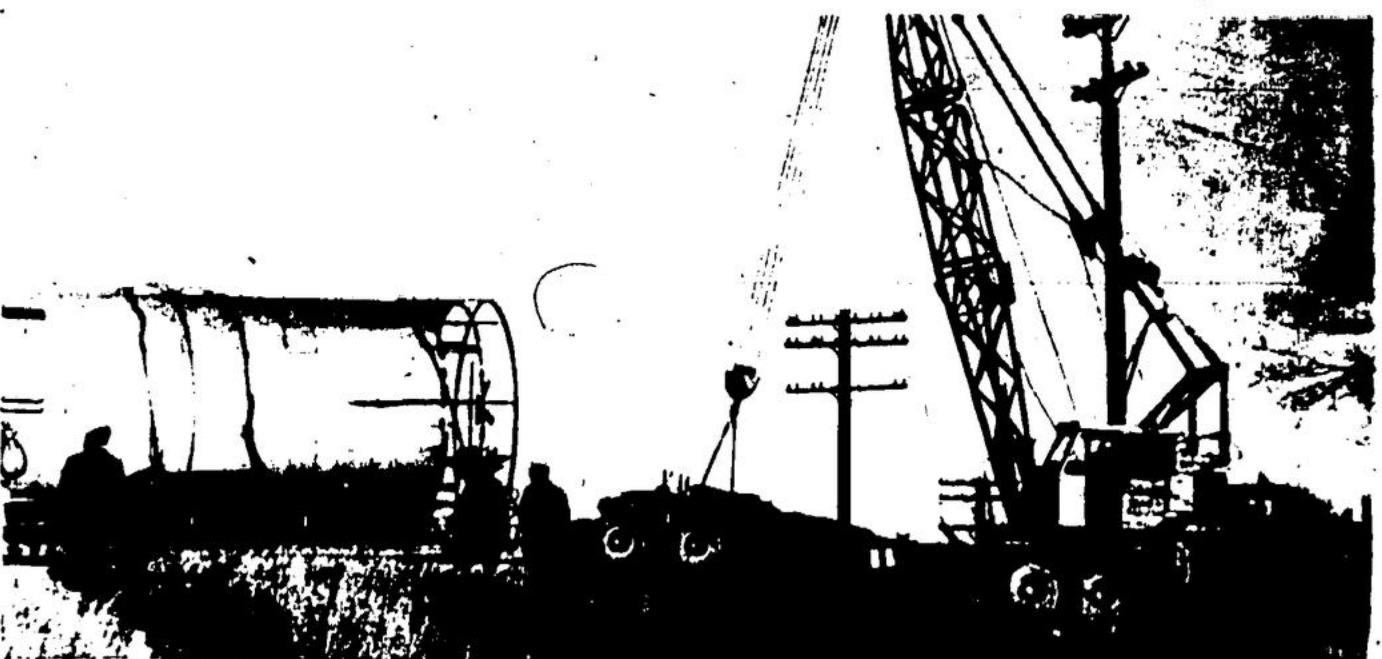
A CRANE FOLLOWING the huge tank, ready to install it at the Micro plant, was employed to lift the back end of the float and the truck backed off to clear the track, allowing the train to go on to Guelph. Not long after, a fast passenger train from the west went thundering through. The float and its entourage took a different route to the Micro plant.