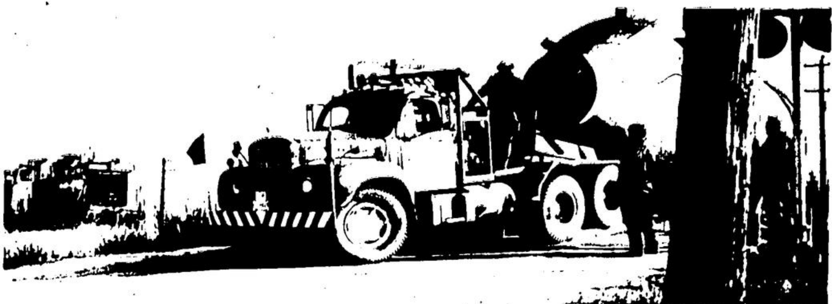
EFFORTS TO FREE the tank, bound for the Main St. N. plant of Micro Plastics, were futile. While the driver and other workmen tried to dislodge the tank, a C.N.R. freight came along. Forewarned of the obstacle the train stopped in time to avoid a collision.

One incident of insecure premises was investigated by the police this week.