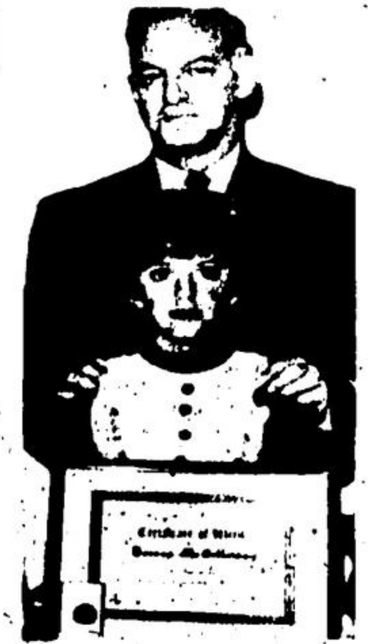
SHE'S A WINNER

Milton Fire Department's Ladies Auxiliary served the roast beef dinner to the 72 guests.