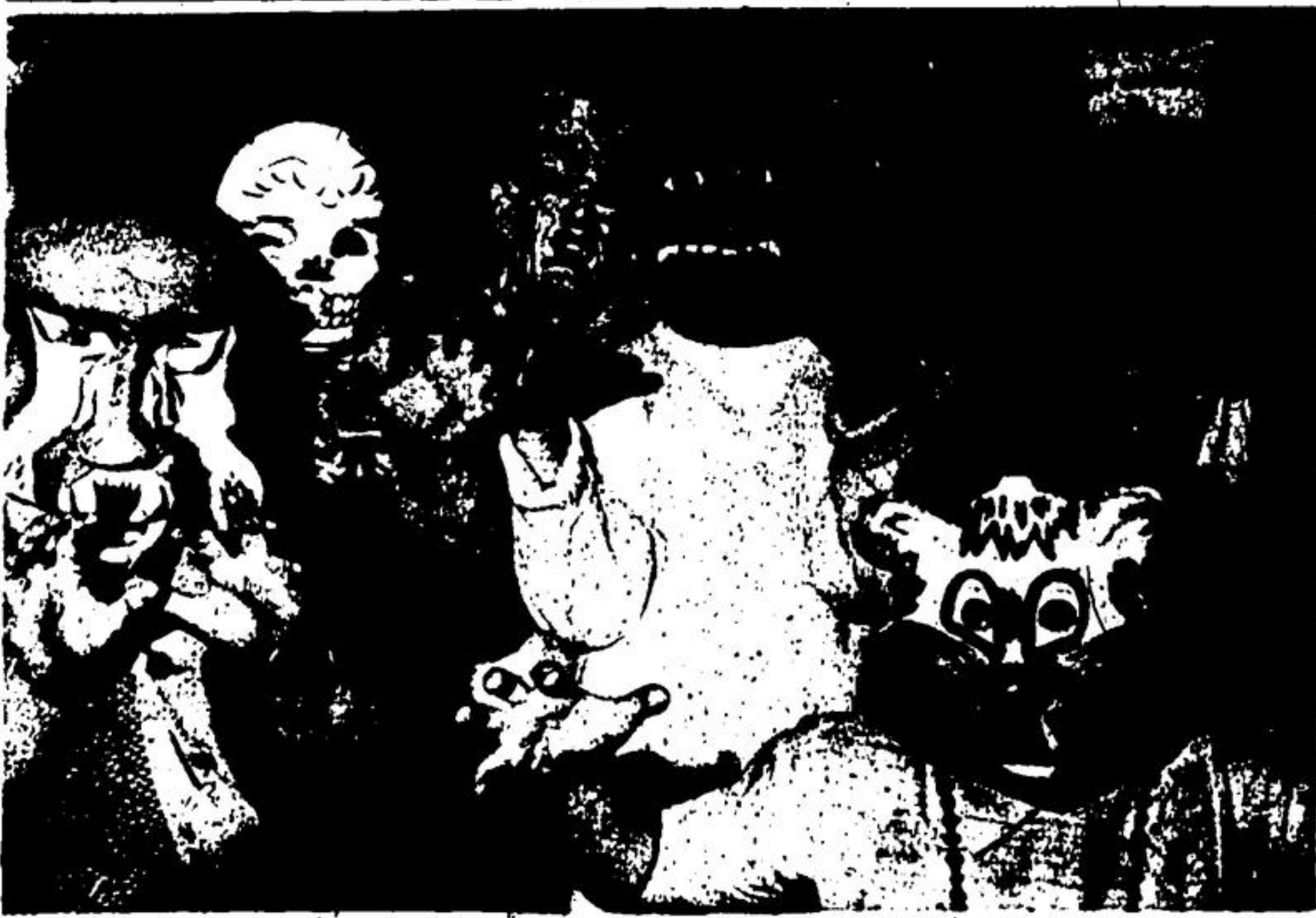
What do you mean, you're out of candles.