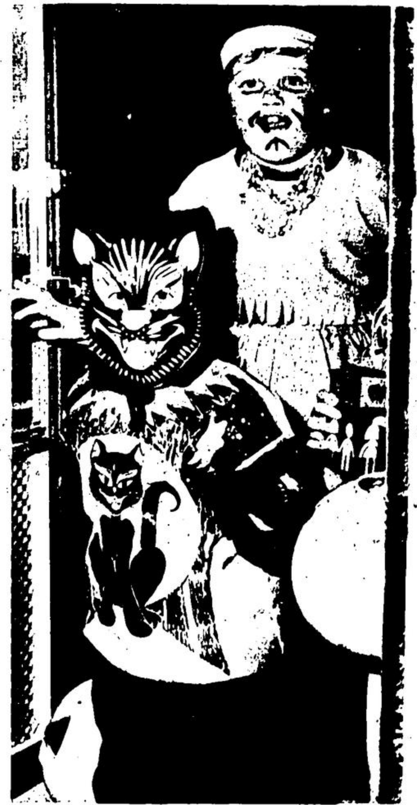
Trick or treat? Well, a treat of course.