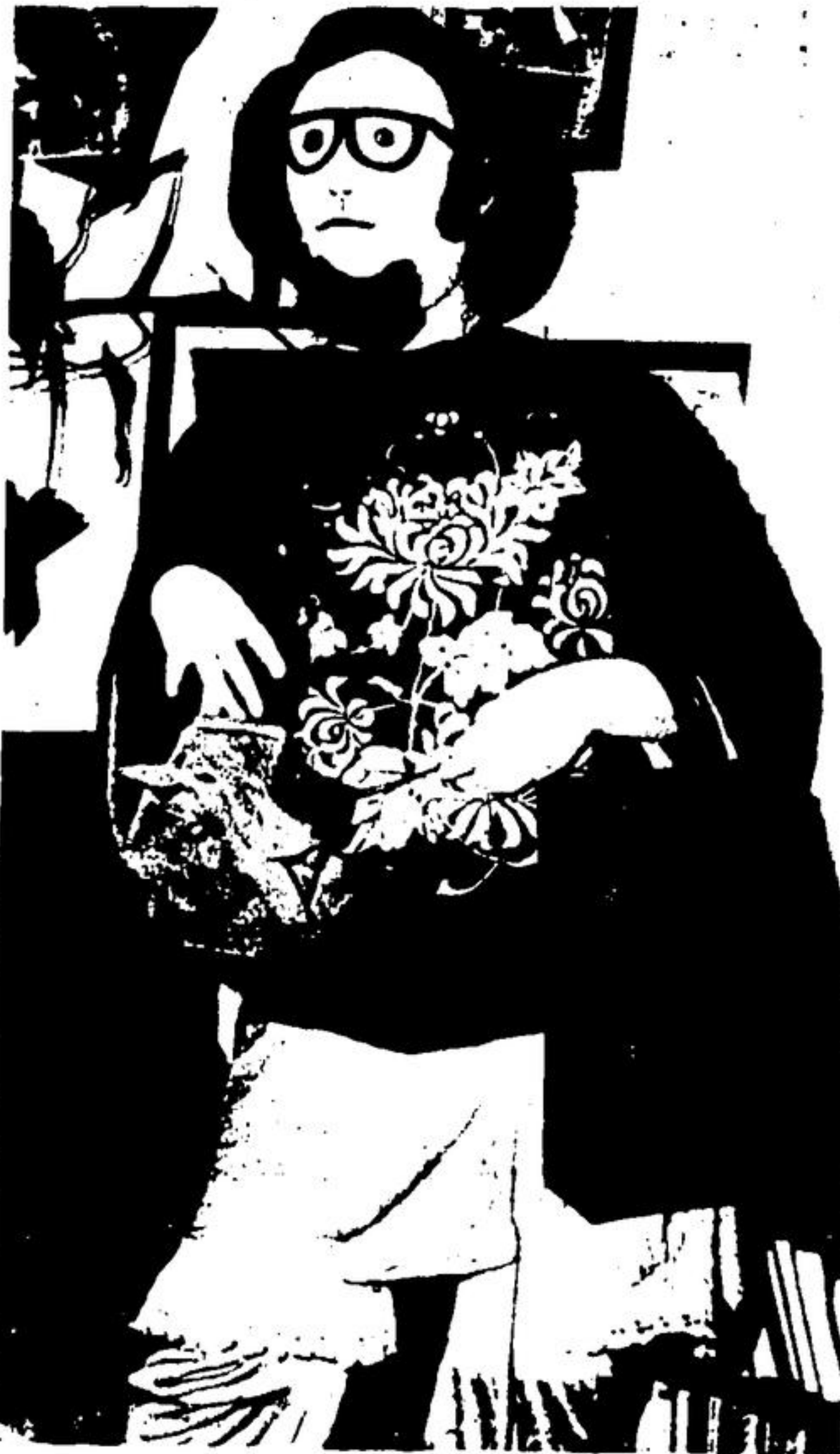
How about a Chinese coolie in lace pantaloons and a paper rose.