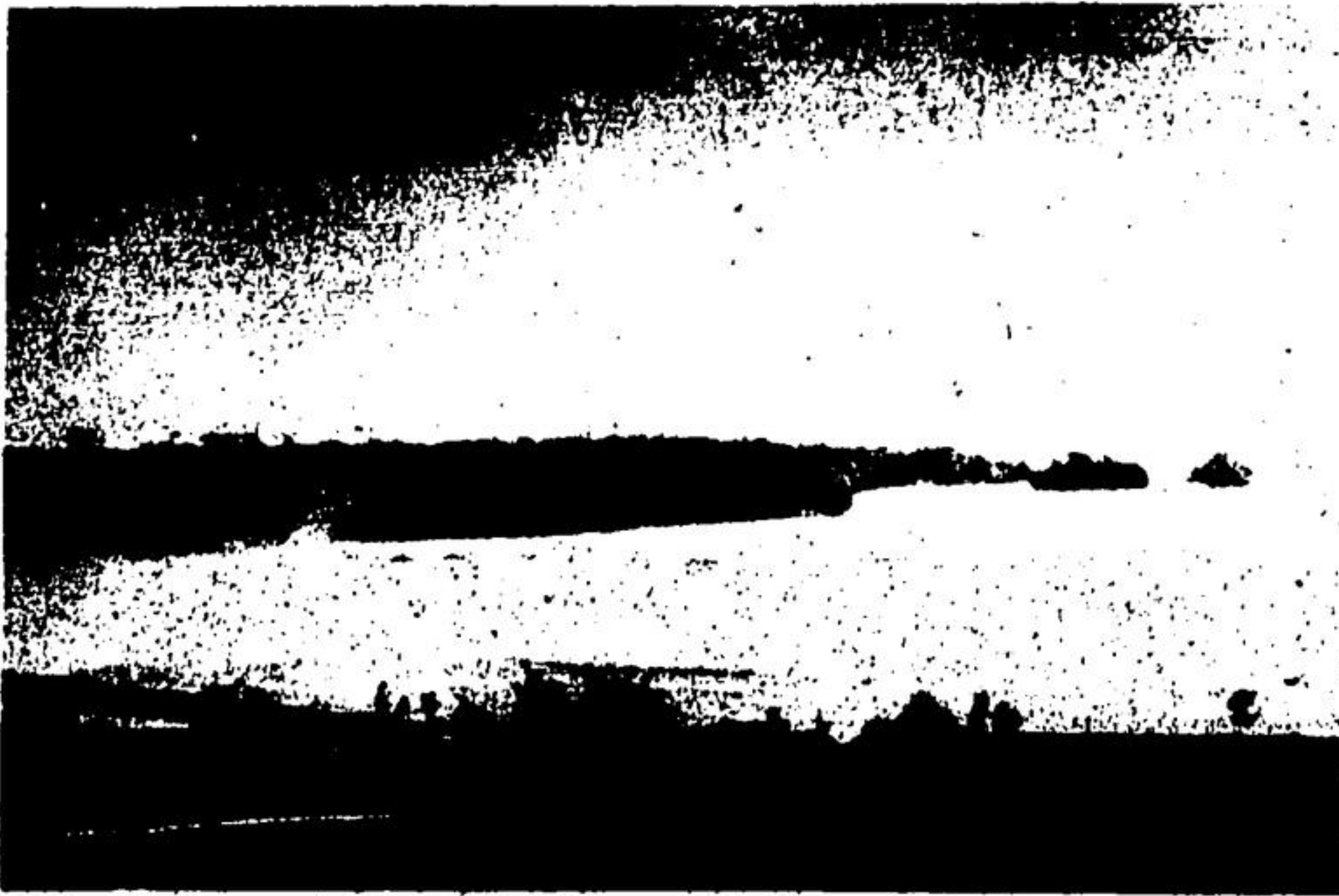
NIAGARA FALLS doesn't change — but the road Harris took this photograph years ago, showing an uncluttered shoreline.