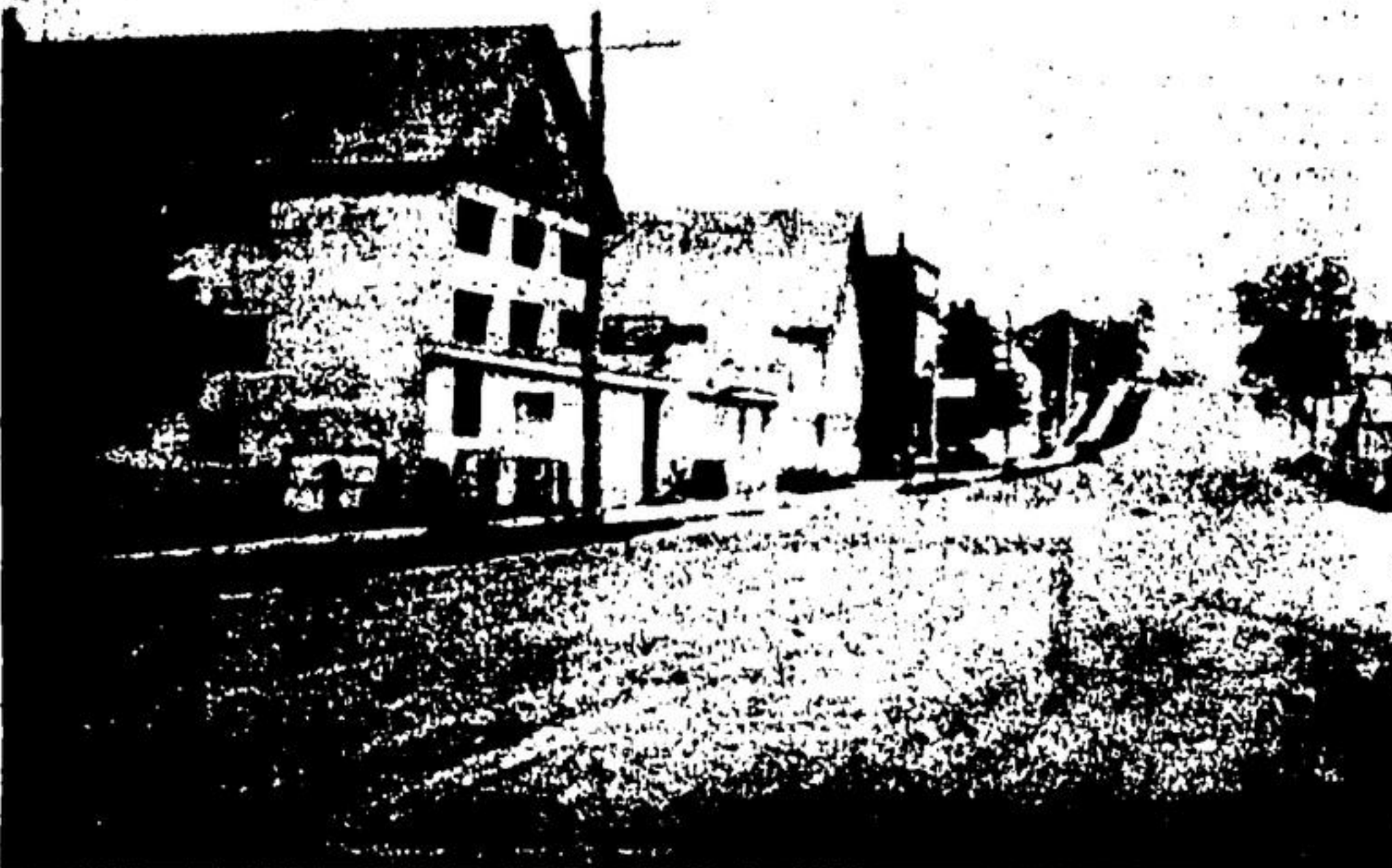
MAIN ST. IN ROCKWOOD is pictured in the days before it was paved. The building on the left was a tire shop. On the top floor was the Terrace Gardens where dances were held every Saturday night. It's now Schneider's candy factory.