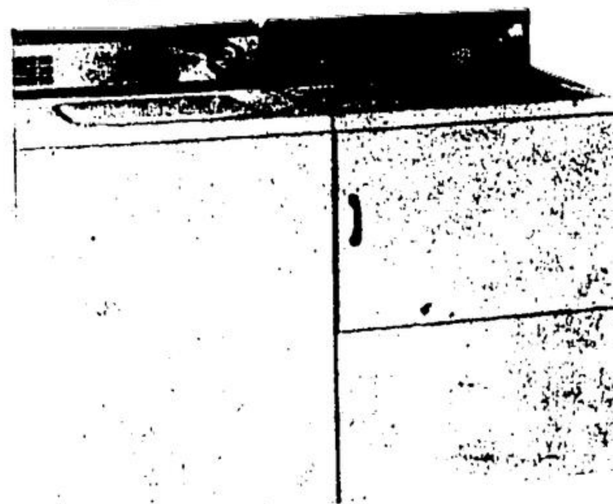
Model 72W91 Washer Model 72D91 Dryer

This General Electric Team WILL GIVE YOU MORE TIME FOR HOME ENTERTAINMENT