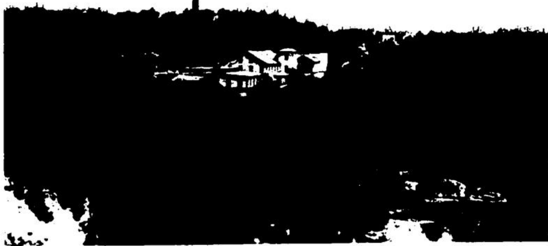
ANOTHER VIEW of the Harris Woollen Mills at Rockwood when the business was a leading manufacturer of woollens in Upper Canada. Only a gaunt shell remains of the building now.