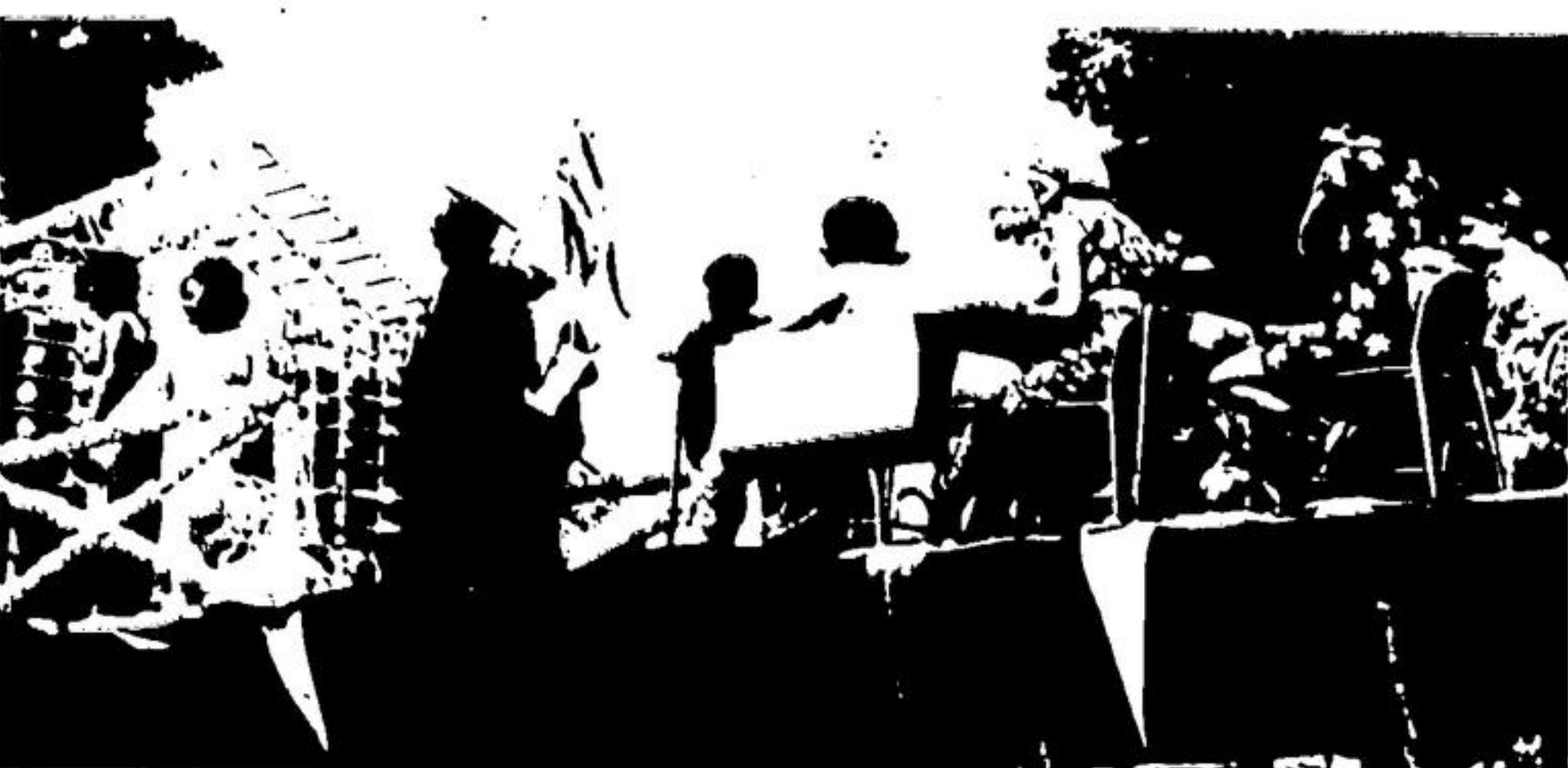
SO WHAT HAPPENED to student apathy? For the first time, Acton District High School took part in the fair parade with one of the largest most imaginative floats going