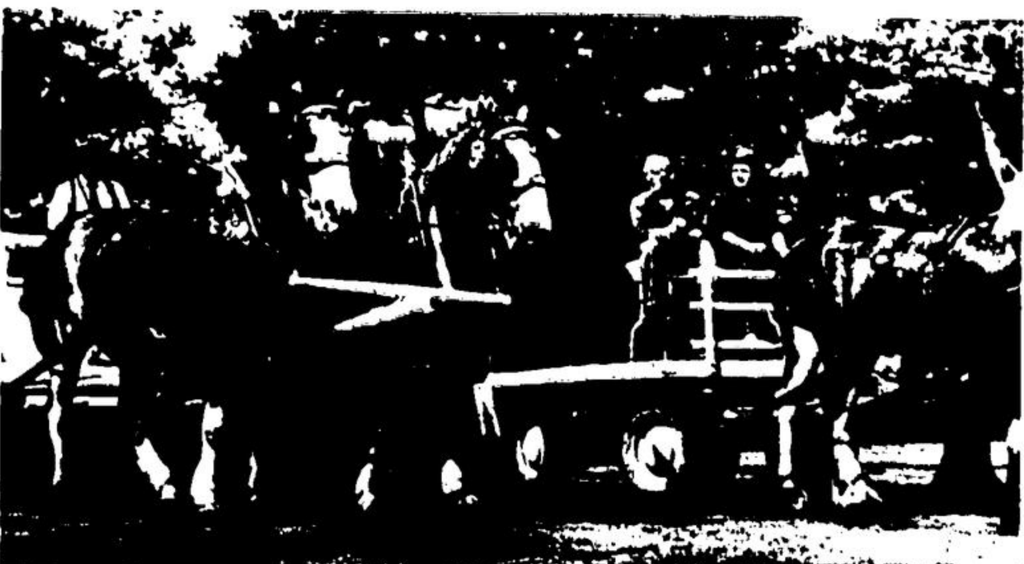
DRAUGHT HORSES owned by Houston's of Brampton (left) took top ribbons with Banner-man's of Monkton placing second. Both marched in Saturday's parade.