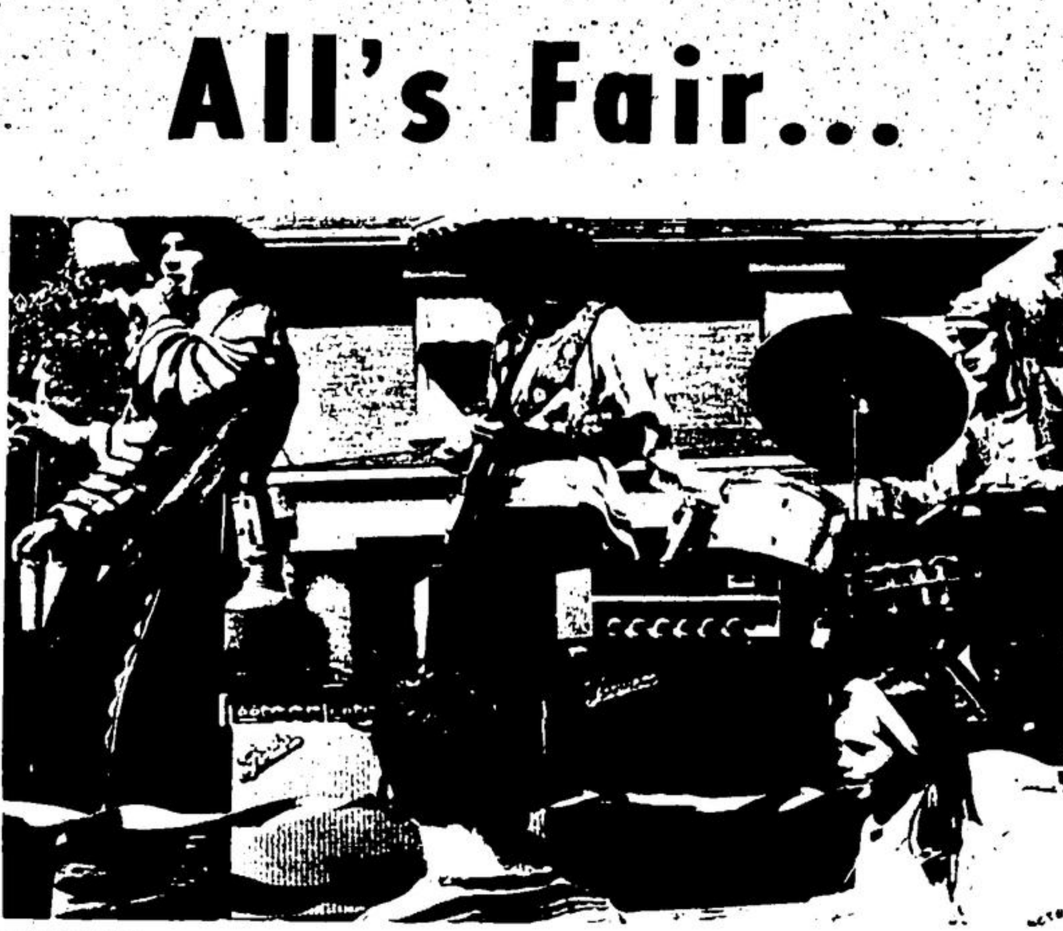
THE SHANES gave a preview performance in dance in the arena Saturday night. Saturday afternoon's parade before a swinging