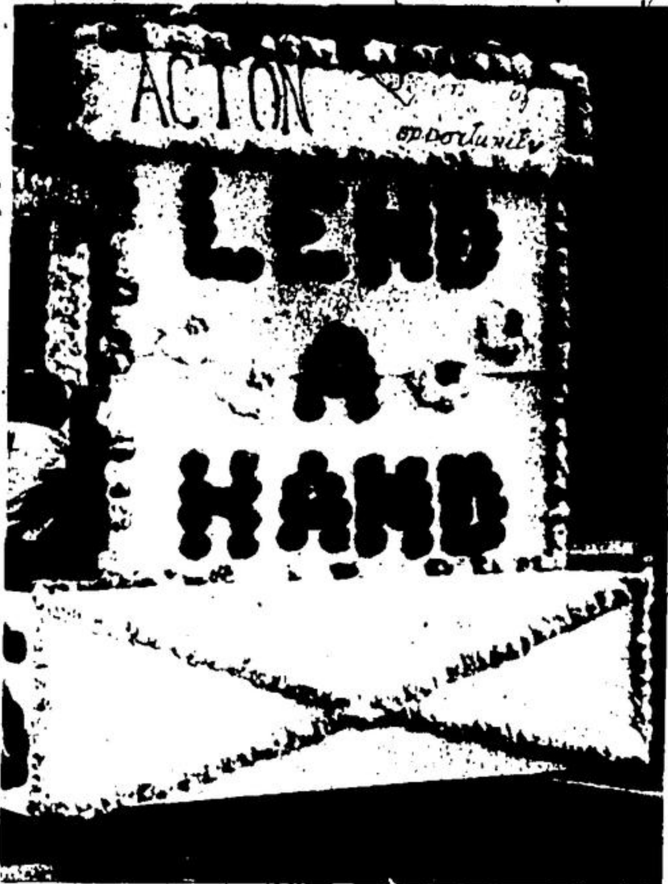
ACTON BROWNIES 'Lend a Hand' was one of the best floats in the parade, and captured the third prize award.