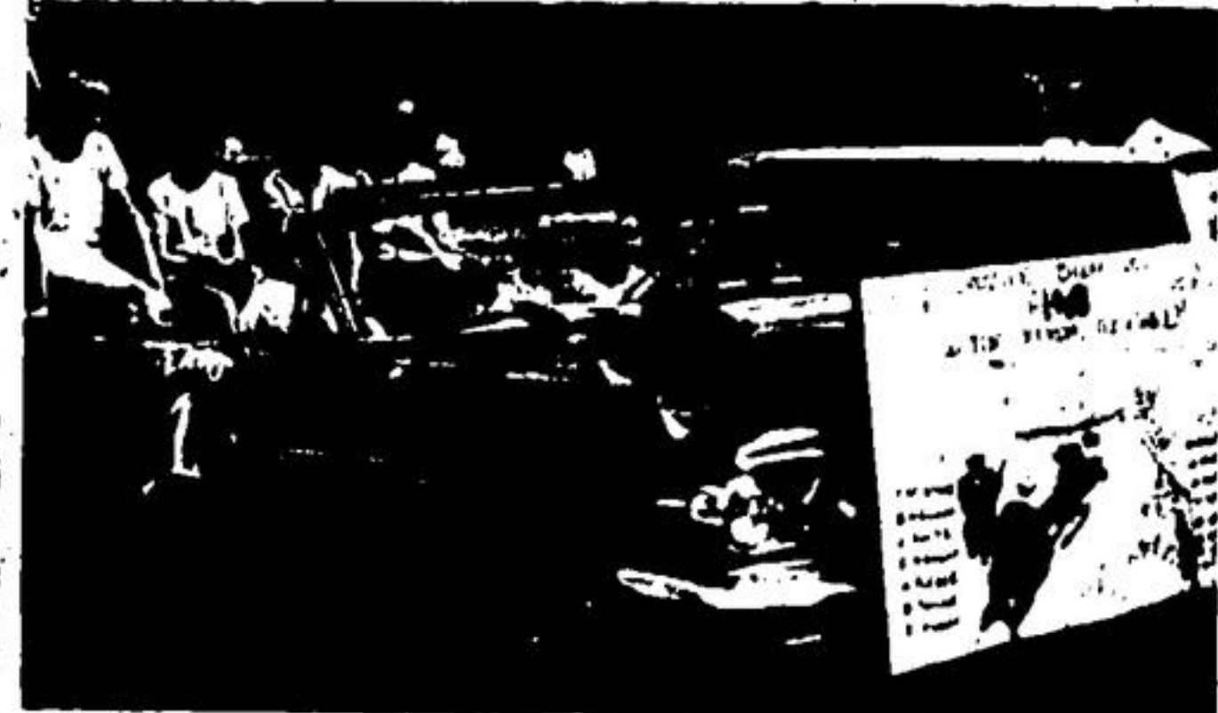
MINOR BASEBALL CHAMPIONS