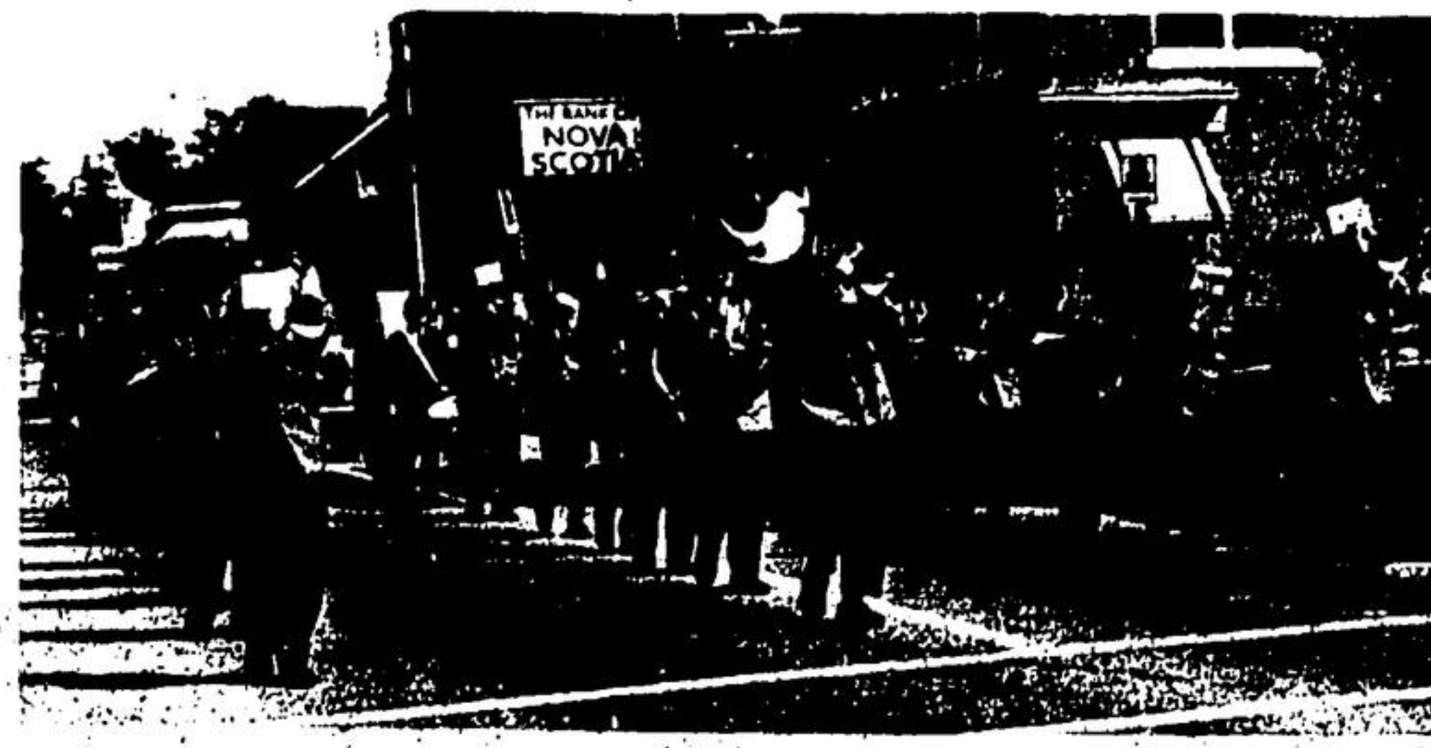
THE REDCOATS are coming as Acton dignitaries through town. Citizens' Band leads the parade of floats and