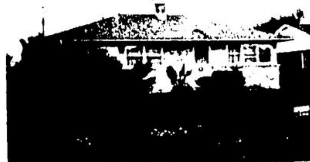
3 Bedrooms, finished recreation room... ASKING $19,500 FULL PRICE