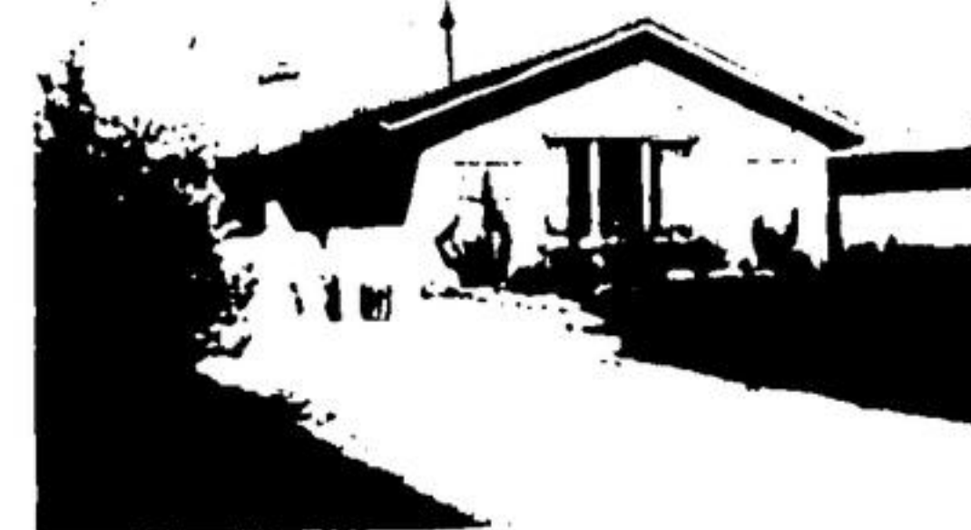
3 bedroom bungalow with finished recreation room. In good condition. ASKING $19,900 FULL PRICE With $3,500 Down