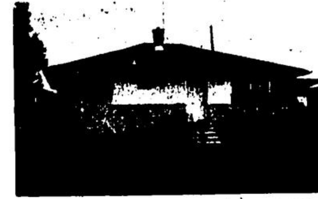
3 bedrooms, ASKING $19,000 FULL PRICE