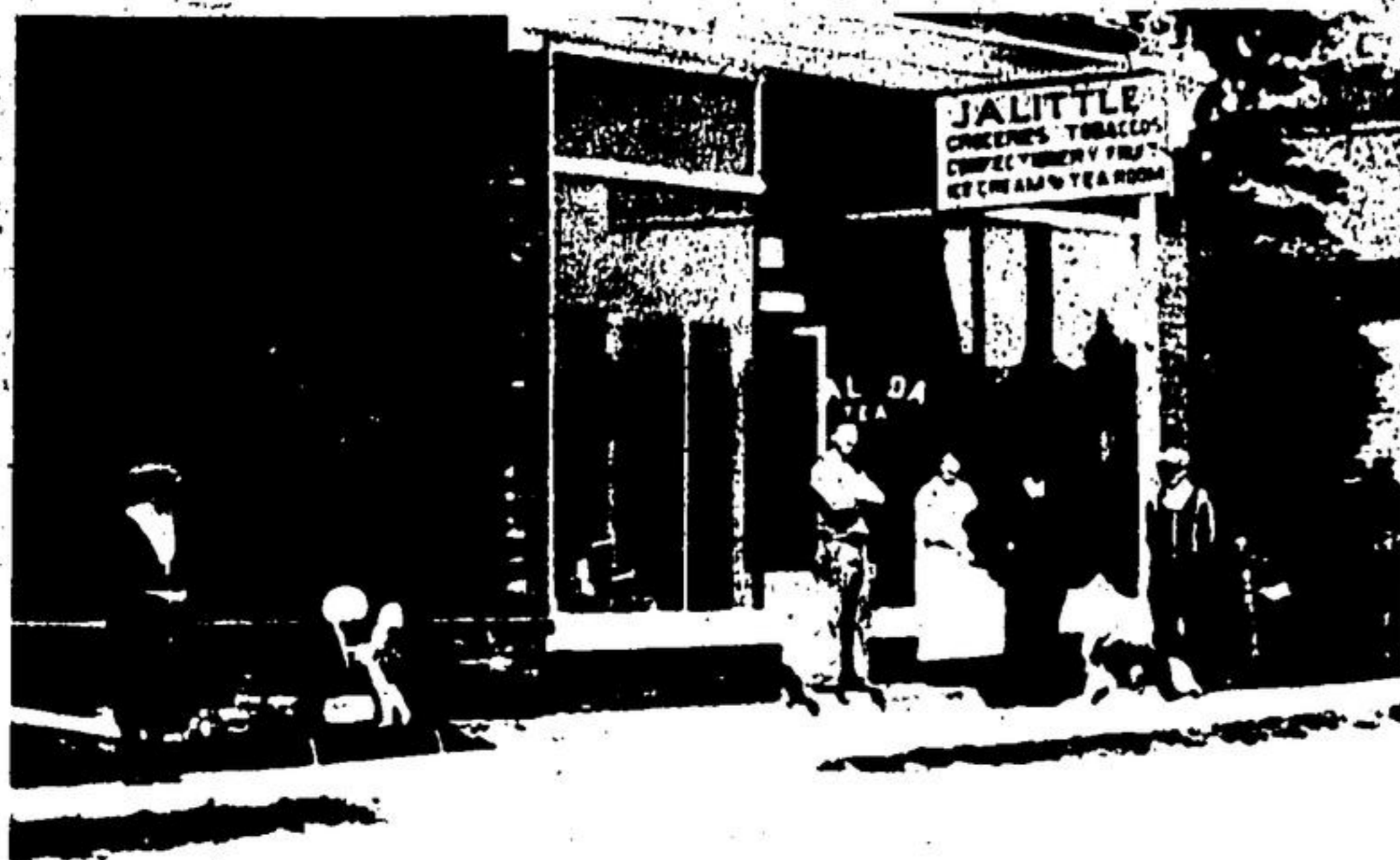
FROM TOBACCO to tea, Little store had them all. This photograph of the store on Rockwood's main street was taken in the 1920's.