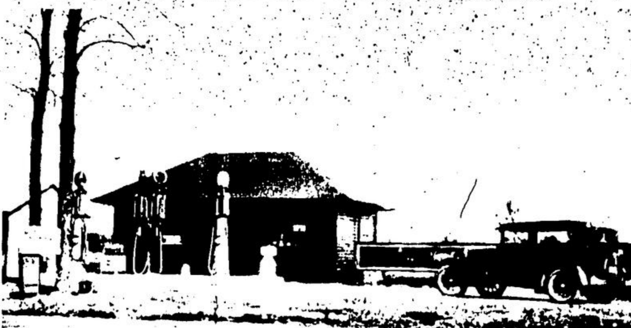
A STURDY OLD CAR — painted black, no doubt — is parked at Los Ayles' service station west of Rockwood on No. 7 highway.