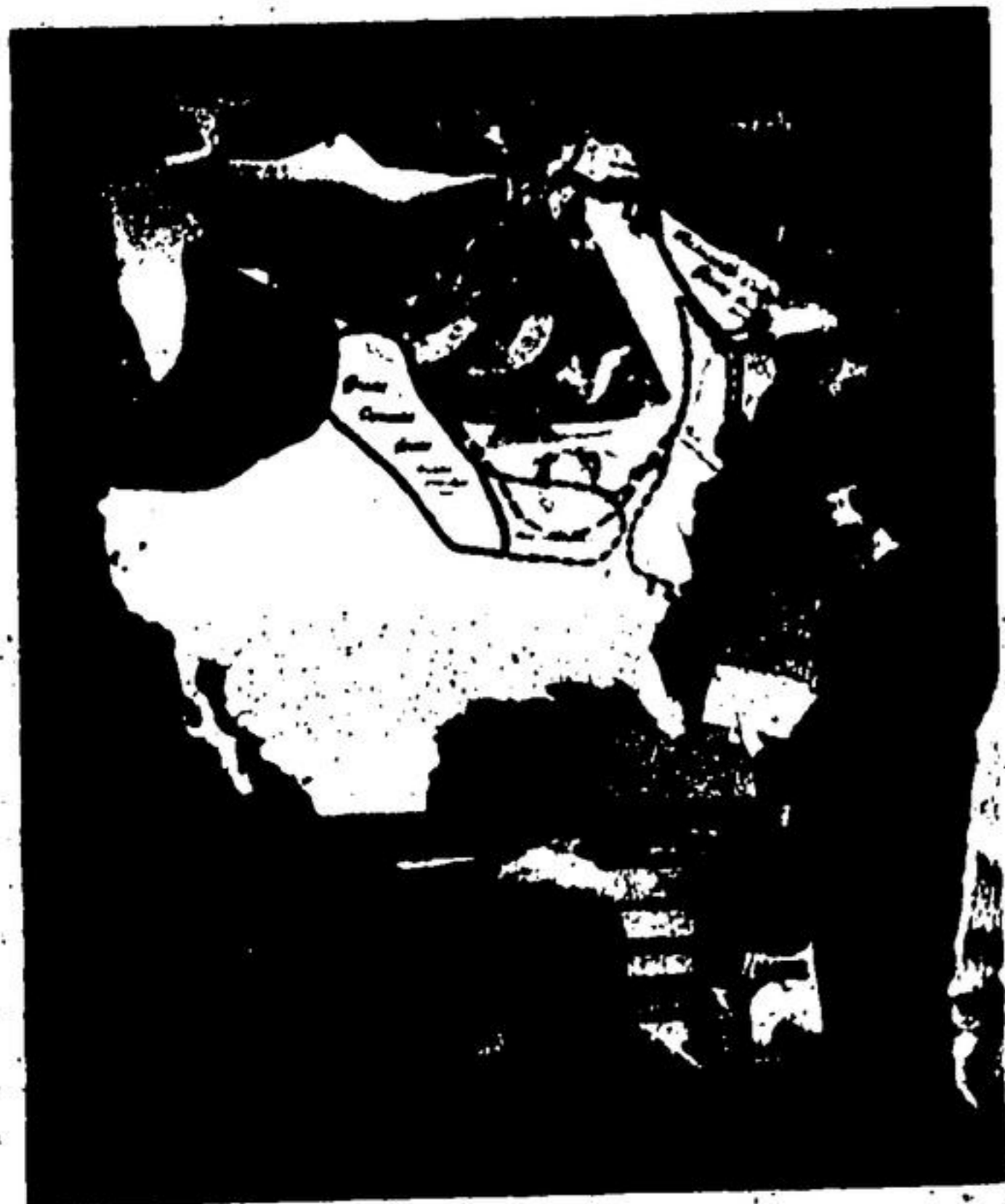
RANGE OF THE CANADA GOOSE is traced on a large map for the benefit of visitors to the park.