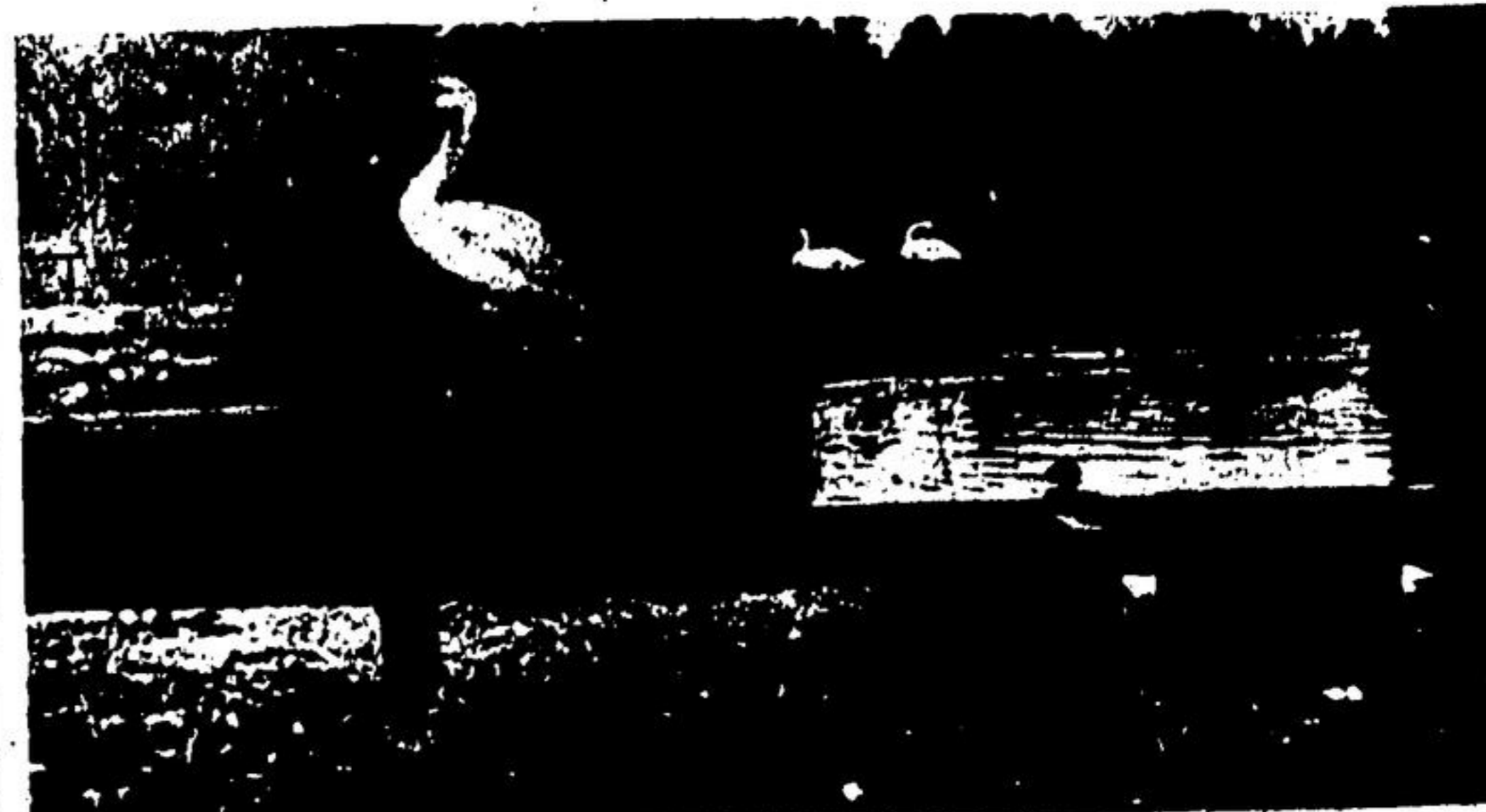
A PAIR OF TRUMPETER SWANS preen themselves on the left bank while lesser, known but more common birds mind their own business.