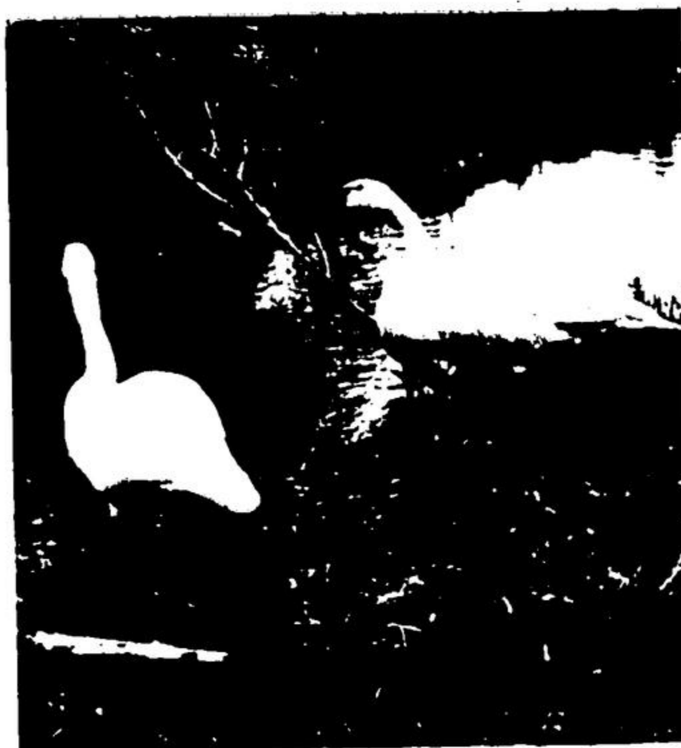
WHISTLING SWANS prepare for a bath in one of the spring creeks which trace watercourses through the park.