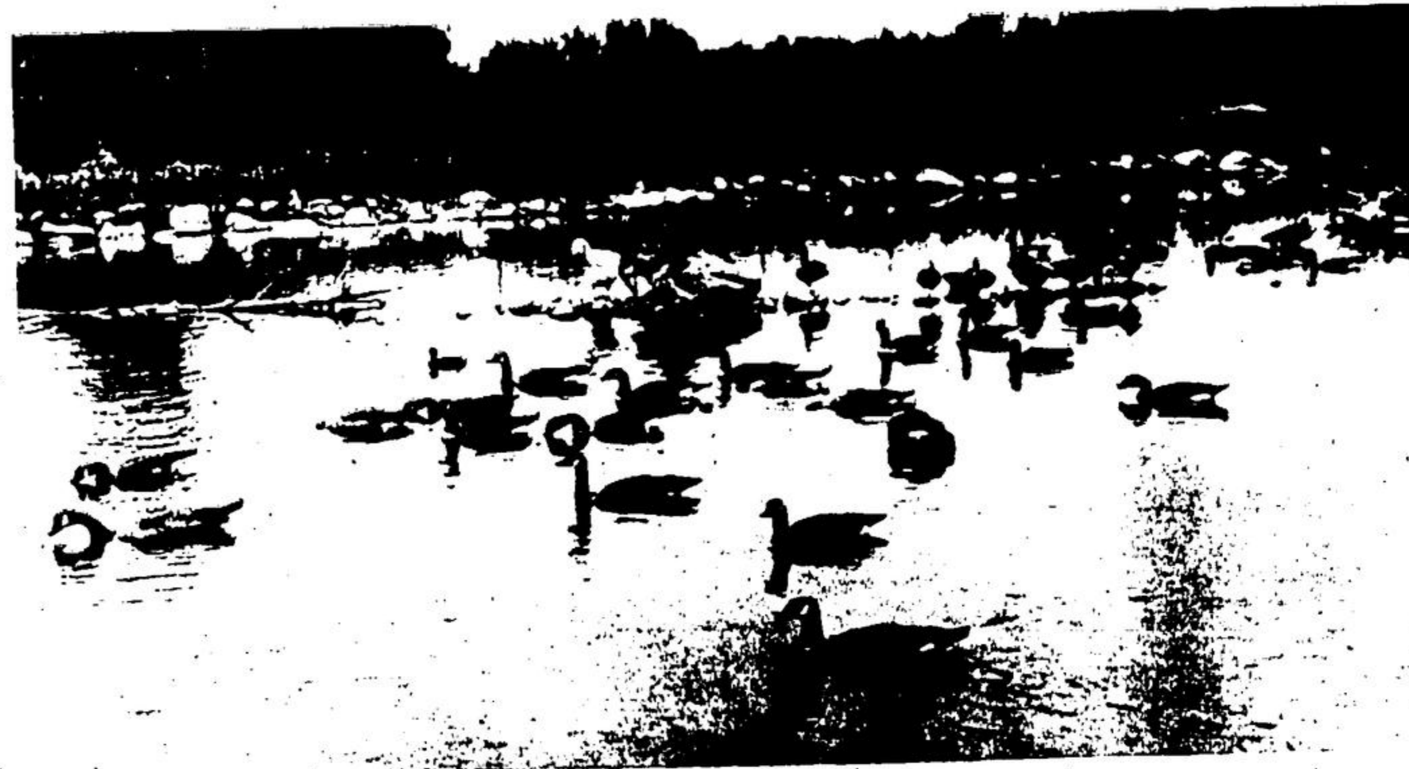
HUNTERS WILL LOOK at this flock of Canada geese at Kortright Waterfowl Park with itchy trigger fingers, but they can relax. The majestic birds are in a sanctuary which extends along both sides of the large park as well.