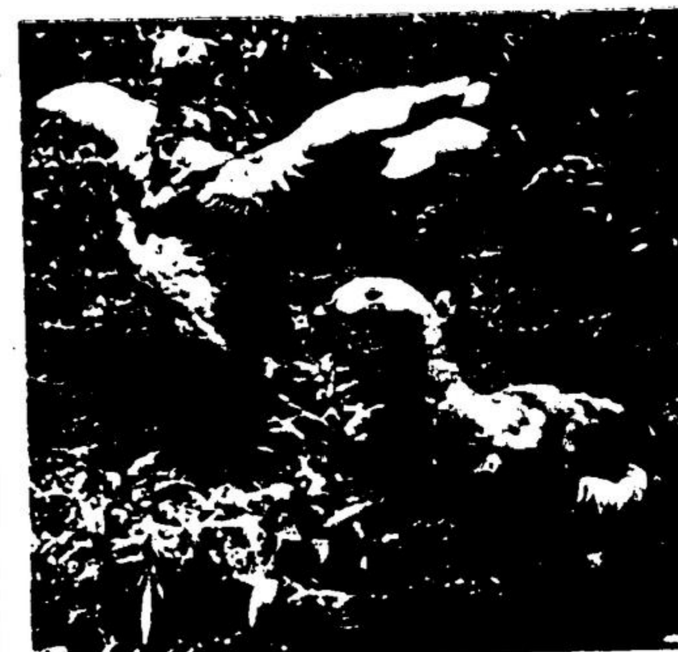
ALMOST HIDDEN in their natural habitat, this pair of geese don't take kindly to posing for The Free Press camera. The gander challenges.