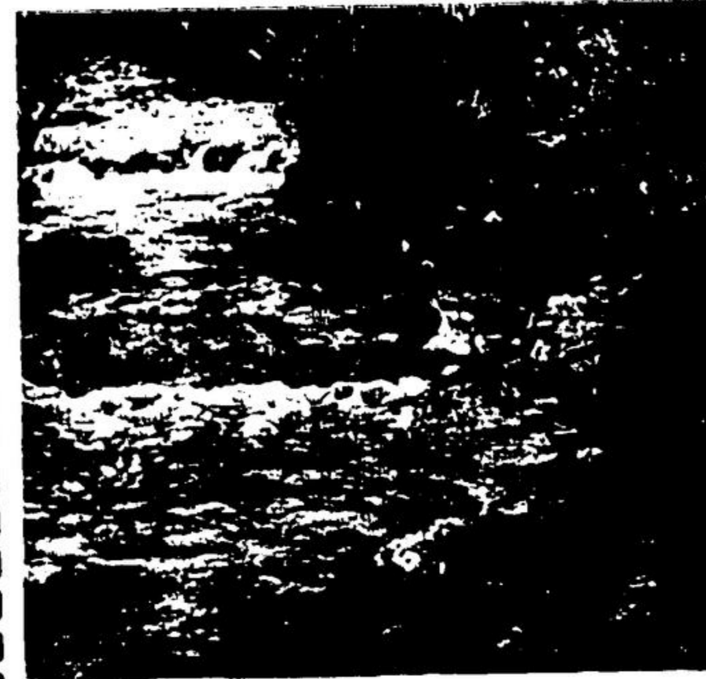
NOTHING LIKE a cold bath to disturb parasites.