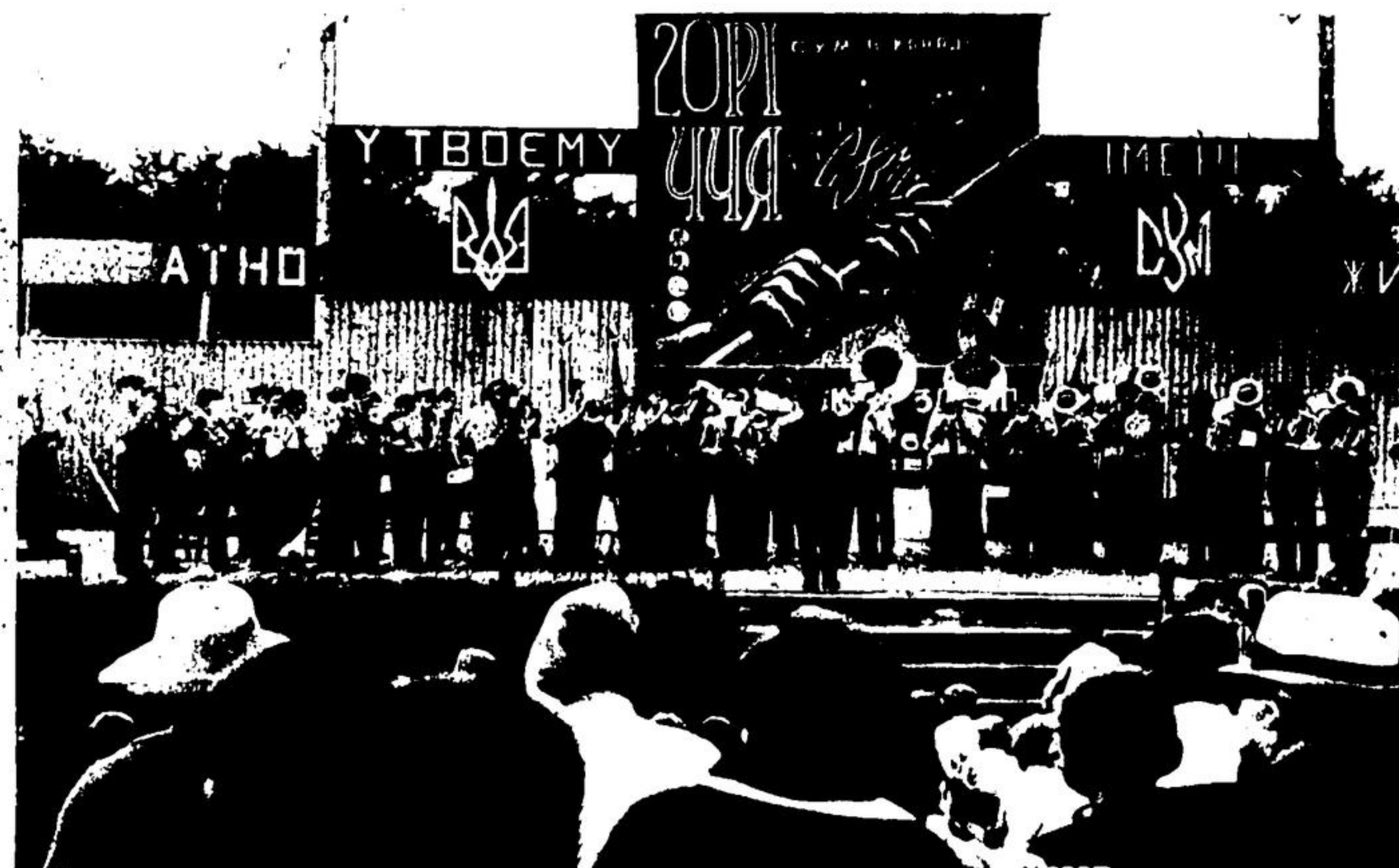
MUSIC OF THE UKRAINE delighted the audience of Ukrainian descent at Camp Weselka's closing program. It's hoped this brass band will play again at Acton fall fair this September. Camp Weselka on the fourth line had close to 600 boys and girls from all over southern Ontario attending two three-

pressed the hope "the Acton children in the summer recreation program and the boys and girls at camp might join for games and competitions next year.