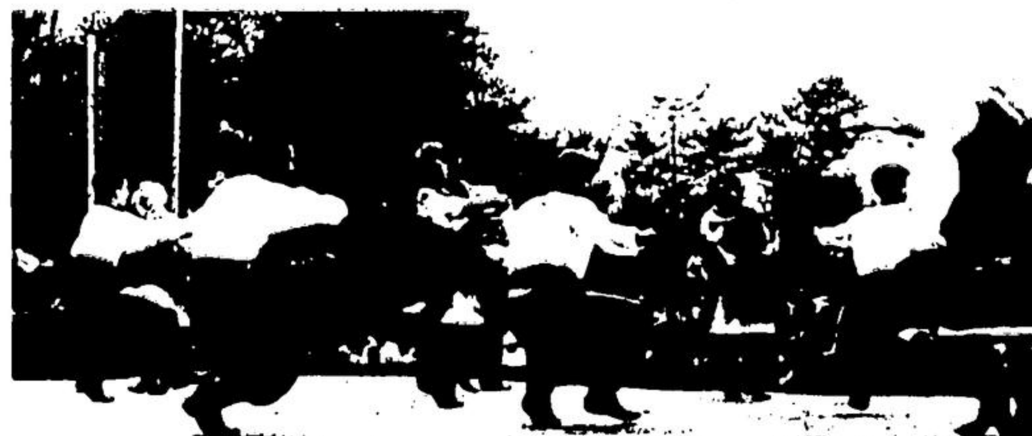
ENTHUSIASM of the Ukrainian dancers spread to the appreciative audience at the camp east of town on the fourth line. Families were

the program before a massed number including the brass band, men's and women's choirs.