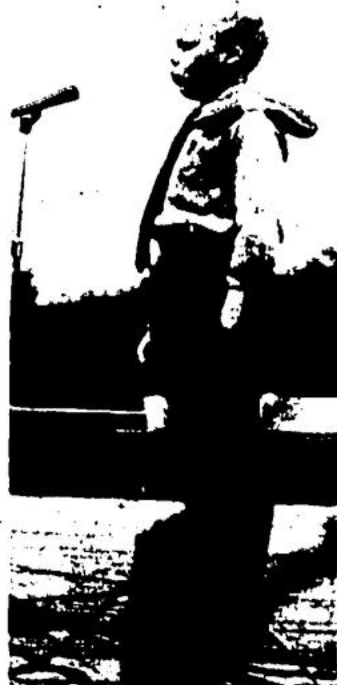
DRAMATIC recitation in Ukrainian by earnest young camper brought long applause.