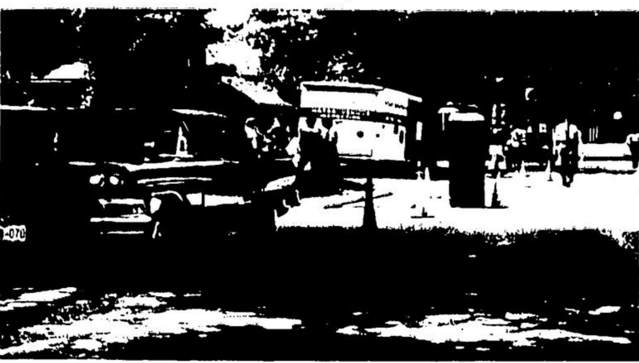
SAFETY CHECKS of motor vehicles are being conducted this week on Fellows St. by a team from the Motor Vehicles Inspection Branch of the Ontario Department of Transport. Vehicles which pass the rigid tests are entitled to receive a safety sticker.