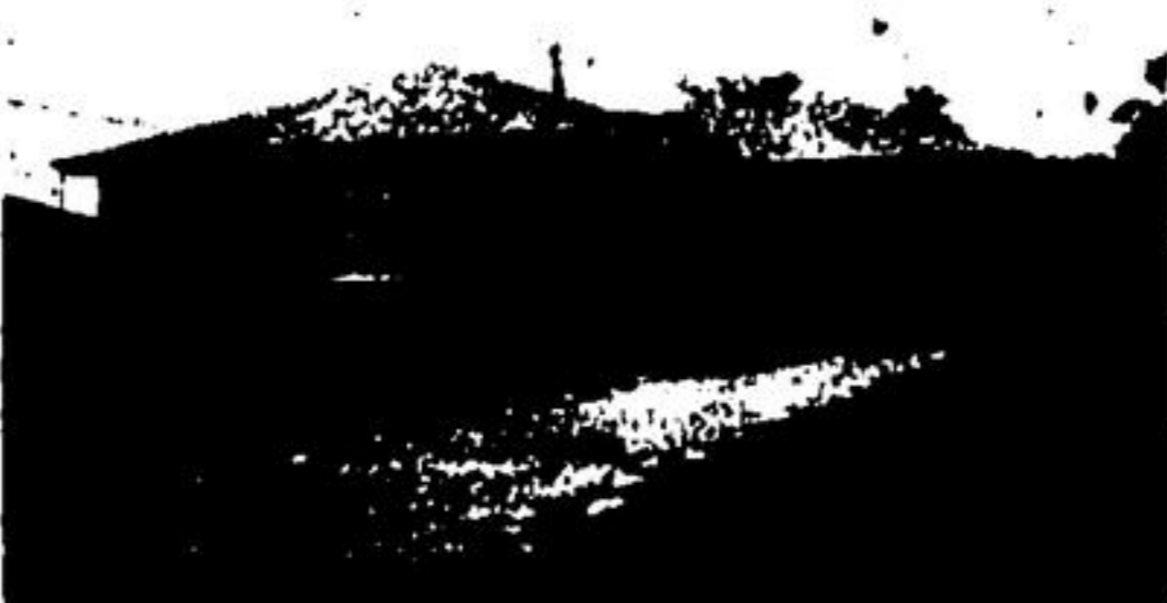
3 bedrooms, carport, 2 years old. ASKING $21,500 FULL PRICE — OPEN TO OFFER