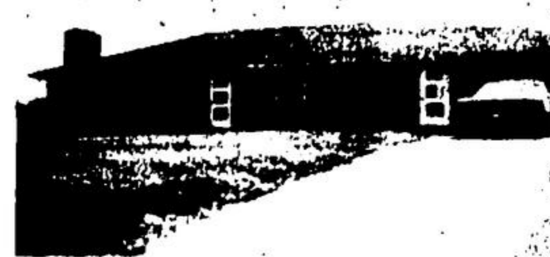
3 Bedrooms, attached garage, 1/2-Acre, lovely view. ASKING $24,500 FULL PRICE — MAKE OFFER