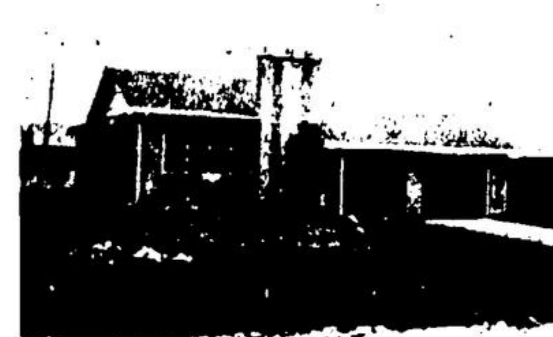
3 bedrooms, attached garage, fireplace, recreation room, 7% mortgage, ASKING $24,000 FULL PRICE. Owner may hold second mortgage. Immediate possession. One year old.