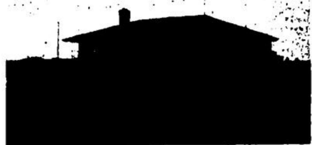
On 1/2-Acre, 2 Bedrooms and 4 room basement apartment, garage and carport and workshop. ASKING $29,900. OPEN TO OFFER