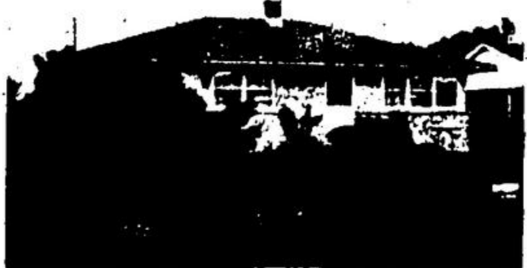
3 Bedrooms, finished recreation room. ASKING $19,500 FULL PRICE