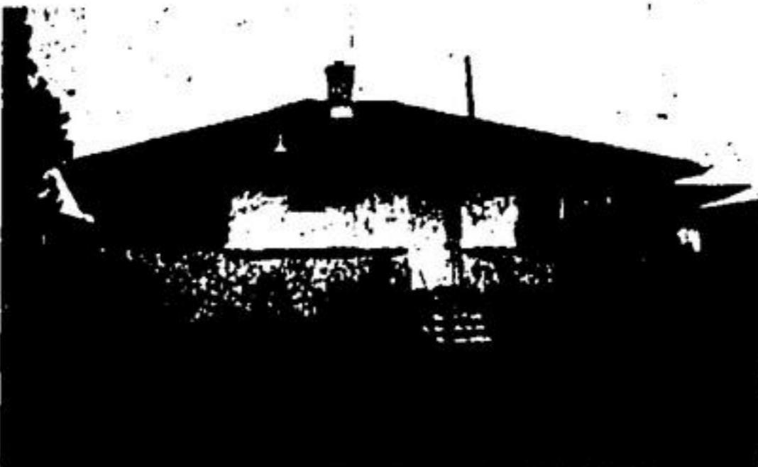
3 bedrooms, ASKING $19,000 FULL PRICE