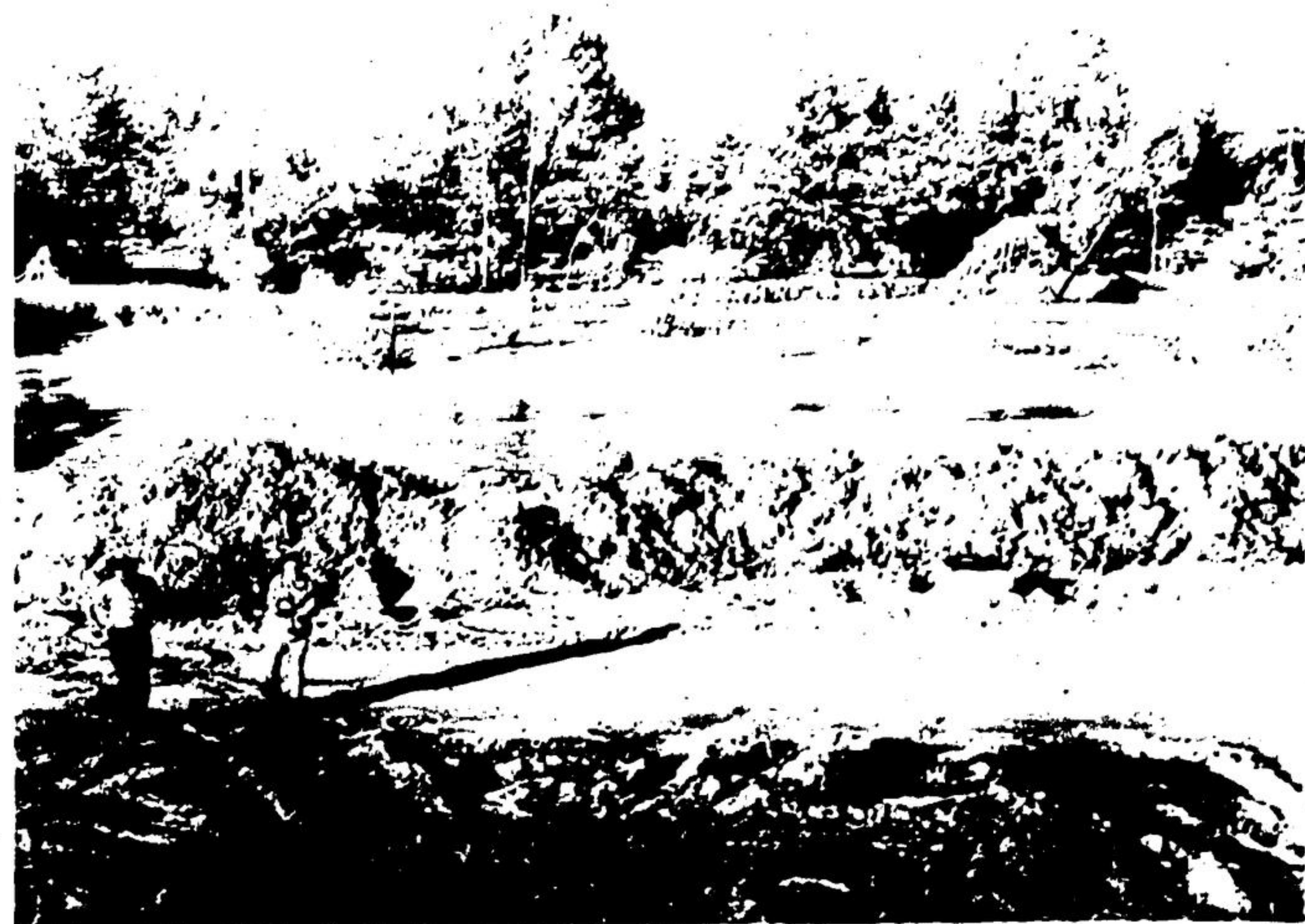
NO, IT ISN'T the hanging gardens of Babylon. It's a new bed for Elmore Drive. The dredge is working across from the community centre on the north arm of the lake.

Chief Bell operator Miss (Continued on page 2)