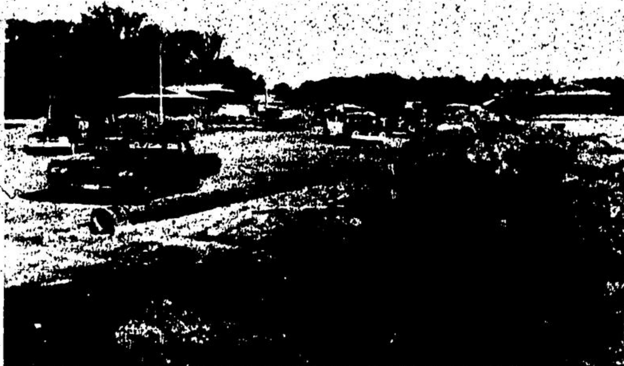
RESIDENTS OF LAKEVIEW subdivision are expected to a variety of construction this year, latest of which is erection of homes along the uncompleted section of Elmore Drive. Houses are being erected almost "overnight" at one end of the street, while dredging continues on the end nearest Fairy Lake.