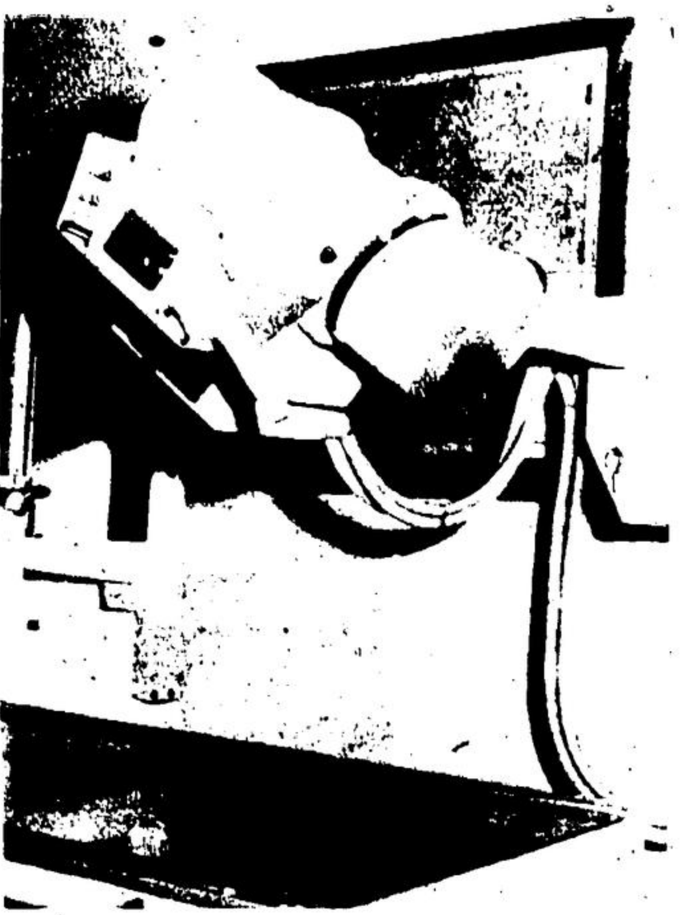
NEW X-RAY EQUIPMENT in the Acton Medical Centre eliminates the trip to Guelph hospital for services.

Acton radiology patients no longer have to travel outside of town for treatment. The Medical Building has recently installed a full radiology department in its upper floor.