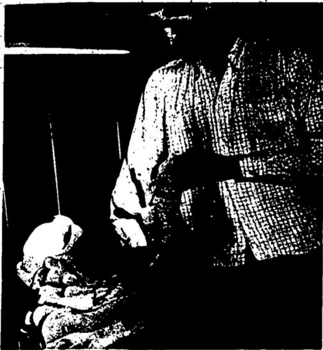
THE OLD KNITTING-NEEDLE approach applied to industry, is used to poke out the fingers in the gloves. There are pokers of different thicknesses for the fingers and the thumb.