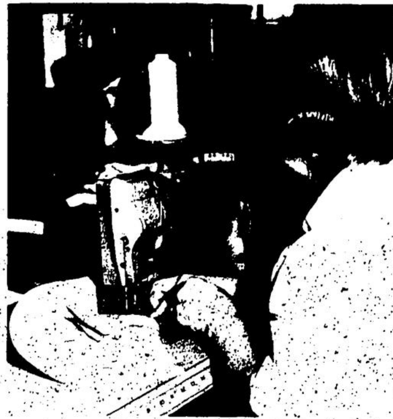
SUPERIOR GLOVES are sewn on heavy-duty machines with thick needles and heavy thread. Some are all leather and others have cloth backs and leather palms.

Superior Glove promises to be at the hands of industry for years to come, with a progressive and expanding enterprise.