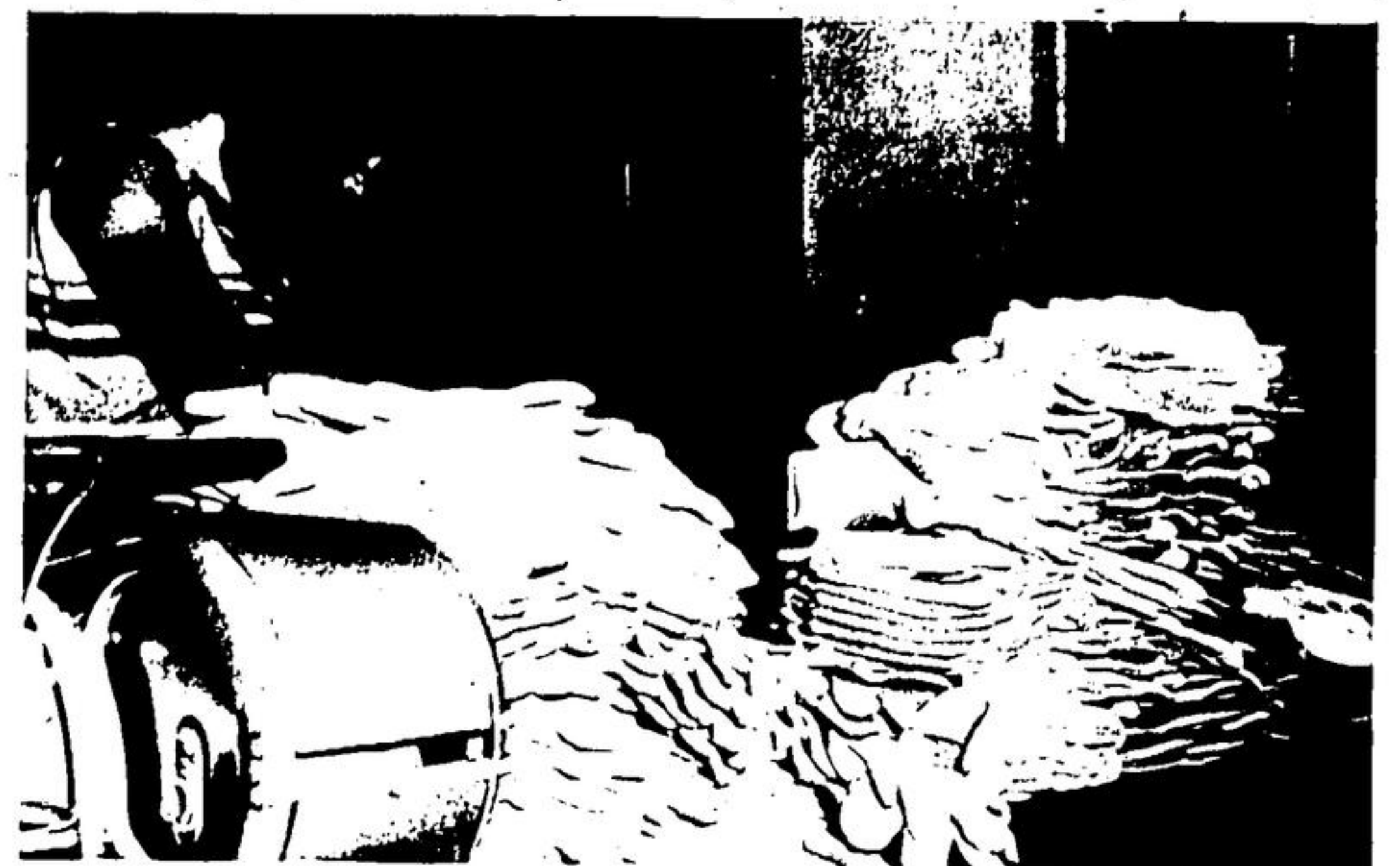
PILES OF FINISHED leather-palm gloves wait to be packed and counted by Mrs. Paupst. Superior Glove produces about 50,000 gloves a year.