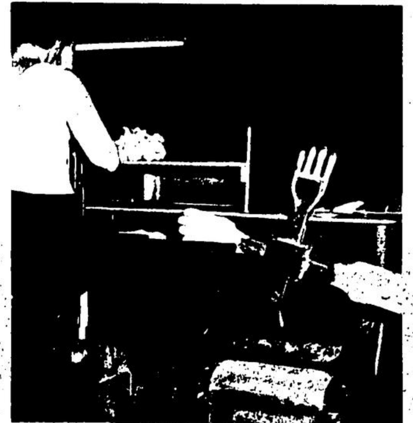
METAL HANDS work for Superior Glove. The gloves are sewn on the wrong side, then the machine flips them right-side out, presses them and flips them out on a conveyor belt to be checked and packed.