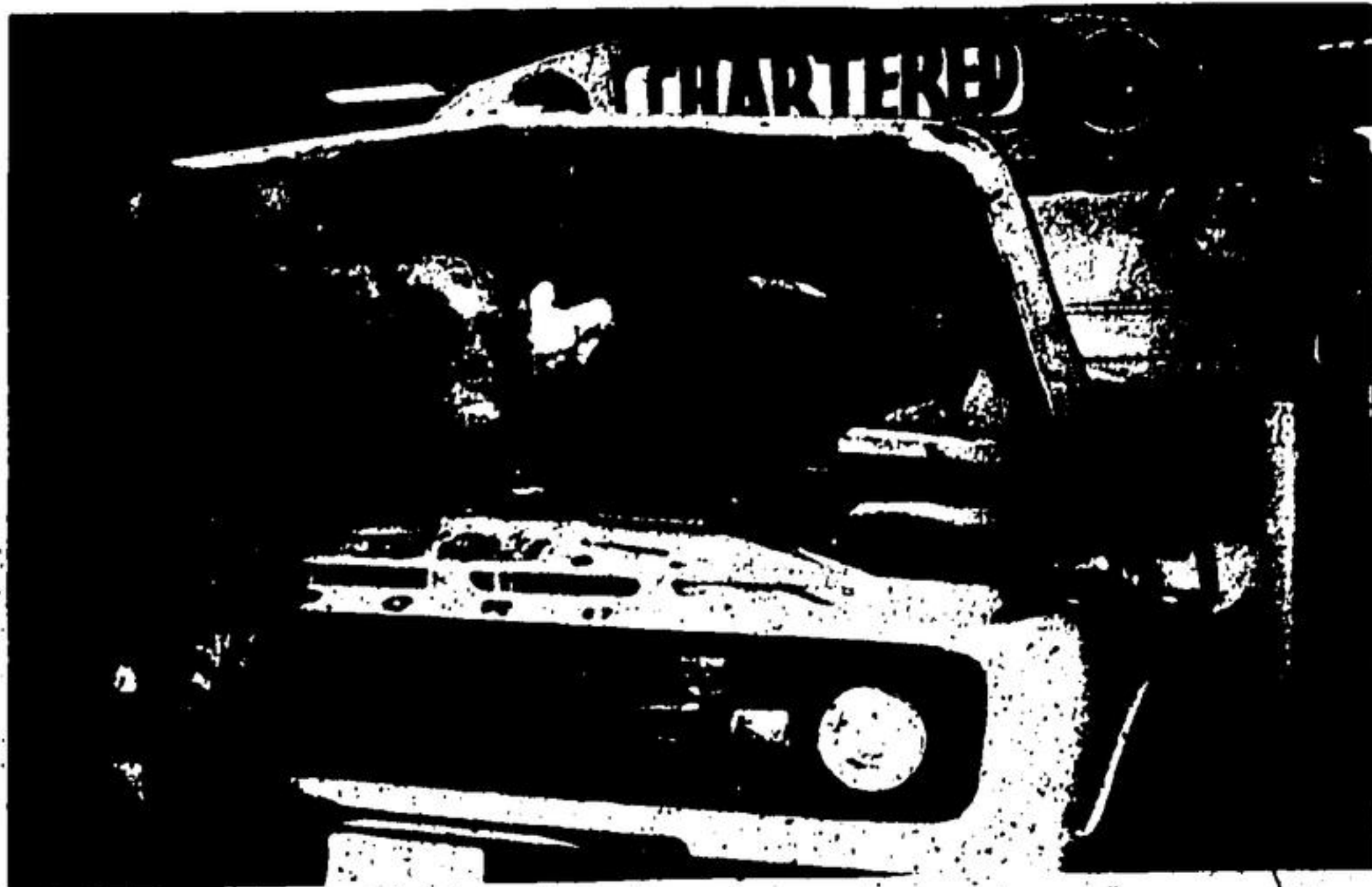
LEE WATT MAKES USE of the summer slack period to overhaul Tyler buses for the following school term. June and September are the prime times for bus runs, carrying students on field trips and educational tours. They also have a charter service for other local groups.