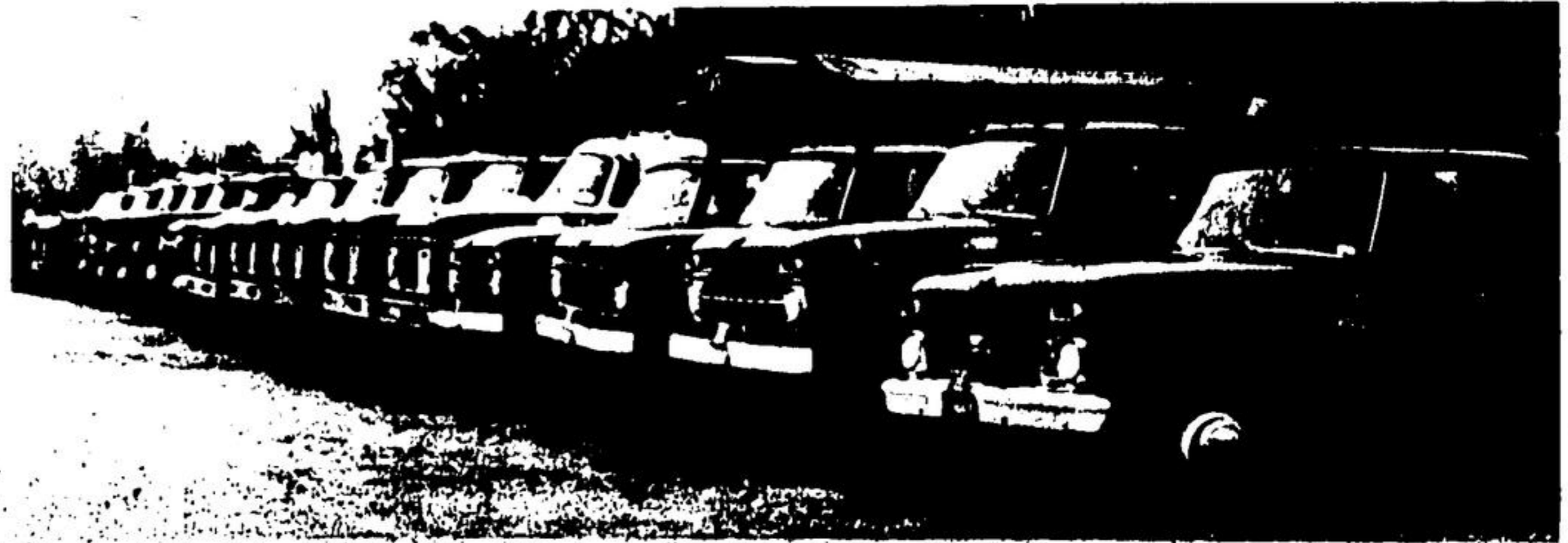
IN THE LINE-UP for Jack Ridley Cartage Limited are some of the 21 heavy duty trucks that haul mainly aggregate material within a 50-mile radius of the truck yard on Highway 25.