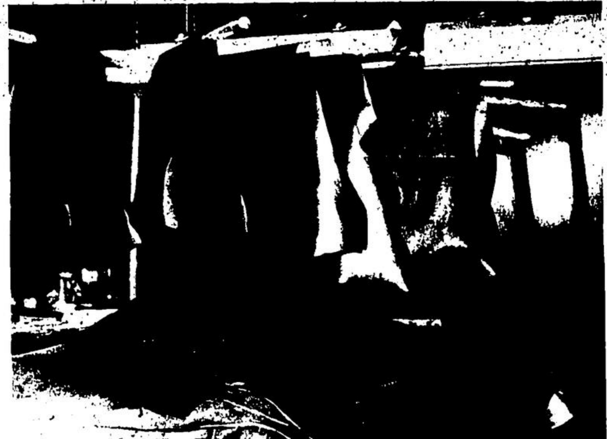
DYED LEATHER hangs on circular racks to dry every color for all types of leather goods.