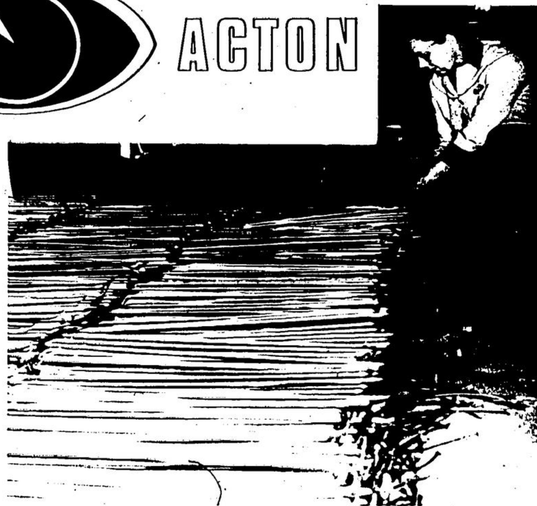
PRODUCTION OF HIGH QUALITY refrigerator defroster units of a unique design in Canada, is the latest addition to variety of products at United Carr. Matilda Barber is one of four working in the department at the present time. The plant hopes to expand it to 20.

A wide range of items are stocked by Acton merchants and the main business section is located on Mill Street, with stores at other points to serve the town's growing subdivisions.