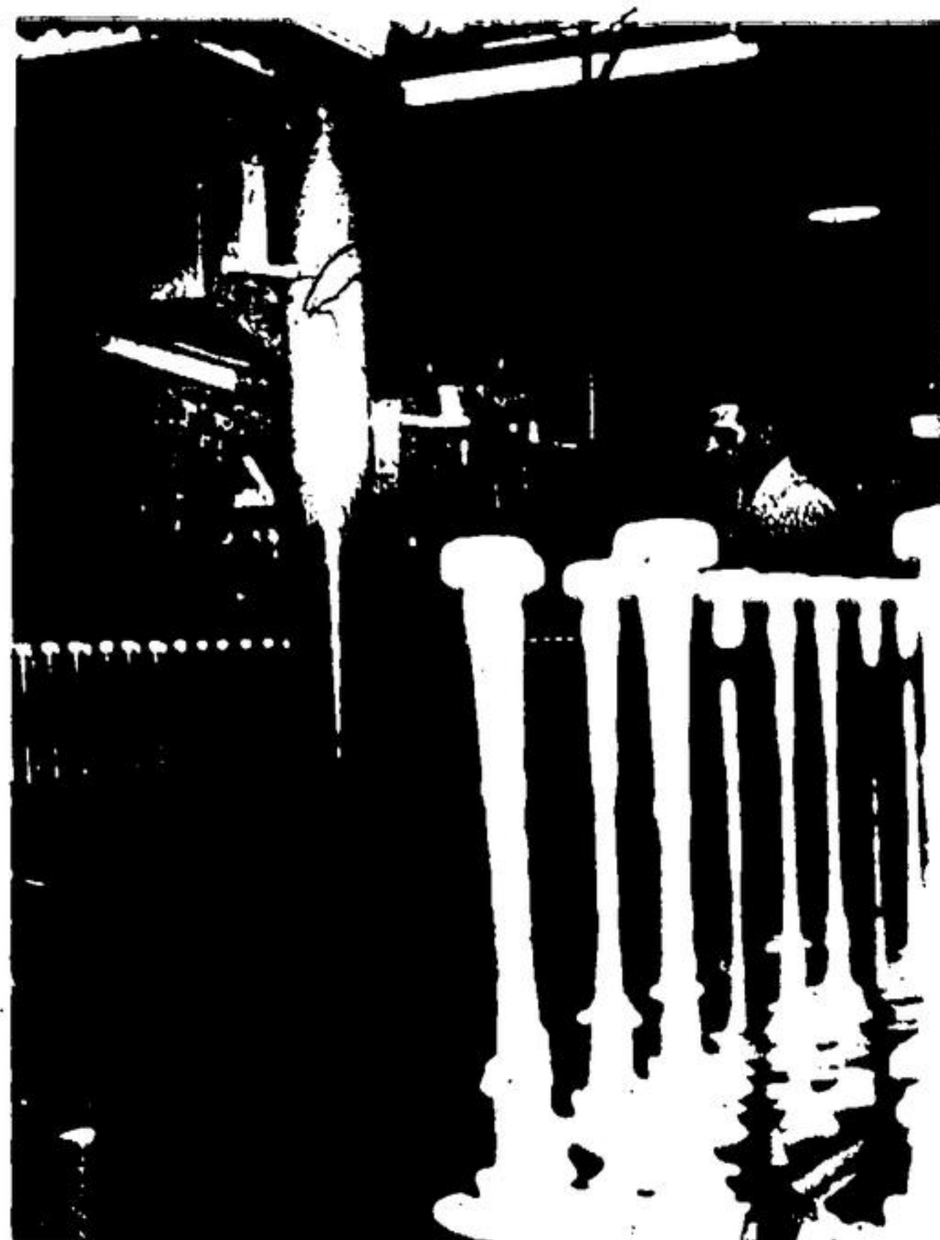
THEY GO IN WHITE — they come out gold. George Nickles operates the spraying machine which puts plastic bottle caps through a specialized gold lacquer process. About one hundred million are produced each year for the Canadian market.