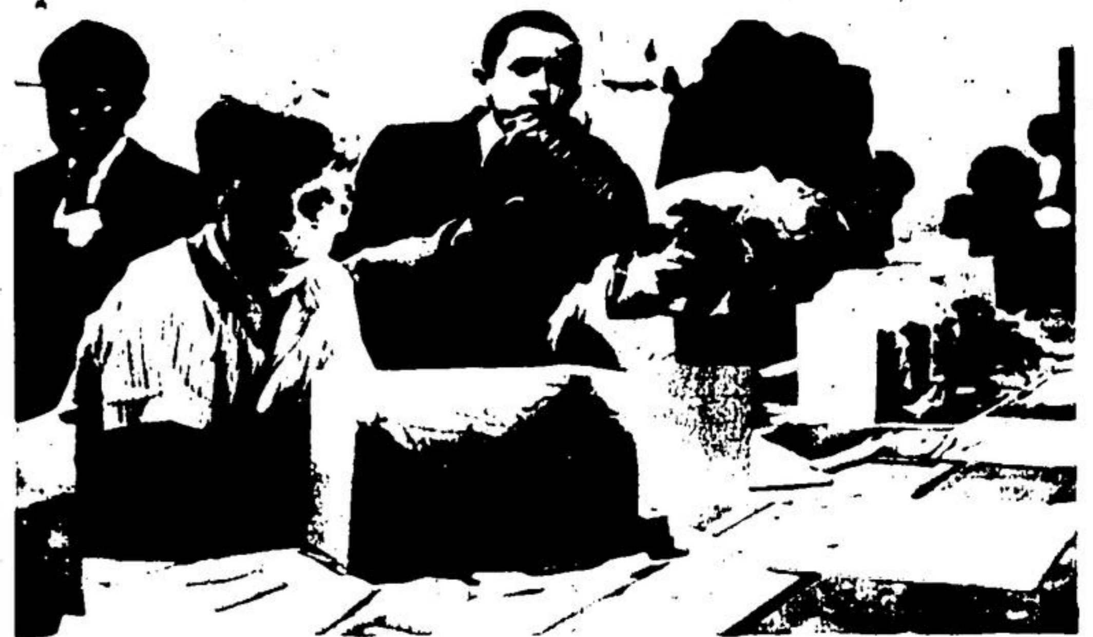
DISPLAYS ARE INSPECTED by the children who attended the Vacation Bible School at Beth-El Christian Reformed Church.

Brown-shelled or white-shelled eggs? Nutrition and quality within the shell are identical. If the price is equal, it's matter of color preference.