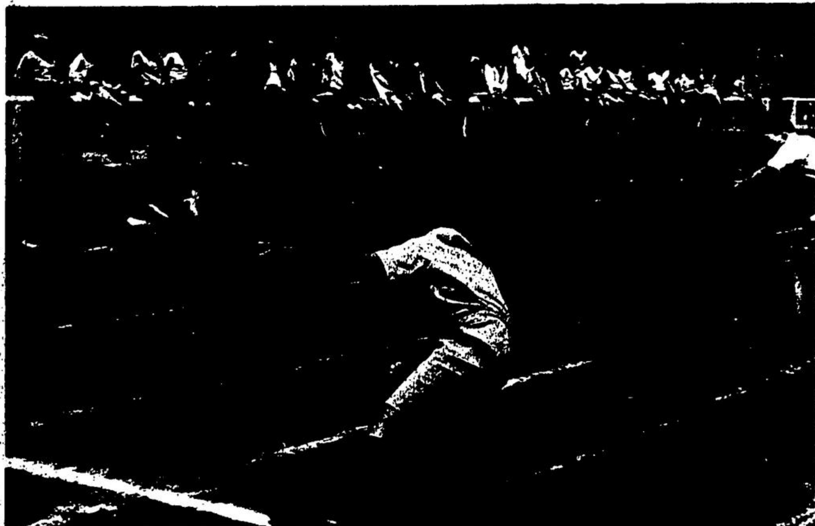
A PIG-TAILED PULLER on the Norval tug-of-war team dug into the dust, but it wasn't enough to defeat Limehouse strong-arms.