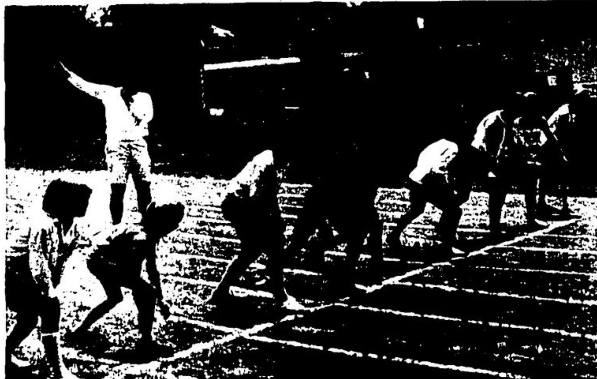
GETTING SET for the minor bantam girls' 220 race are representatives from the five schools that battled for top points in Esquesing town-