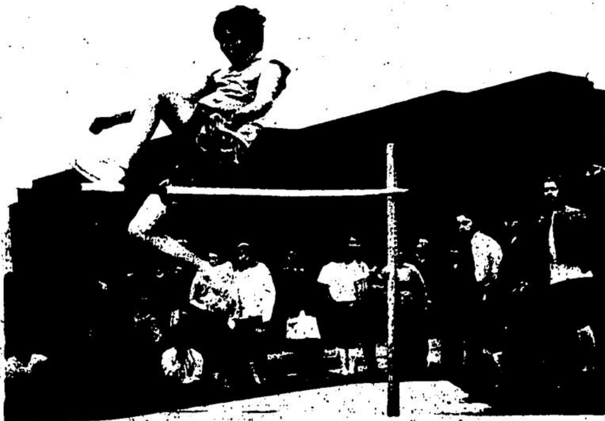
ROADS, YOU'VE GOT TO BE KIDDING! Distinctive style of jumping to place third in the intermediate boys' high jump at Halton County field day.