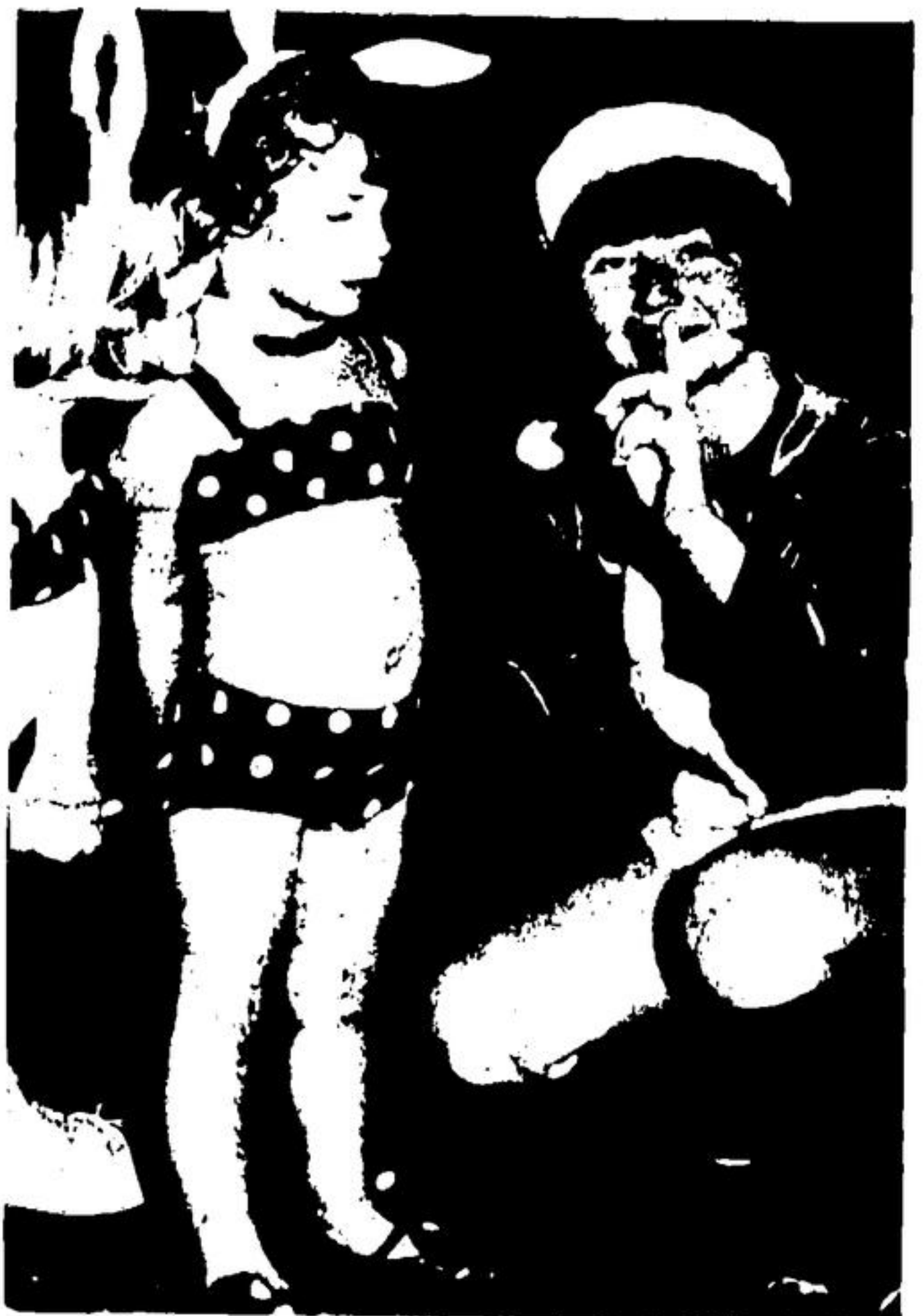
BACKSTAGE , just before the bunny girls were due on stage, a couple of them whispered to a dancing Santa what they'd like for Christmas. (Staff Photo)