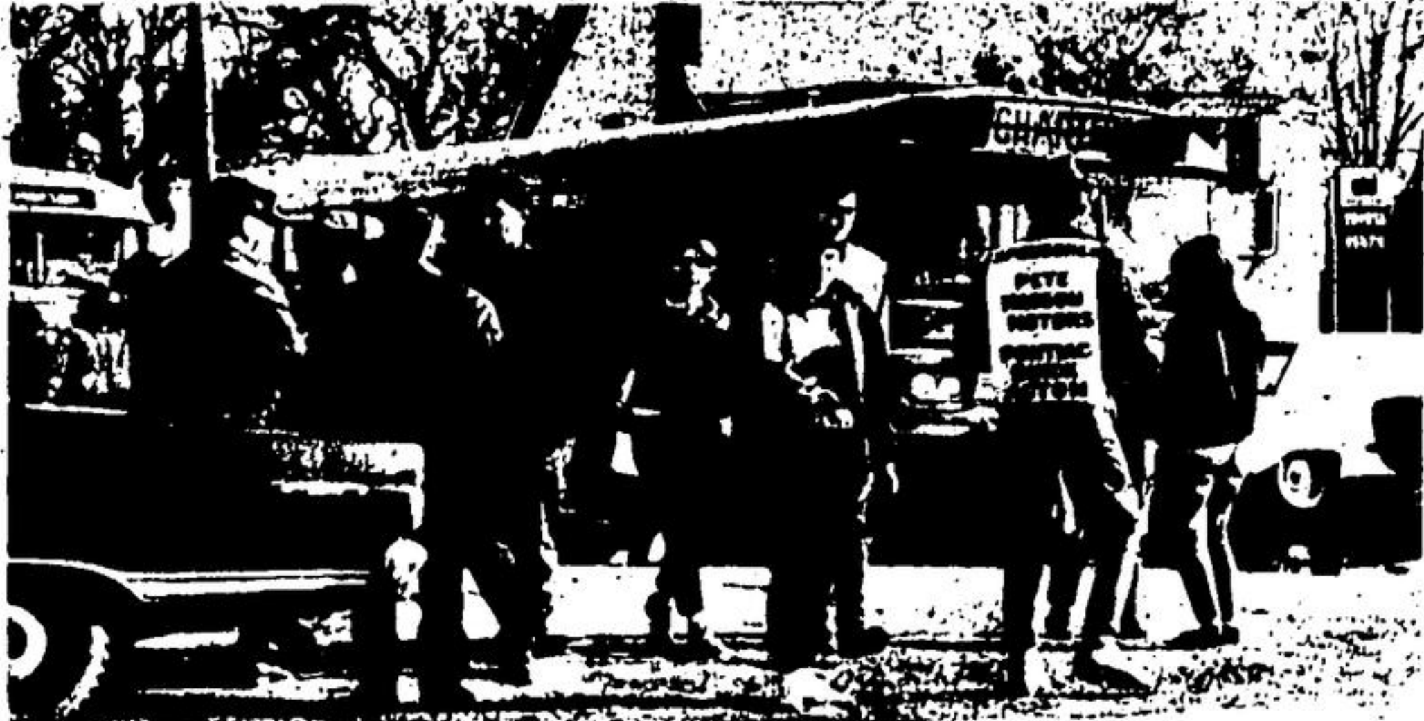
UNLOADING Clarence Denny's bus at Thornhill, marchers didn't take long to hit the road on the first stretch of their 40 mile hike. More than half the hikers finished, raising over $1,300 for the Cancer Society.