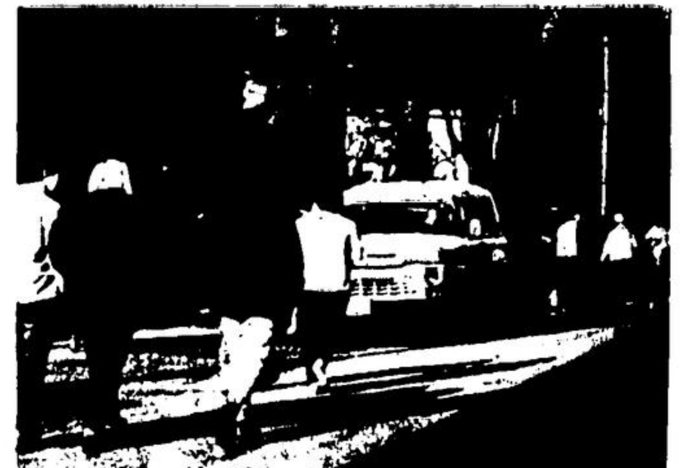
THE ST. JOHN AMBULANCE was on duty all day, aiding walkers, picking up stragglers, treating blisters and chaffed legs.

If you destroy a free market, you create a black market. If you have 10,000 regulations, you destroy all respect for the law — Sir Winston Churchill. Disposable income is called "take-home pay" because after taxes and deductions you can't afford to go anywhere else with it.