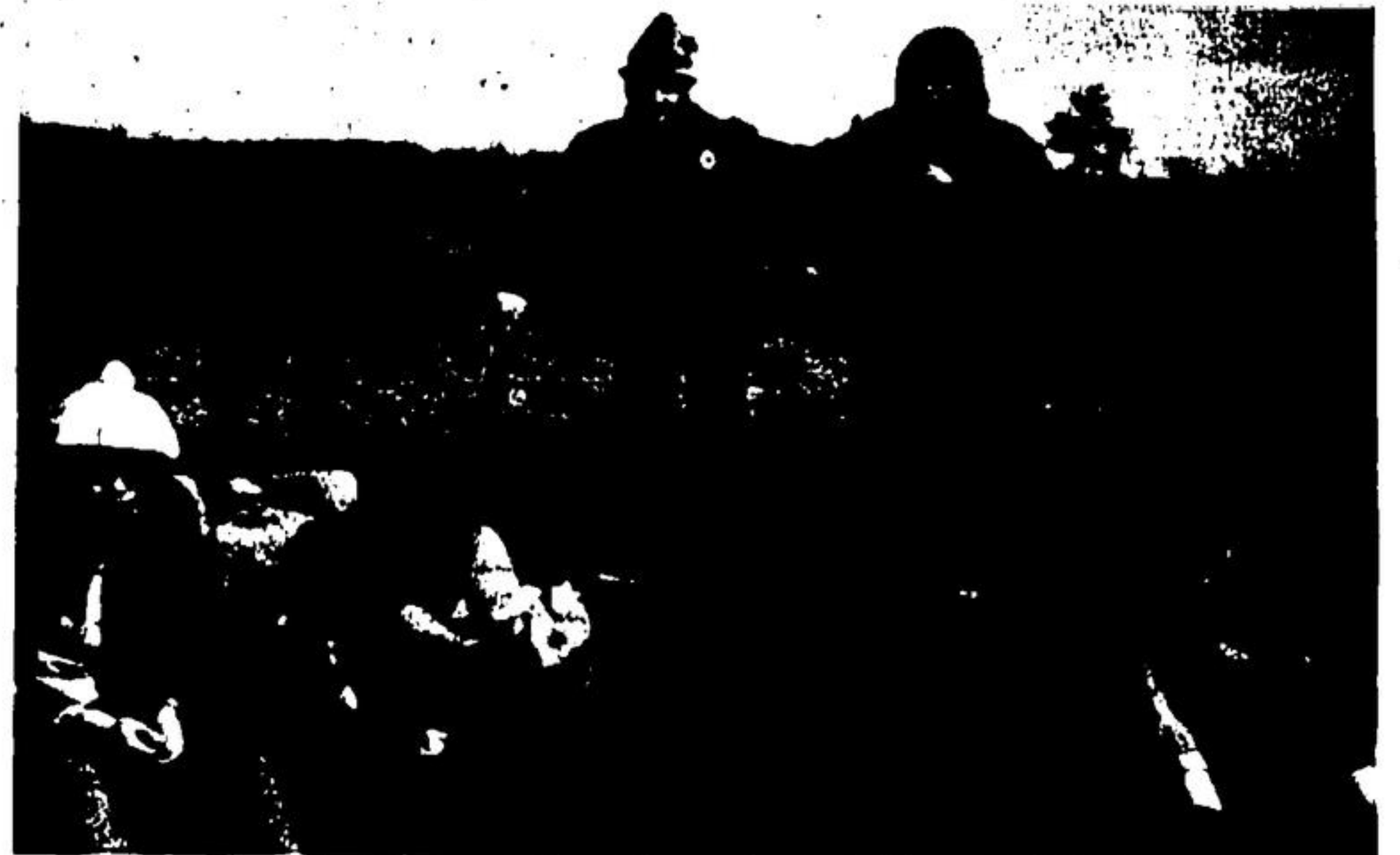
NO, THEY DIDN'T just come over the Matterhorn. They are marathon walkers helping to raise money for the cancer society.