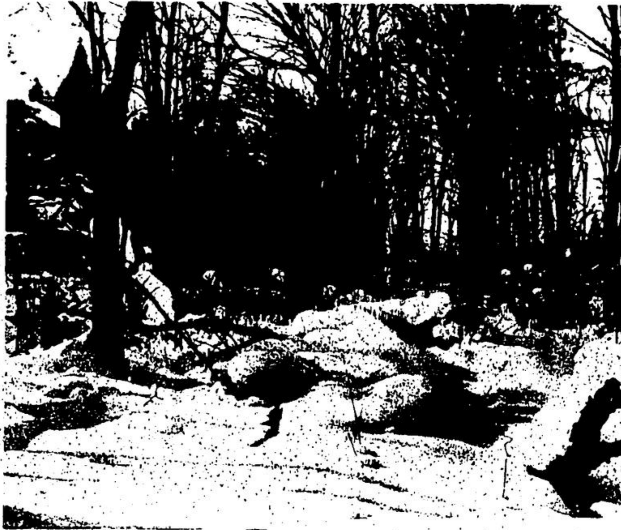
Sun floods tangled bush with light Early afternoon shadows create patterns in black and white.