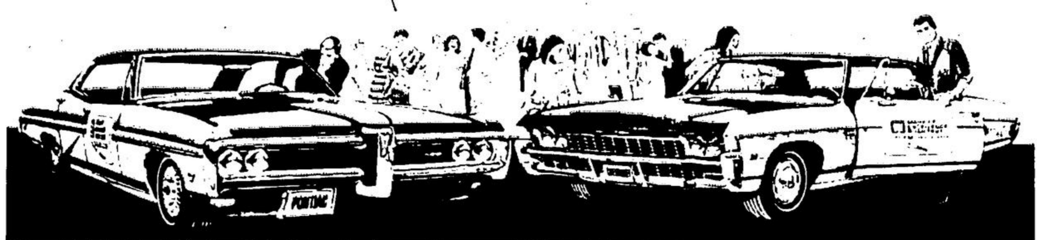
Left: Pontiac Parisienne Sport Sedan Right: Chevrolet Impala Custom Coupe

INVITE YOU to test drive the only cars that bear the Mark of Excellence. See, hear, and feel for yourself GM's margin of superiority over the other 1968 cars. Driving is believing! Come in today! Your test car is waiting.