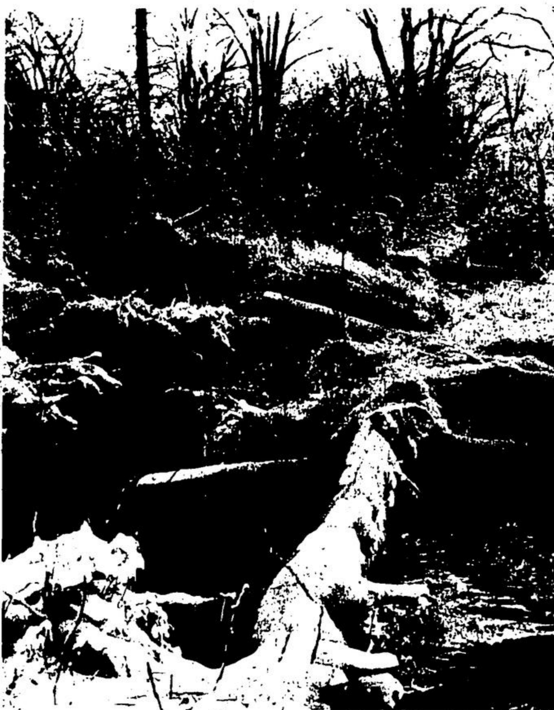
TANGLED WEEDS and fallen logs become lacy fringe in the aftermath of a winter ice storm. The Black Creek, near the sewage plant, glistens as the sun's rays soften the snow and turn trees into glistening necklaces hung on the valley.

She: I don't think I look 30, dear, do you? He: No pet, but you used to.