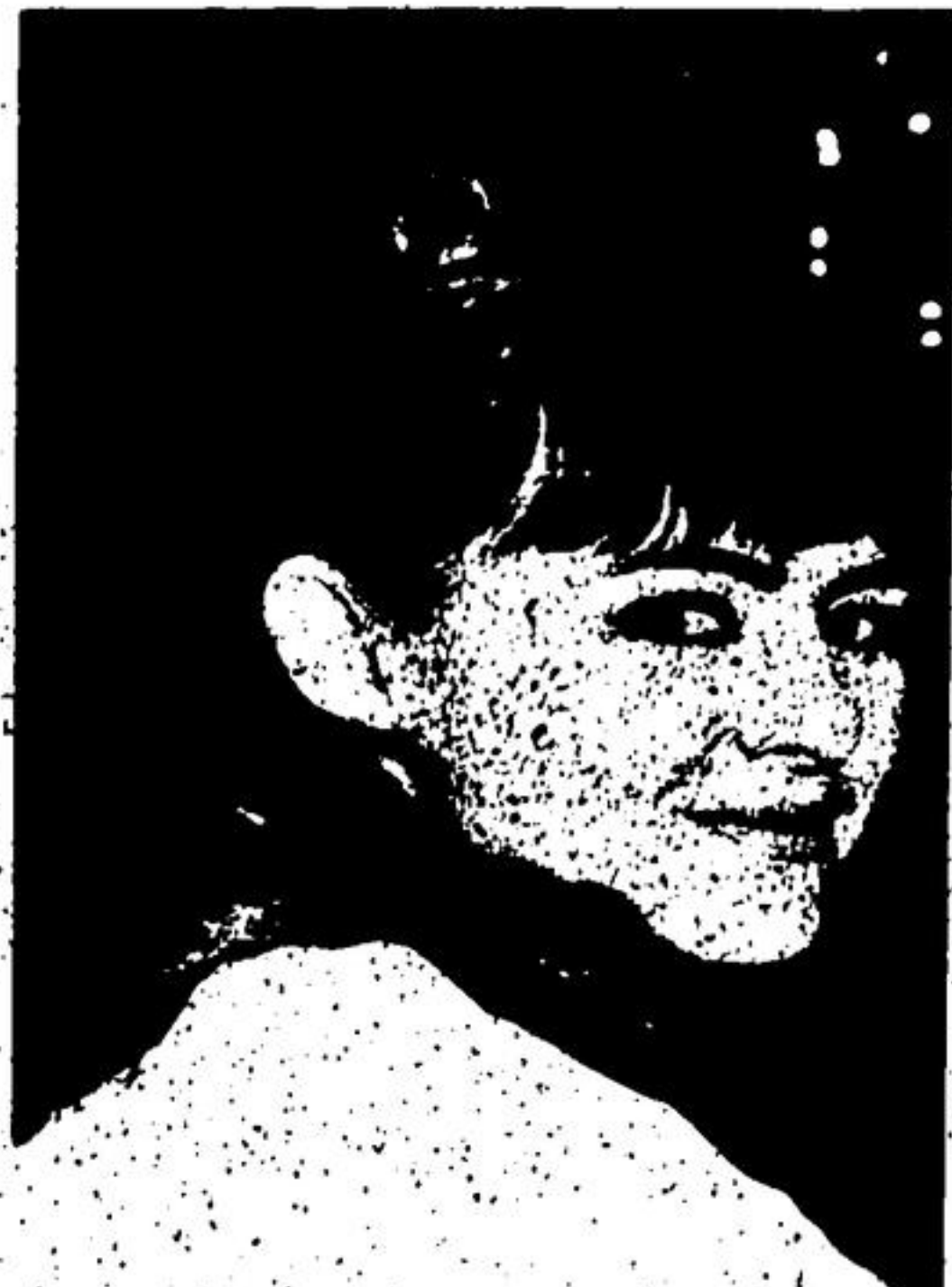
and then low as fall is changed