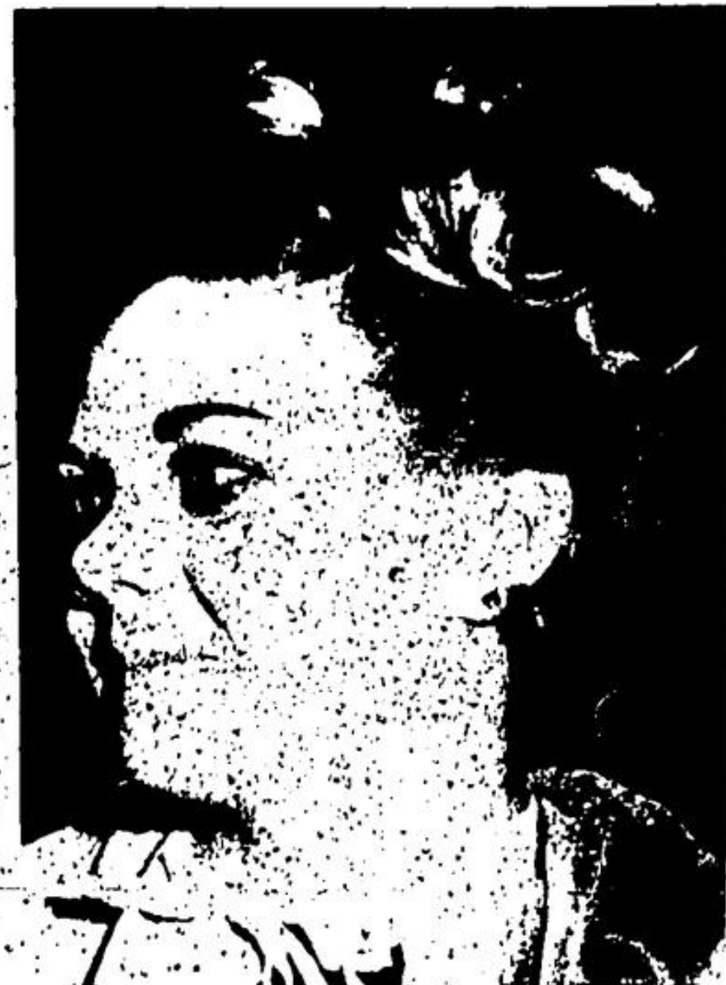
and festive curls from same hairpiece