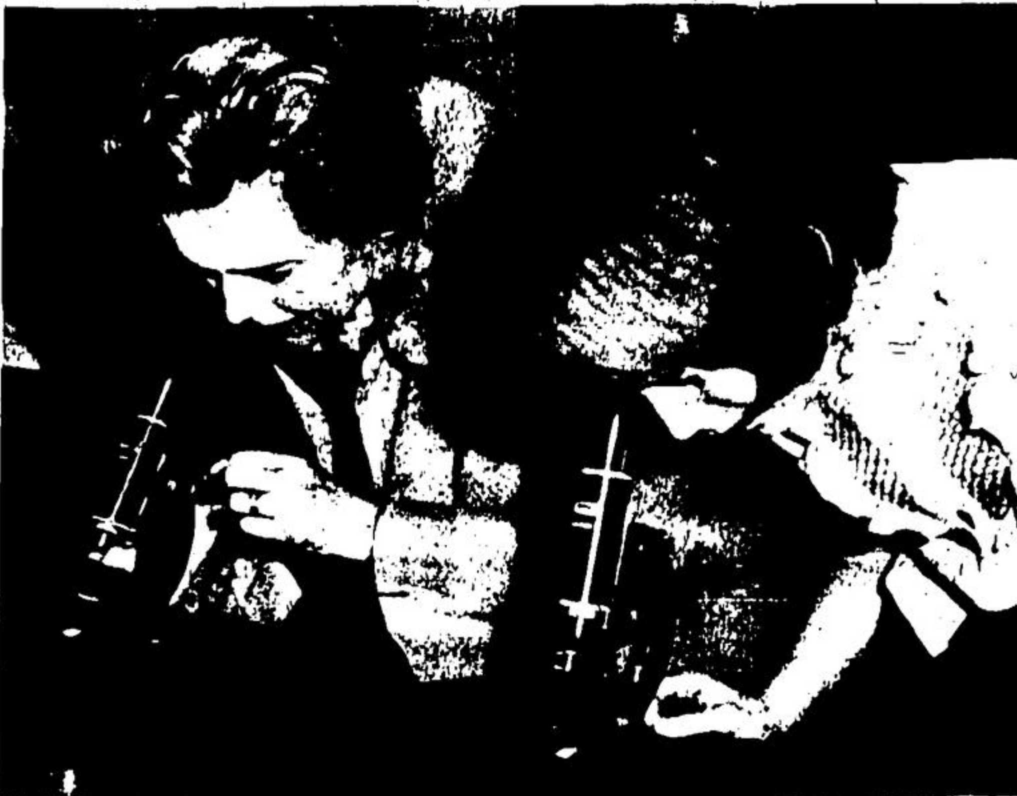
MICROSCOPES in the Stewarttown school science laboratory attracted these two visitors. The public took the opportunity to view the school after opening ceremonies were completed.