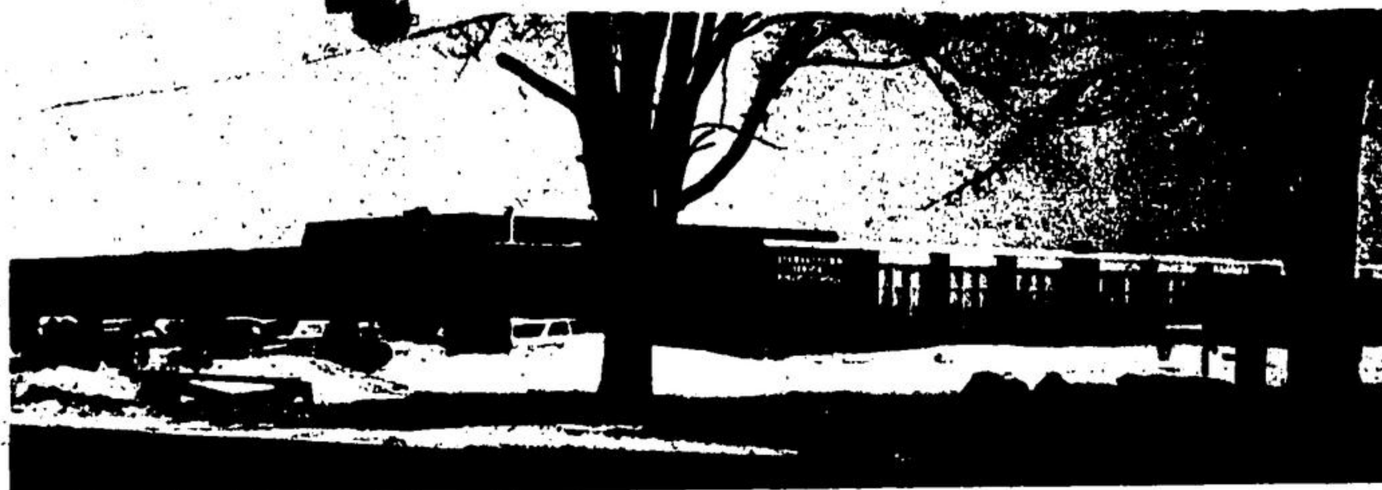
OFFICIAL OPENING of the centennial addition to the Stewarttown senior public school Friday night attracted hundreds of Esquesing ratepayers. Auditorium facilities were taxed and seating at a premium for the official ceremonies in spite of blustery weather which made driving hazardous. The addition added four classrooms, a gym, home economics room, library, industrial arts, science and art rooms to the school.

Architects for the school addition were the firm of Barnitt and Hader; General contractors were A. J. McCarthy and L. J. Zanatta Construction.