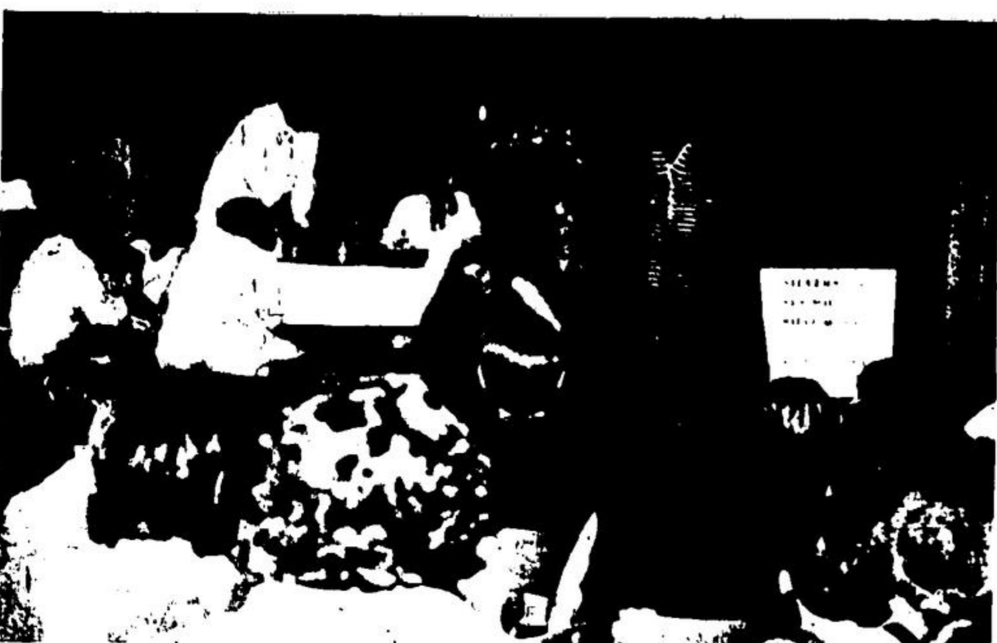
SILVERWOOD 4-H CLUB members produced a hilarious skit about a pyjama party to demonstrate the ingredients for good sleeping garments, at the North Halton 4-H clubs' achievement day in Ballinacod Hall on Saturday. Members are shown on stage while the audience roars at their antics.