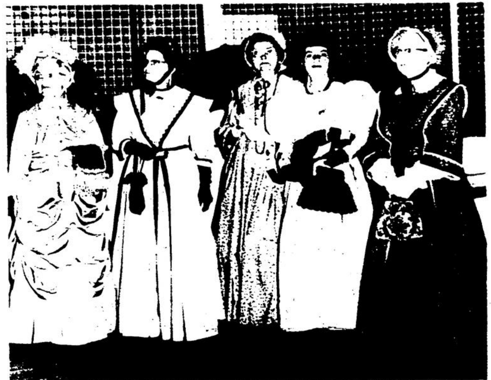
COMPETITION for old fashioned dresses was keen among ladies in this district for centennial year. Variety and style shown would have been envied by pioneer women.