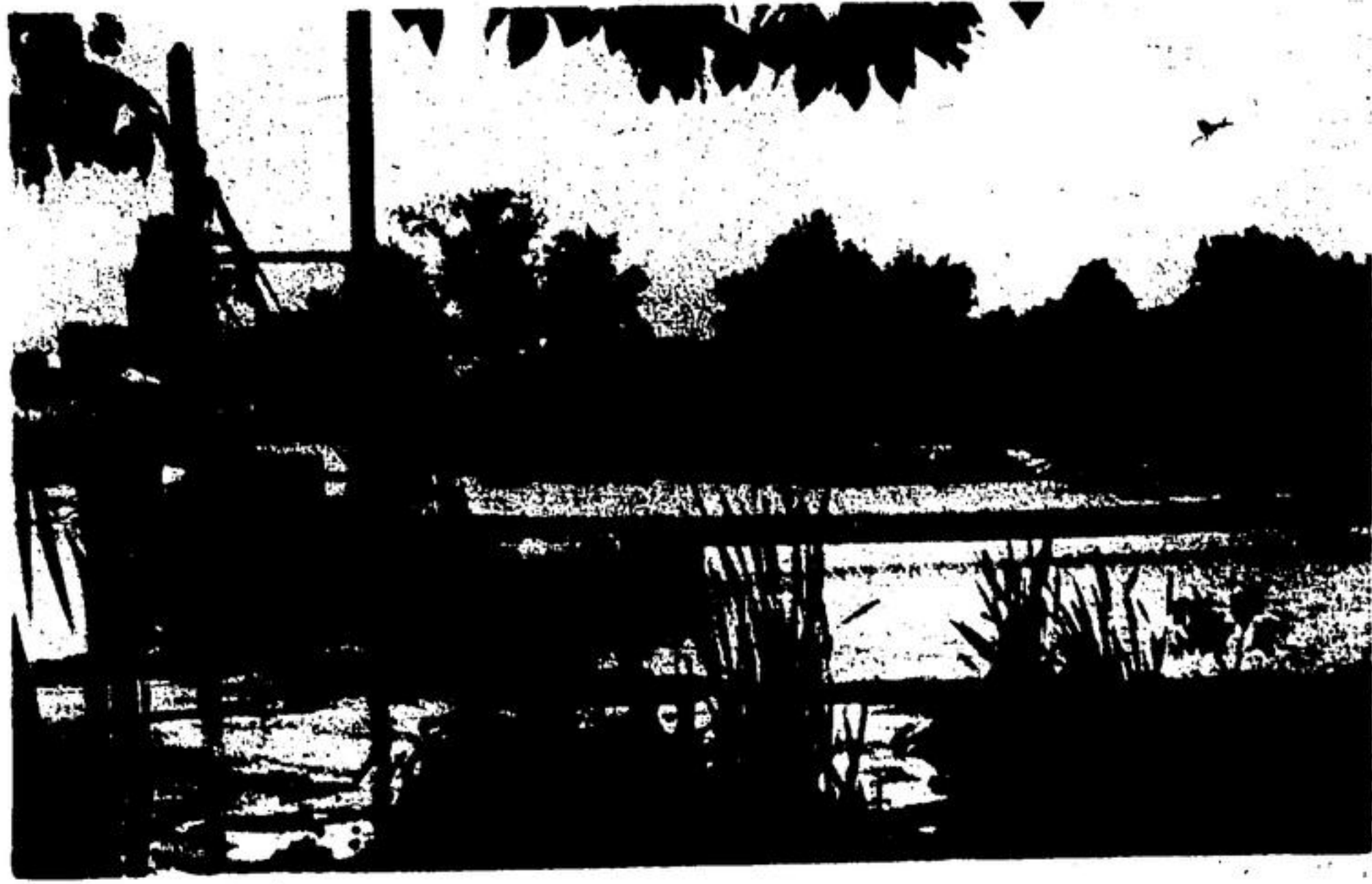
START OF DREDGING on Fairy Lake was another highlight of centennial year. A pilot project, cost of which is borne mainly by the government, dredging is expected to aid river control on the Credit.