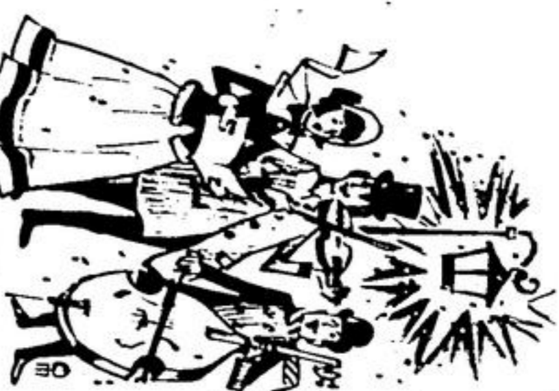
66-Mat Page 27