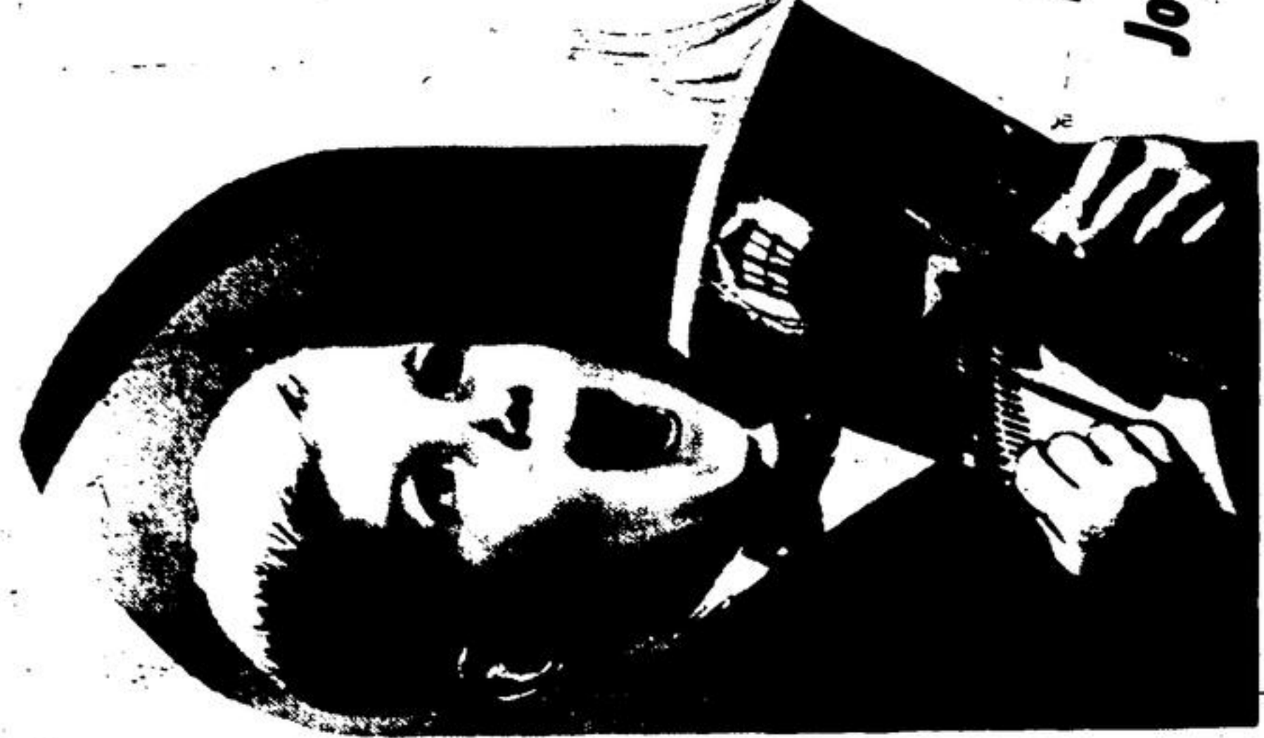
Carolers Proclaim the Joyous Day...