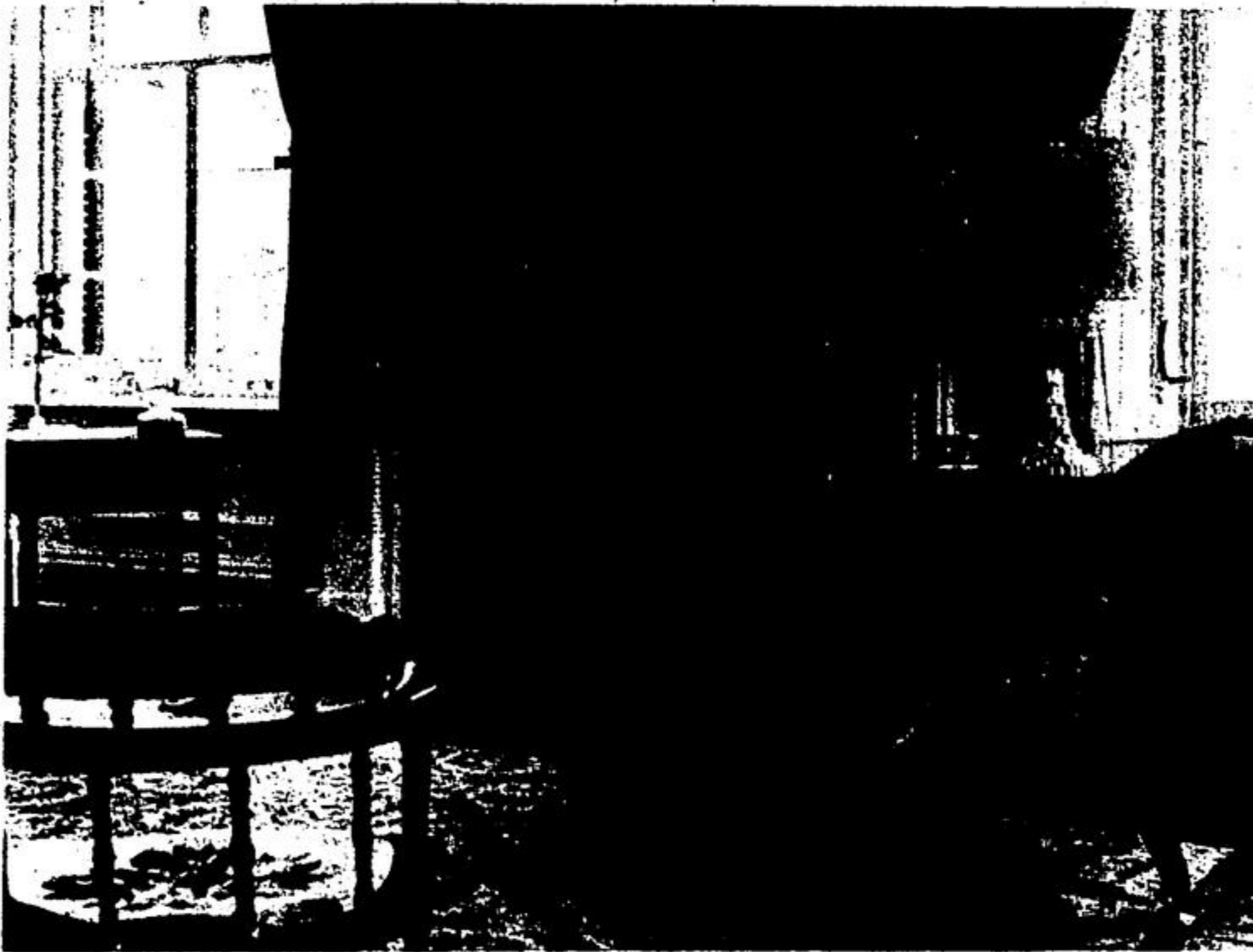
FORMAL LIVING ROOM FEATURES FIREPLACE