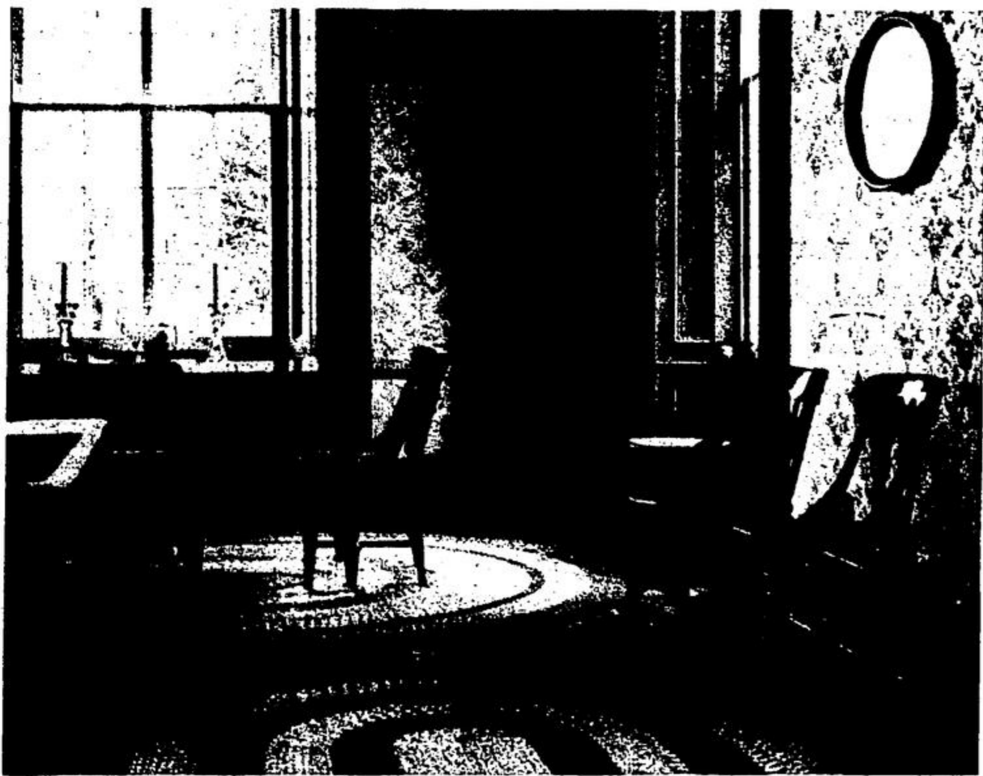
A VIEW OF THE DINING ROOM