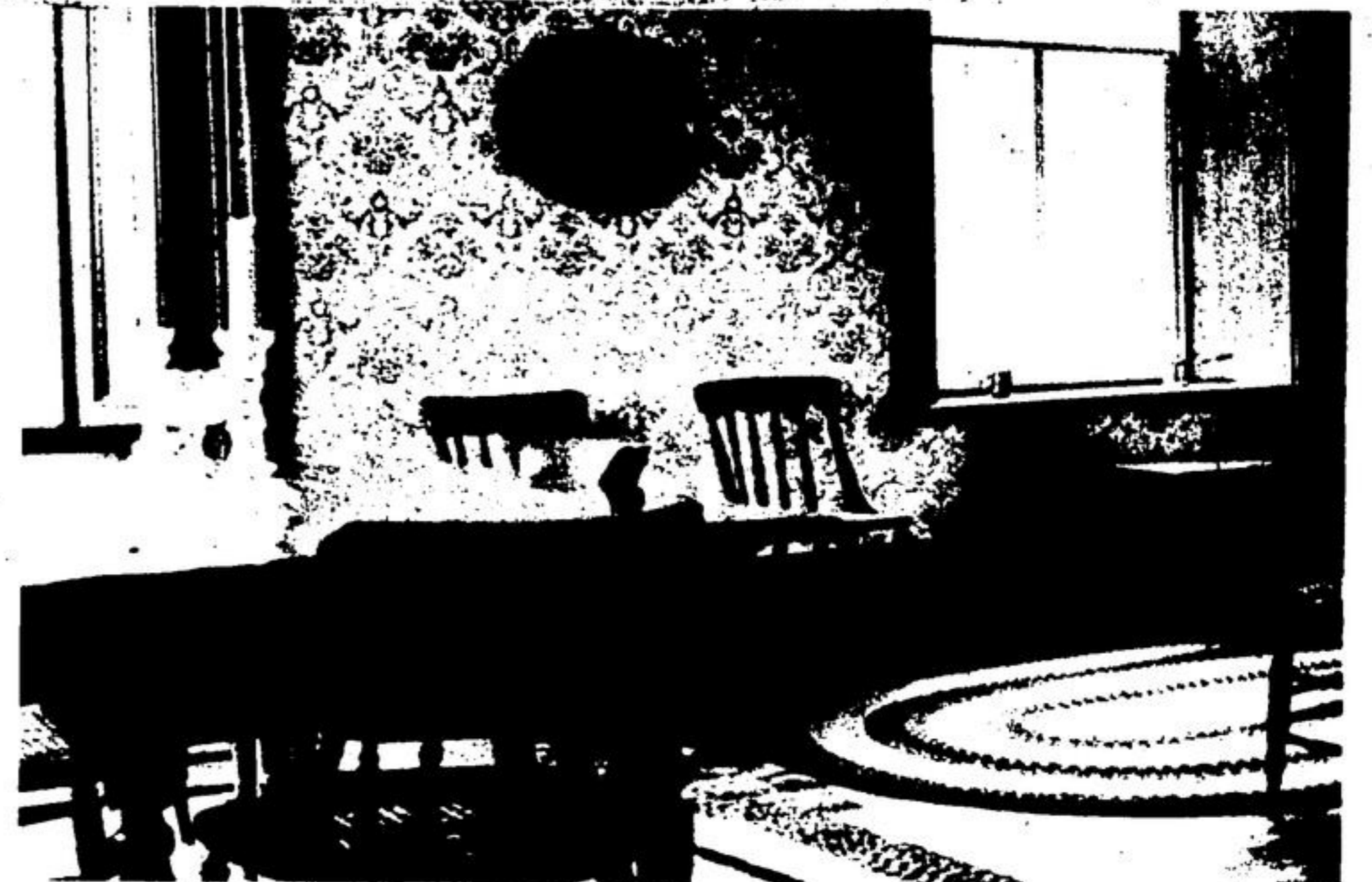
REFINISHED WOODWORK IN DINING ROOM