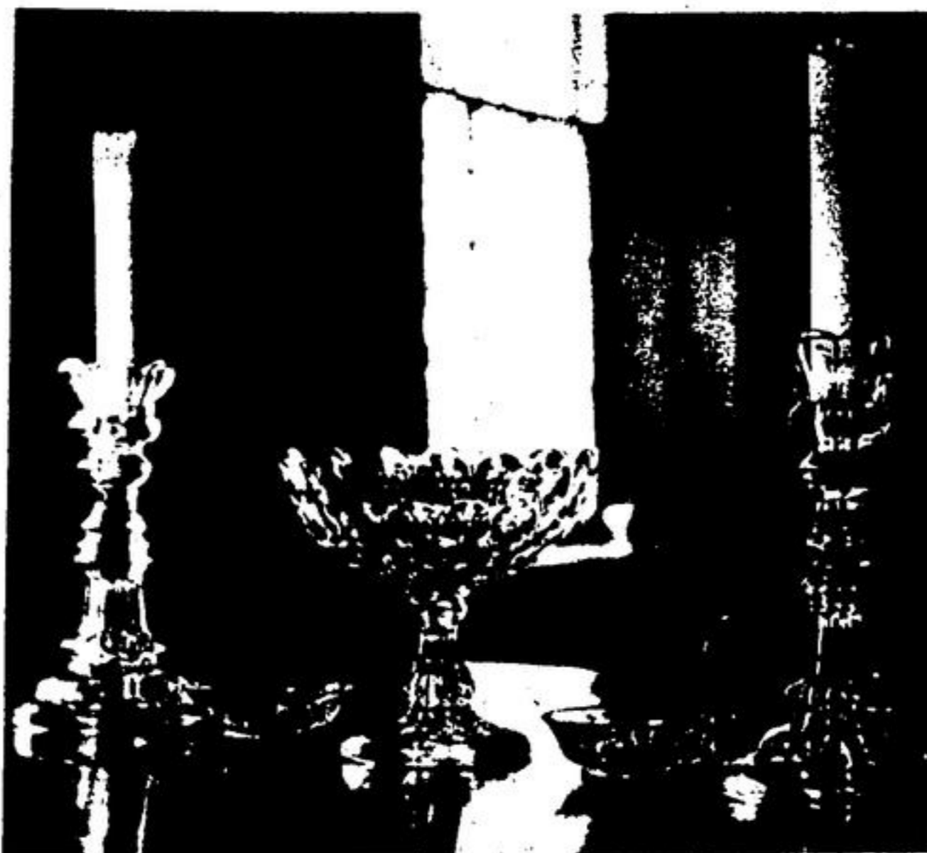
PIECES FROM COLLECTION OF GLASS