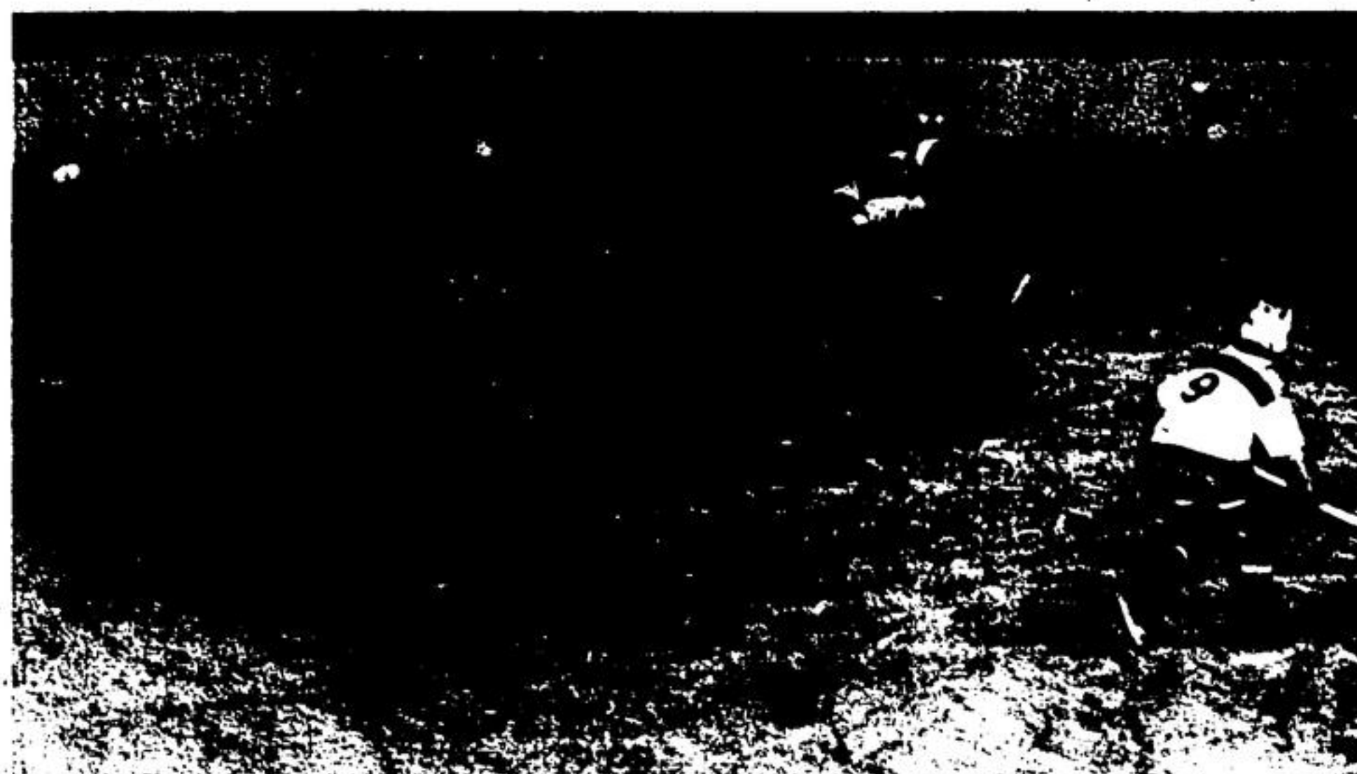
LEGION TOWN LEAGUE hockey started last week at the community centre but games were called exhibitions until team rosters were settled. All divisions get down to the regular schedule this Thursday and Saturday, league officials say if more players of midget age register, there could possibly be a midget section.