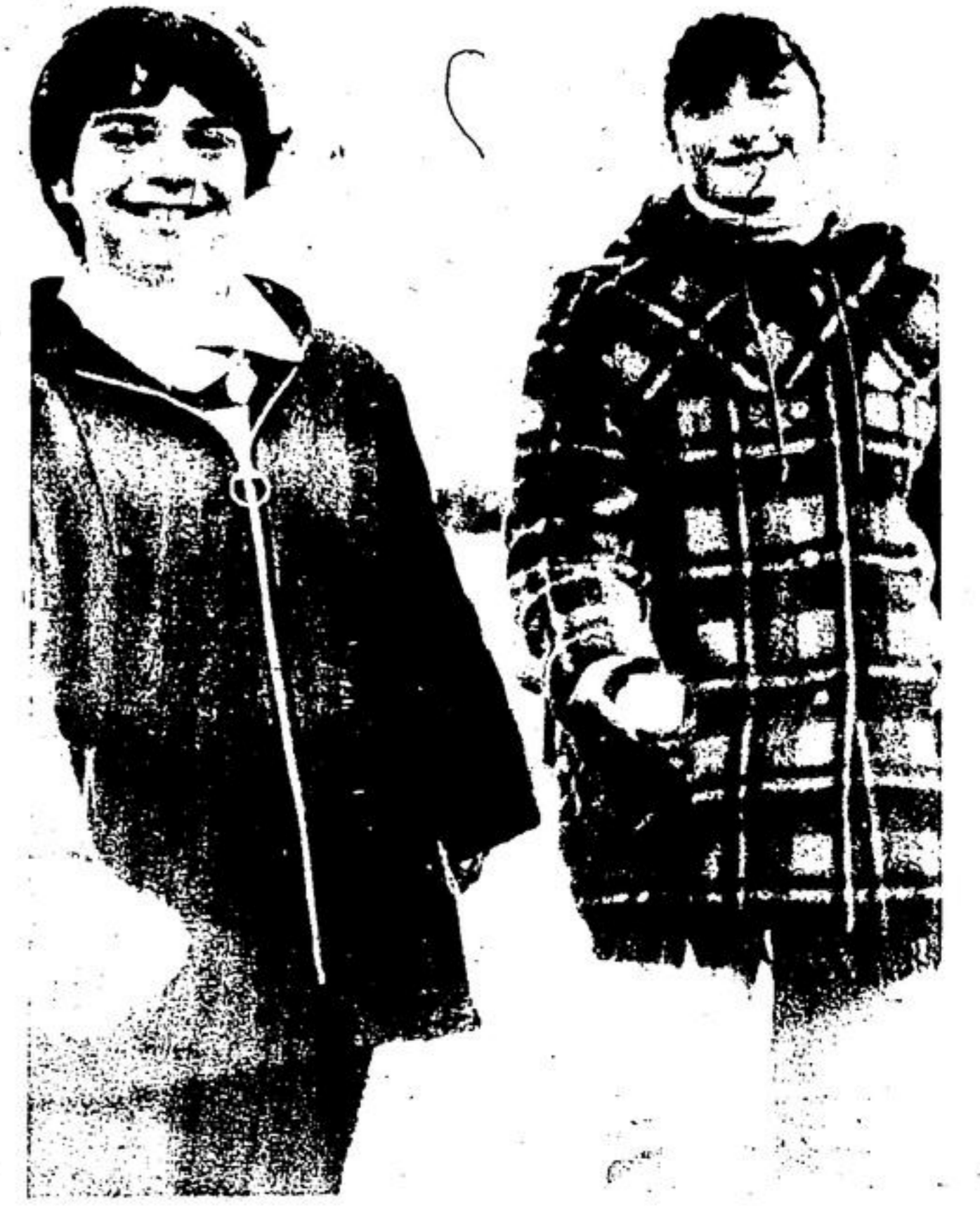
BY THE BRISTOL... Teachers... walk along it