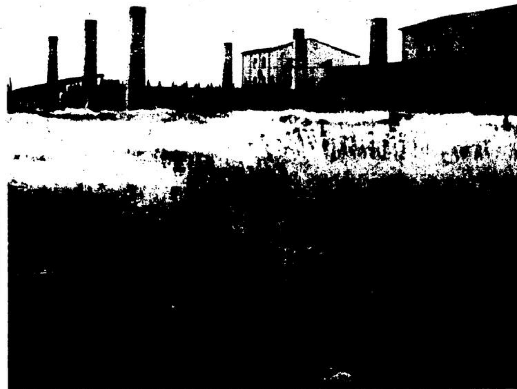
DESERTED BRICK PLANT along a deserted railroad speaks of days when the valley here was more industrious, where bricks were baked and shipped to district cities to build huge offices and residences. The earth is red here; hence the Latin word Terra (earth) Cotta (red). (Staff Photo)