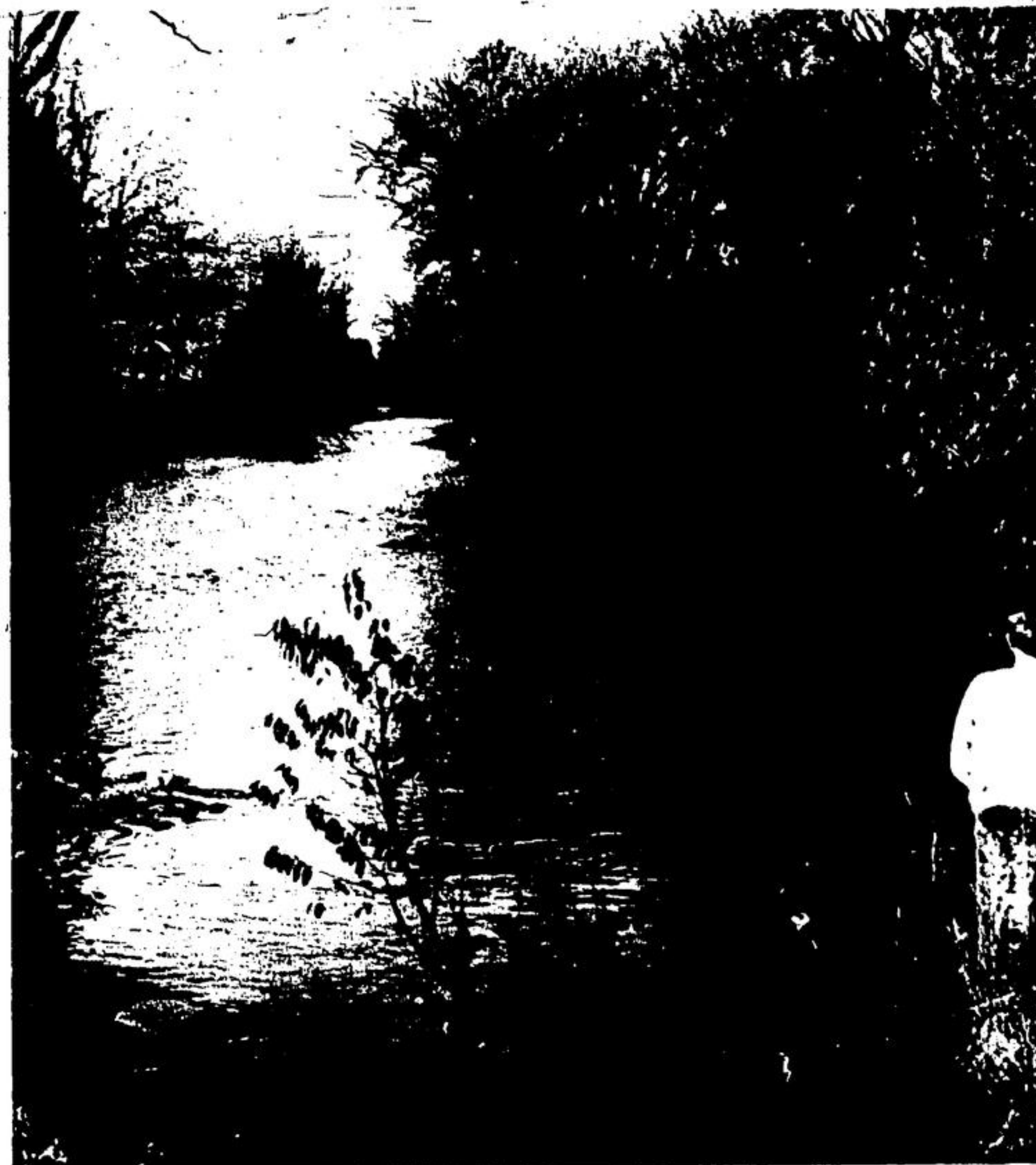
SUNLIGHT GLIMMERING on the steel grey water reflects the autumnal brilliance of the trees, contrasting with evergreens and yellowing grasses and weeds. The river takes no note of the Canadian autumn stopping only now and then in some quiet pool to collect eroding banks and large logs before continuing its quest to Lake Ontario. Did the red men one day coast by here in their canoes?