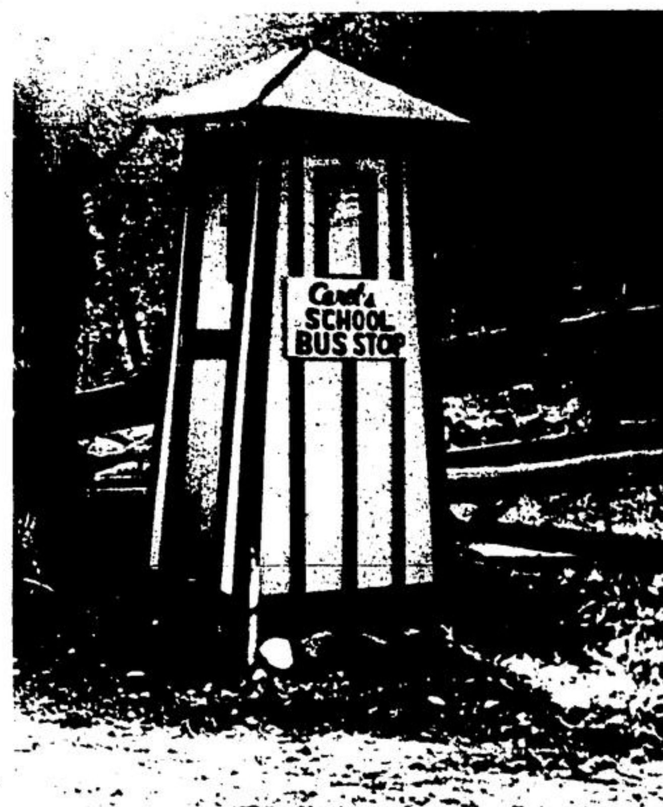
IN A CANADIAN WOODLAND setting even the Queen could be envious of, this sentry box is ingeniously constructed for a daughter to step into a modern school bus. It is on the ninth line.