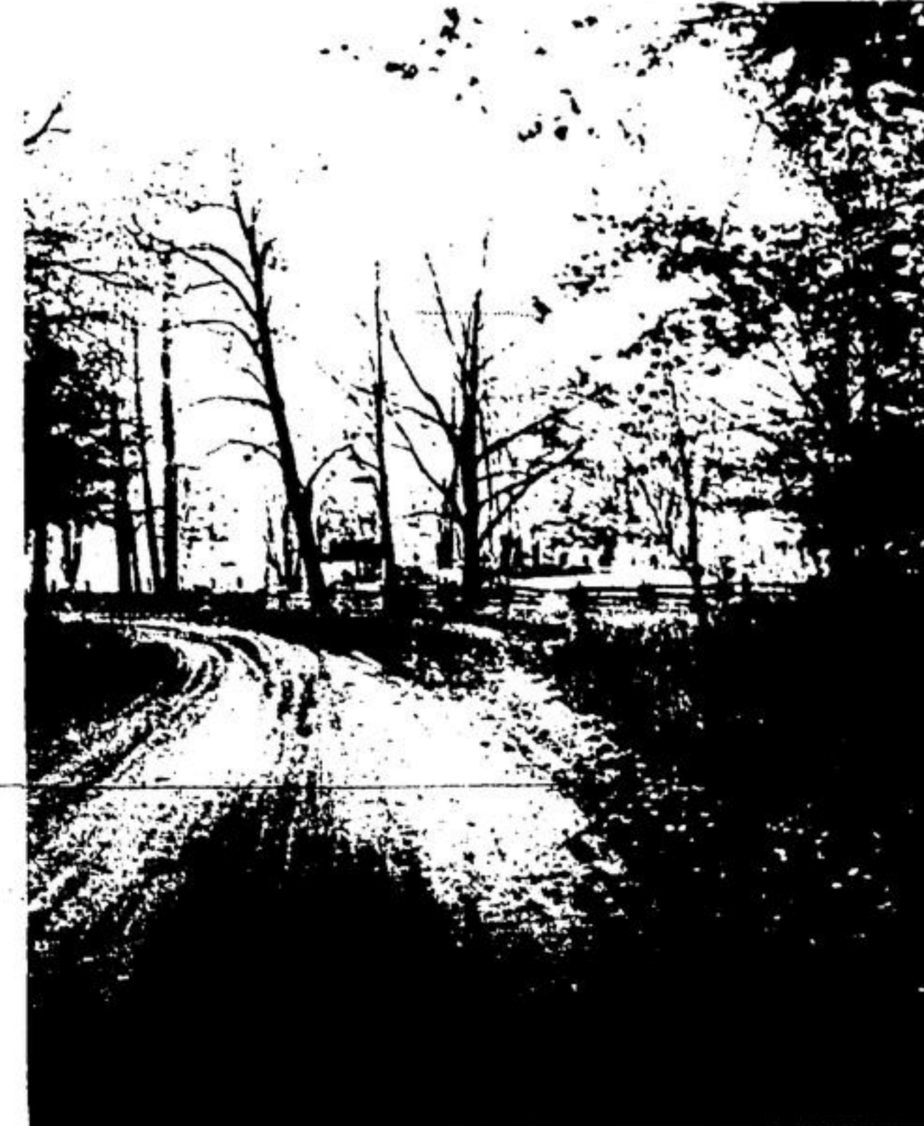
EACH NEW TURN in the road brings some new delightful scene that delights the aesthetic in us. The sun's rays cast huge shadows and the earth does not take long to cool.