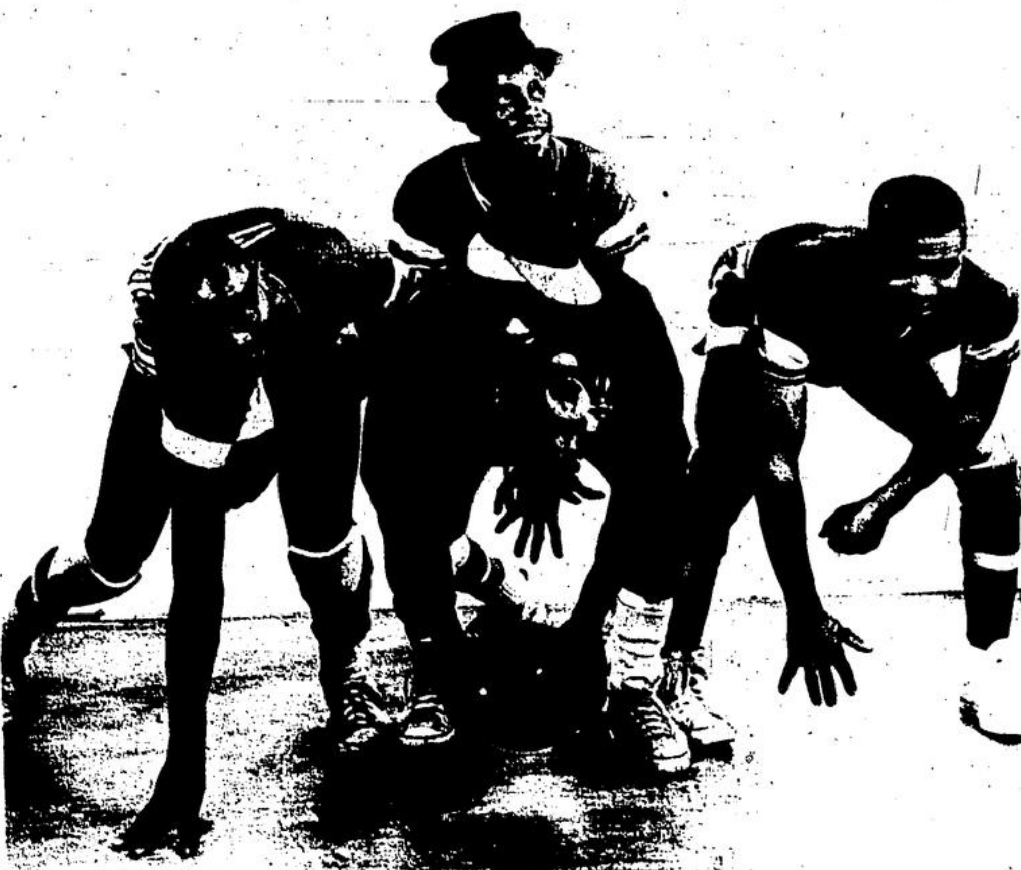
THE HARLEM DIPLOMATS will make an appearance at the high school gymnasium soon in aid of the athletic association. Their comical capers have been compared to the renowned Harlem Globe Trotters.